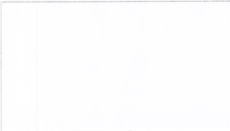
Wiring Photo and Notes: Turn Signal (Left)

The LR - RR wires are gray/black - gray/red at the trunk fuse box, 14 pin plug (C14), pins 6 and 2.