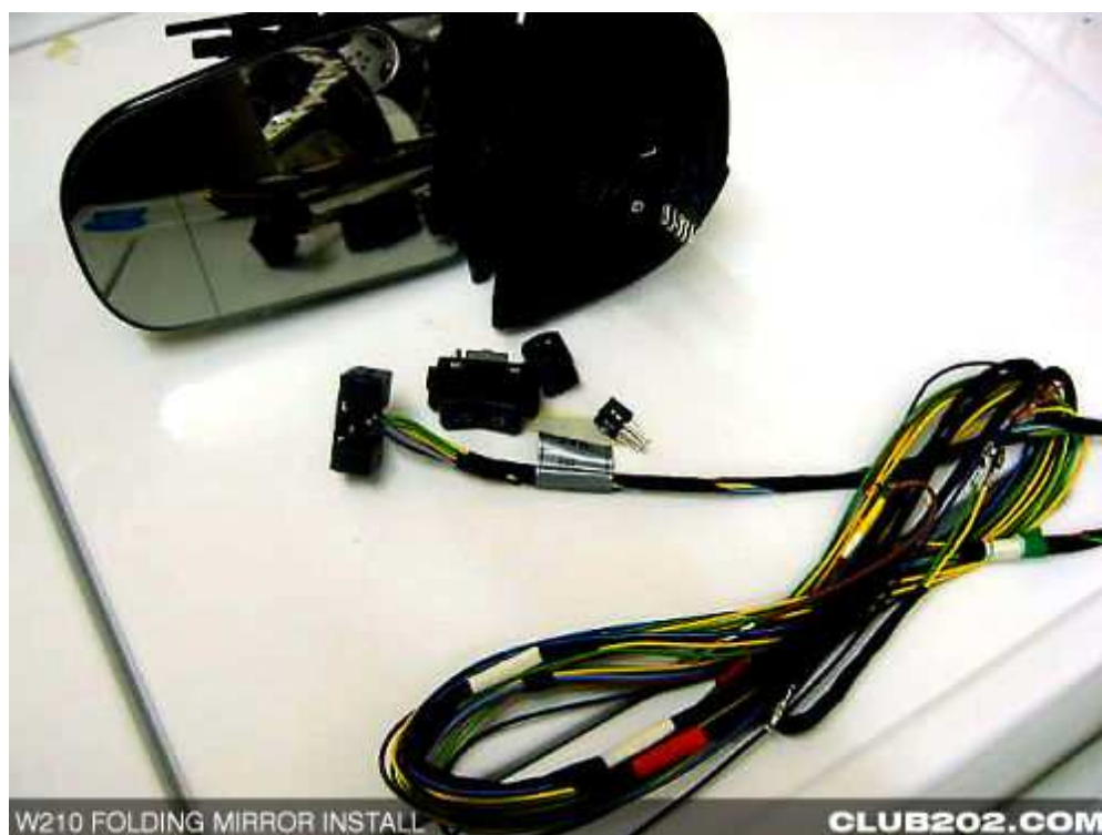
W210 FOLDING MIRROR INSTALL

While the W210 mirrors are enough to make other 202 owners do a double take, watching them see as your mirrors electronically fold into the side body is another. The parts are easily found at your local dealer or from our resident euro parts man Steve.