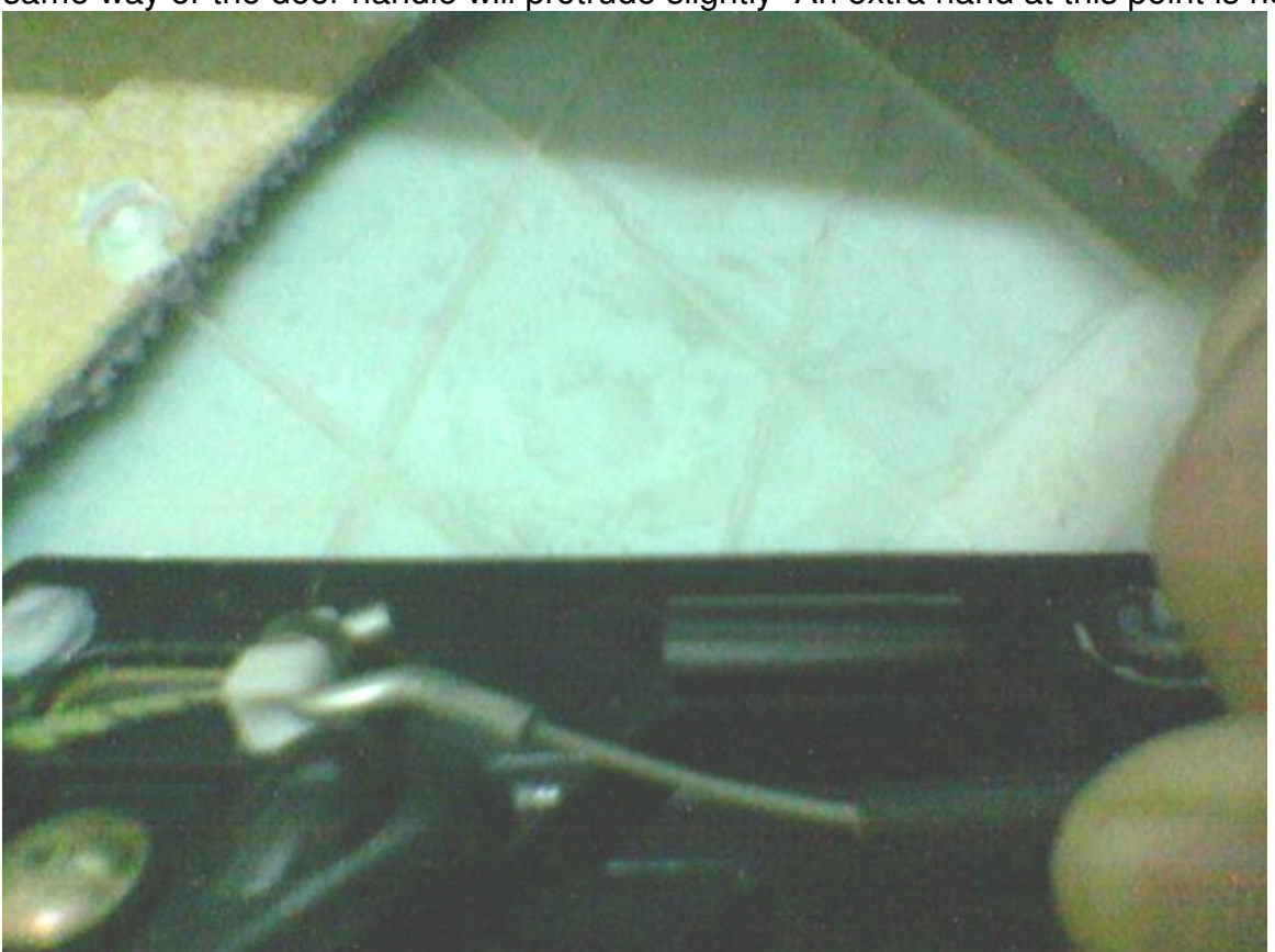
8-Unclip connector that connects window control at door connection (push small clip to release)

7-remove the cable from the pull handler- Note open end on white plastic piece- must go back same way or the door handle will protrude slightly- An extra hand at this point is helpful