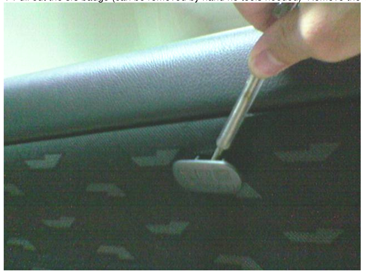
REMOVE DOOR PANEL C230 Coupe- Thanks to Gaiex- Updated by C230 Sport Coup 1-Pull out the srs badge (can be removed by hand no tools needed) Remove the T30 star screw

2-Under the door arm rest there is a cover, pop it off and remove the screw- T30 (drop the window)