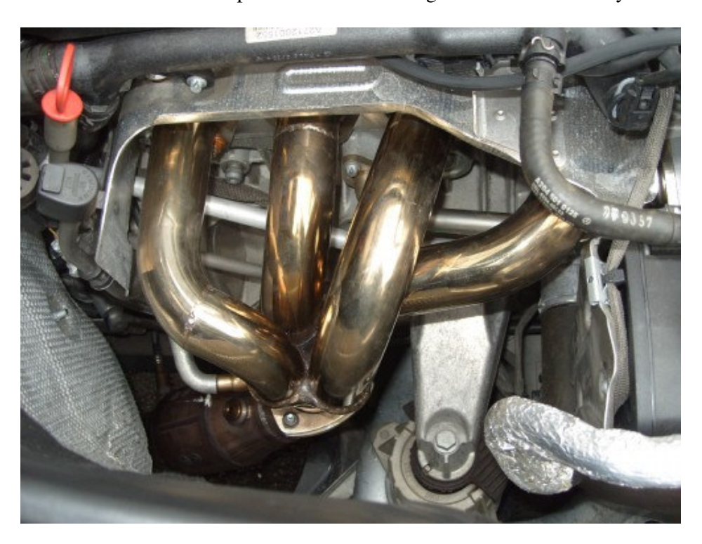
Step 16: Enjoy your Kleemann headers + downpipe with Cat. Check all the bolts after aprox. 500 km and re-tighten them if necessary