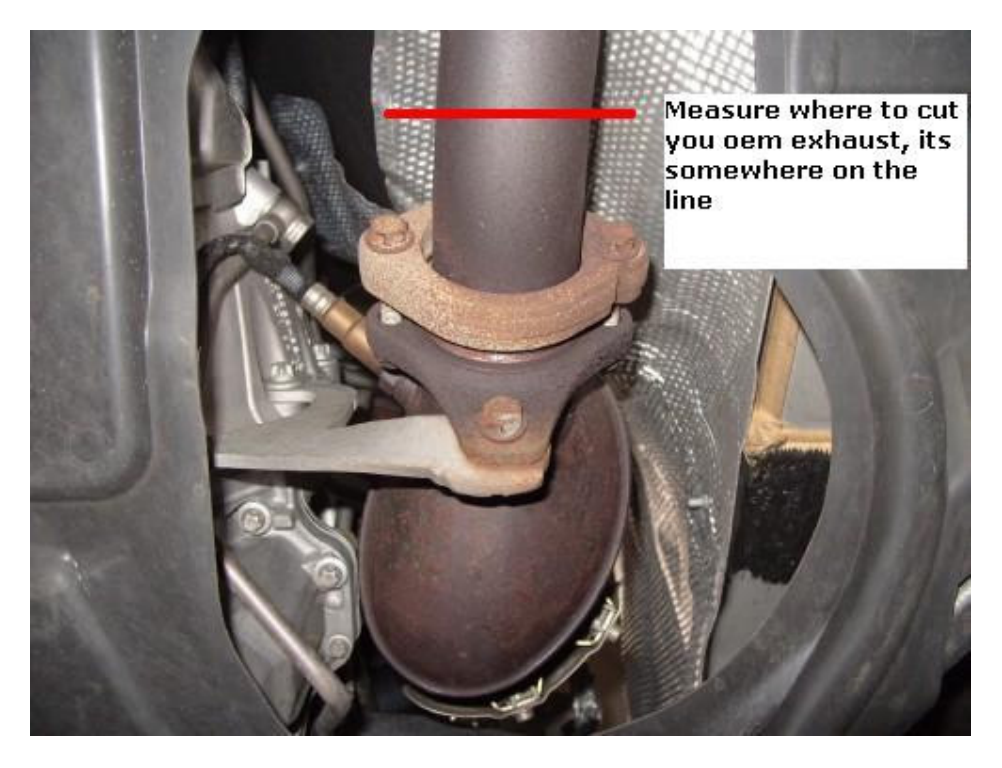
Step 9: May be you have to unscrew the 2 bolts, from the original exhaust to your car, to get some space. You can move your original exhaust easier.

Now first put the clamp who is in the box over your original exhaust.