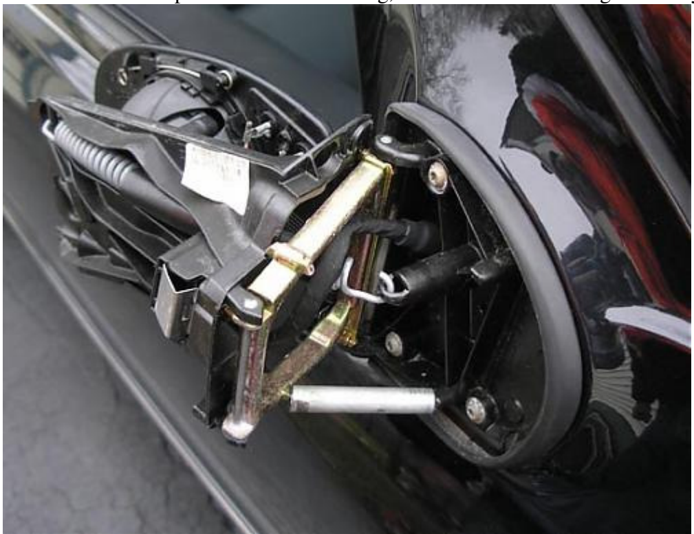
7. reinstall! Attached Thumbnails

6. make sure the clip will retain the housing, it should be self loading and ready.