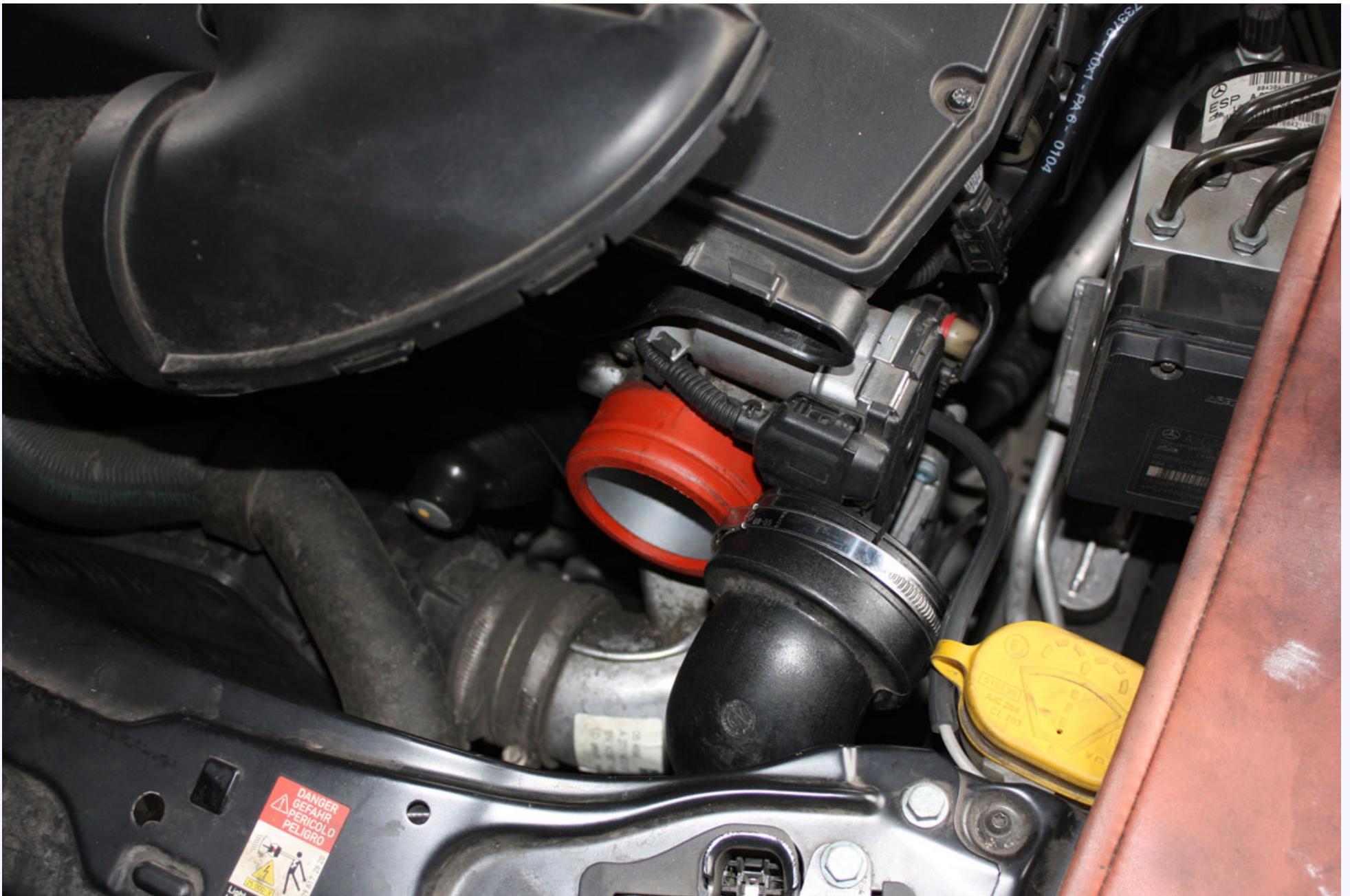
Now, that's one dirty throttle body!