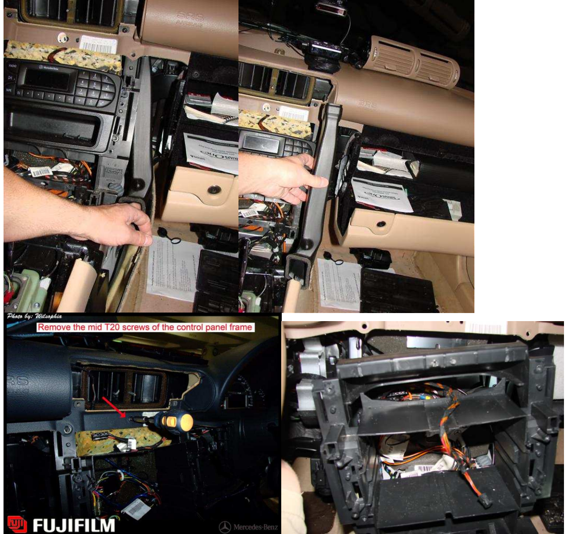
Page 20 of 27 Compiled by krazzdav Initial write up by Racin_fool

15. By doing this, you can now remove the vents on each side of the center console and set them aside. They are long black plastic air tubes. Now taking the flat tipped screwdriver (you may need a slightly larger/longer one), you can pop the two tabs that hold the black cage to the dash support. Remove it and set it aside.