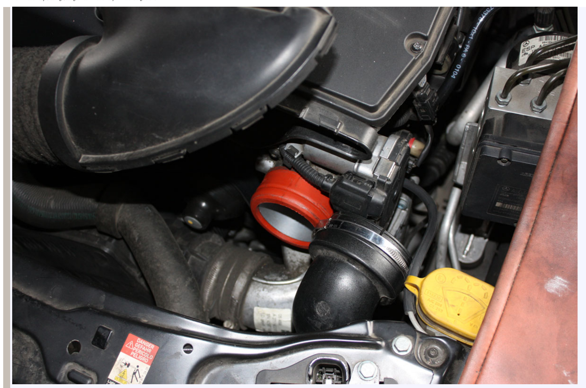
Now, that's one dirty throttle body!