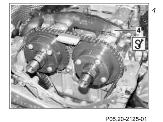
S Retaining device