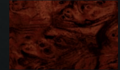
Burl Walnut wood 18