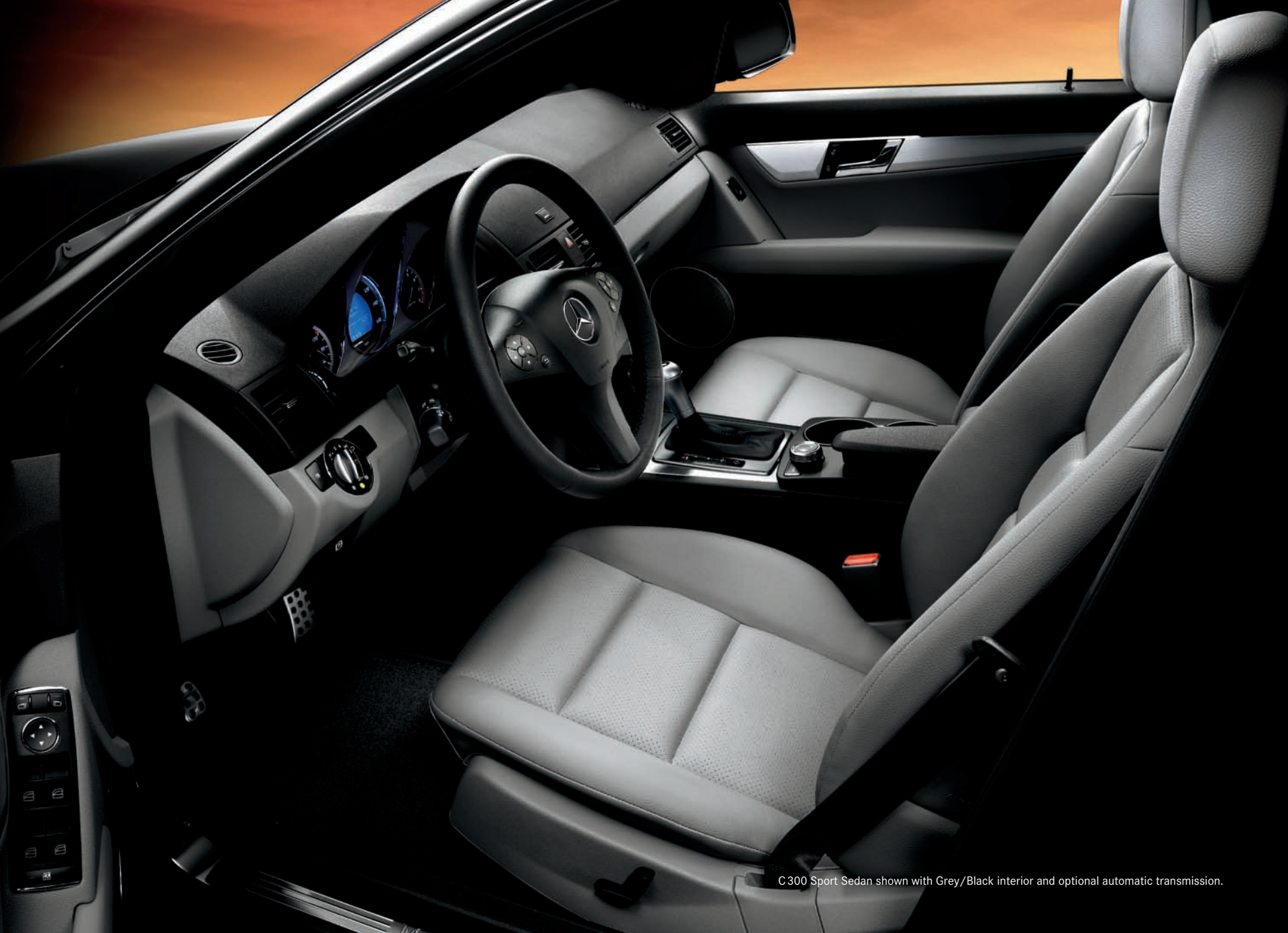
C300 Sport Sedan shown with Grey/Black interior and optional automatic transmission.