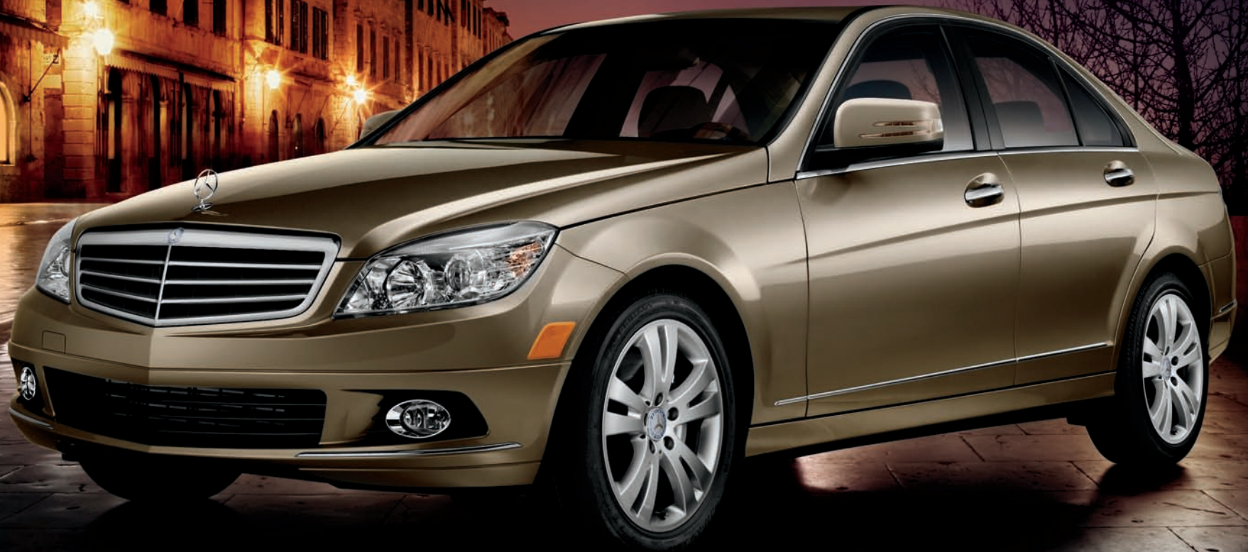
C 300 Luxury Sedan shown with optional Sand Beige metallic paint and Premium 1 Package. Please see endnotes at back of brochure.