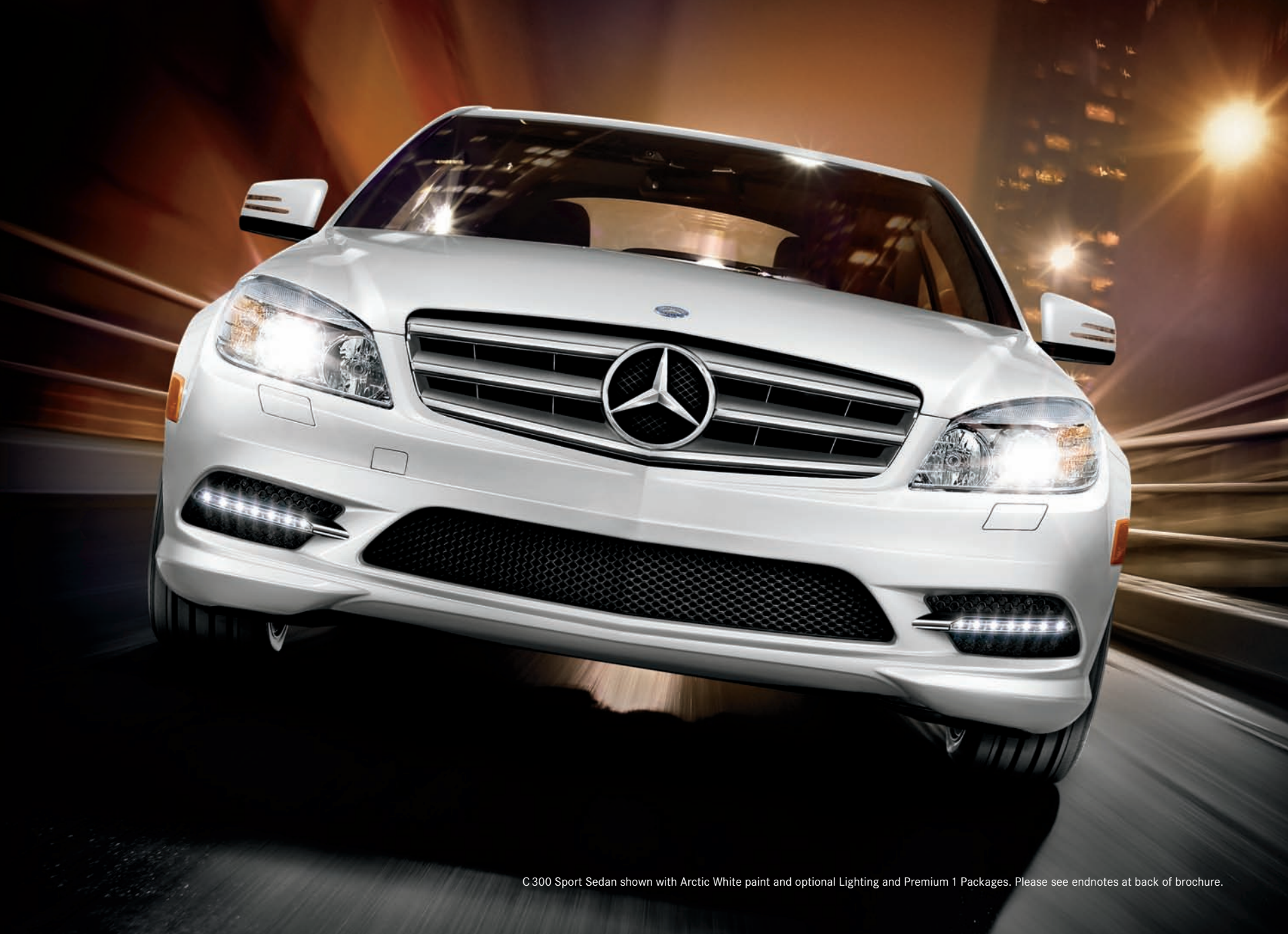
C 300 Sport Sedan shown with Arctic White paint and optional Lighting and Premium 1 Packages. Please see endnotes at back of brochure.