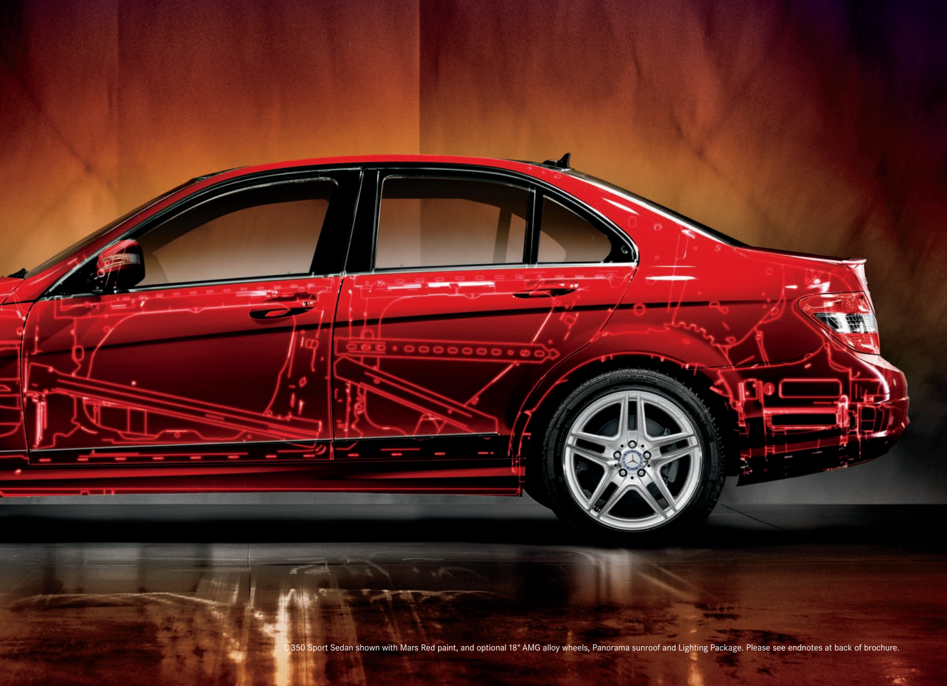
© 350 Sport Sedan shown with Mars Red paint, and optional 18" AMG alloy wheels, Panorama sunroof and Lighting Package. Please see endnotes at back of brochure.