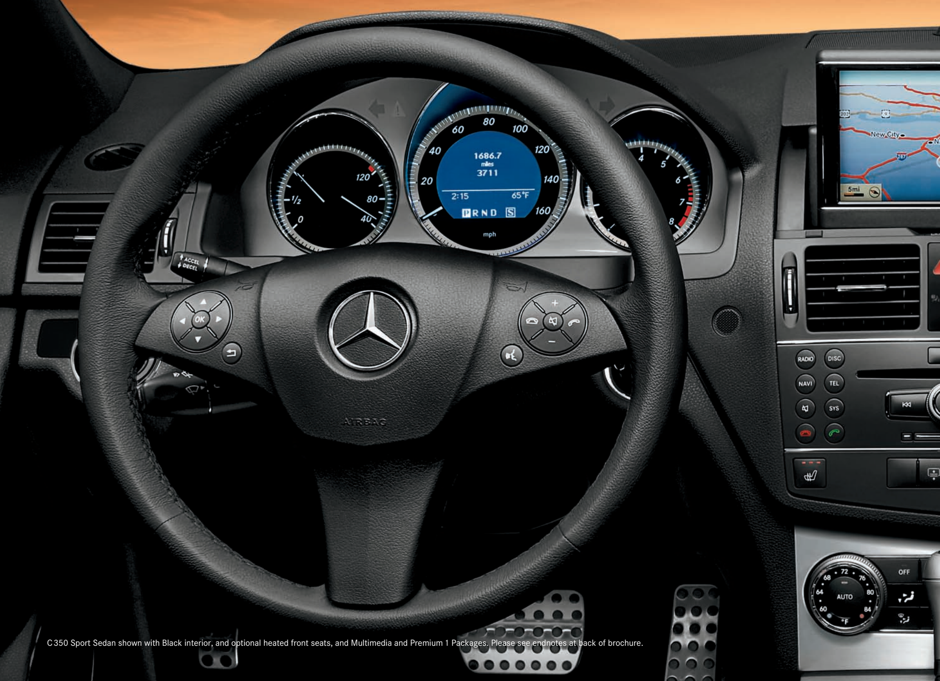
C350 Sport Sedan shown with Black interior, and optional heated front seats, and Multimedia and Premium 1 Packages. Please see endnotes at back of brochure.