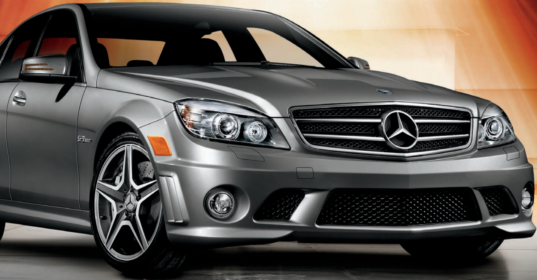
C 63 AMG Sport Sedan shown with optional Palladium Silver metallic paint and Lighting Package. Please see endnotes at back of brochure.