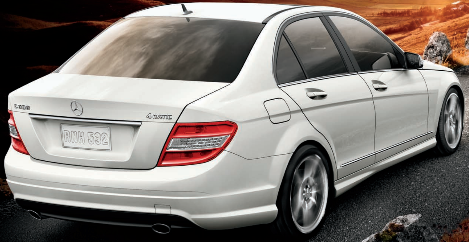
C300 4MATIC Sport Sedan shown with Arctic White paint, and optional 18" AMG alloy wheels and Lighting Package. Please see endnotes at back of brochure.