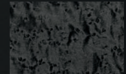
Black Birdseye Maple wood 18