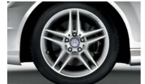
Standard 17" AMG twin 5-spoke (C 350 Sport)