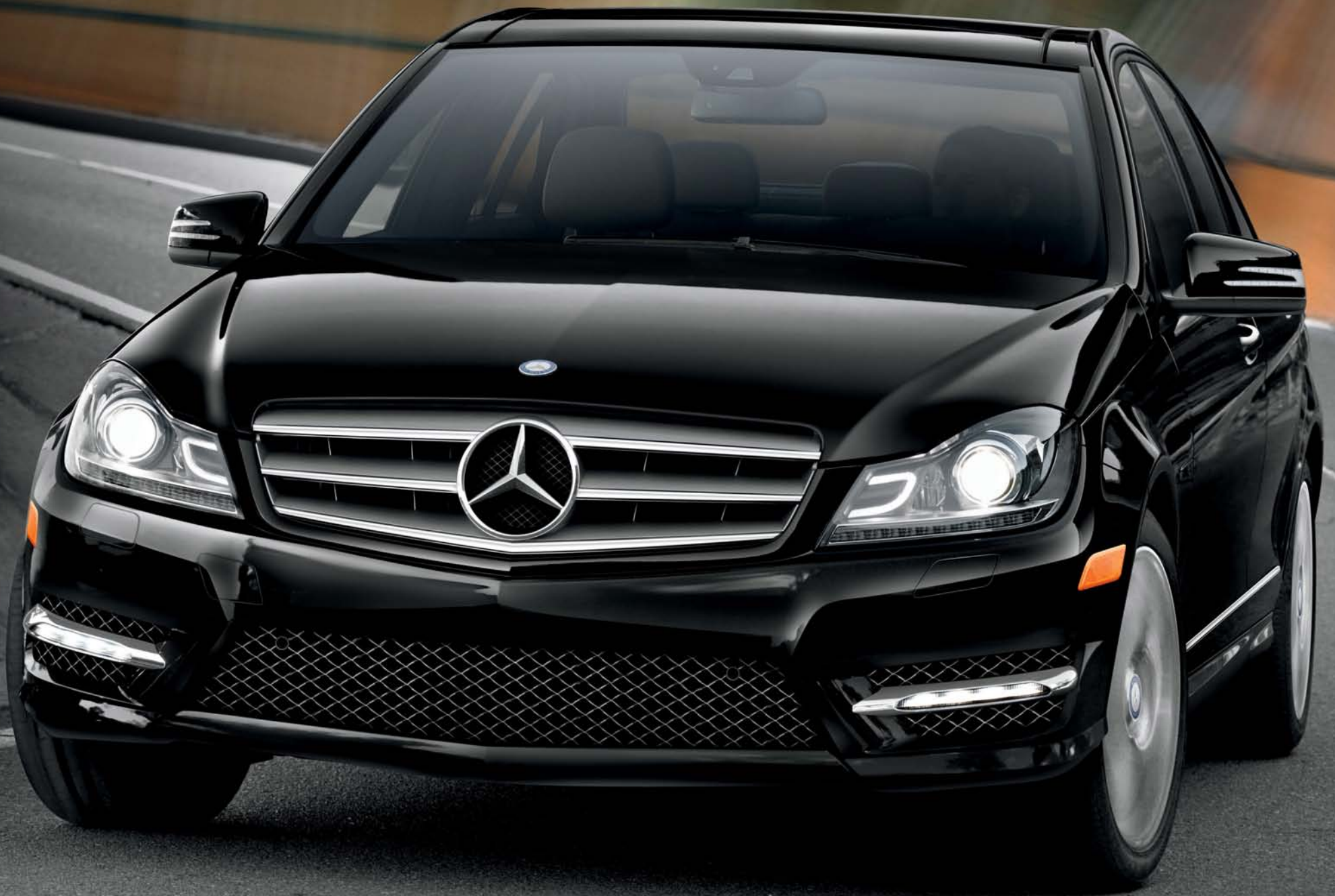
C300 4MATIC Sport Sedan shown with Black paint, and optional KEYLESS-GO, Panorama roof and Lighting Package. Please see endnotes at back of brochure.