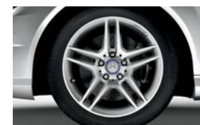
Standard 17" AMG twin 5-spoke (C 350)