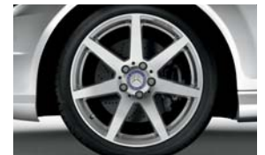
Optional 18" AMG 7-spoke (Sport Sedans)