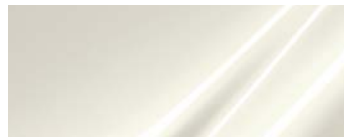
Diamond White 21