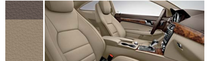
Almond Beige/Mocha (not available with leather upholstery)