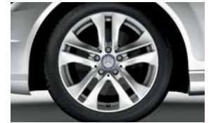
Standard 17" split 5-spoke (C 250 and C 300 4MATIC Luxury)