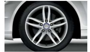
Standard 17" twin 5-spoke (C 250 and C 300 4MATIC Sport)