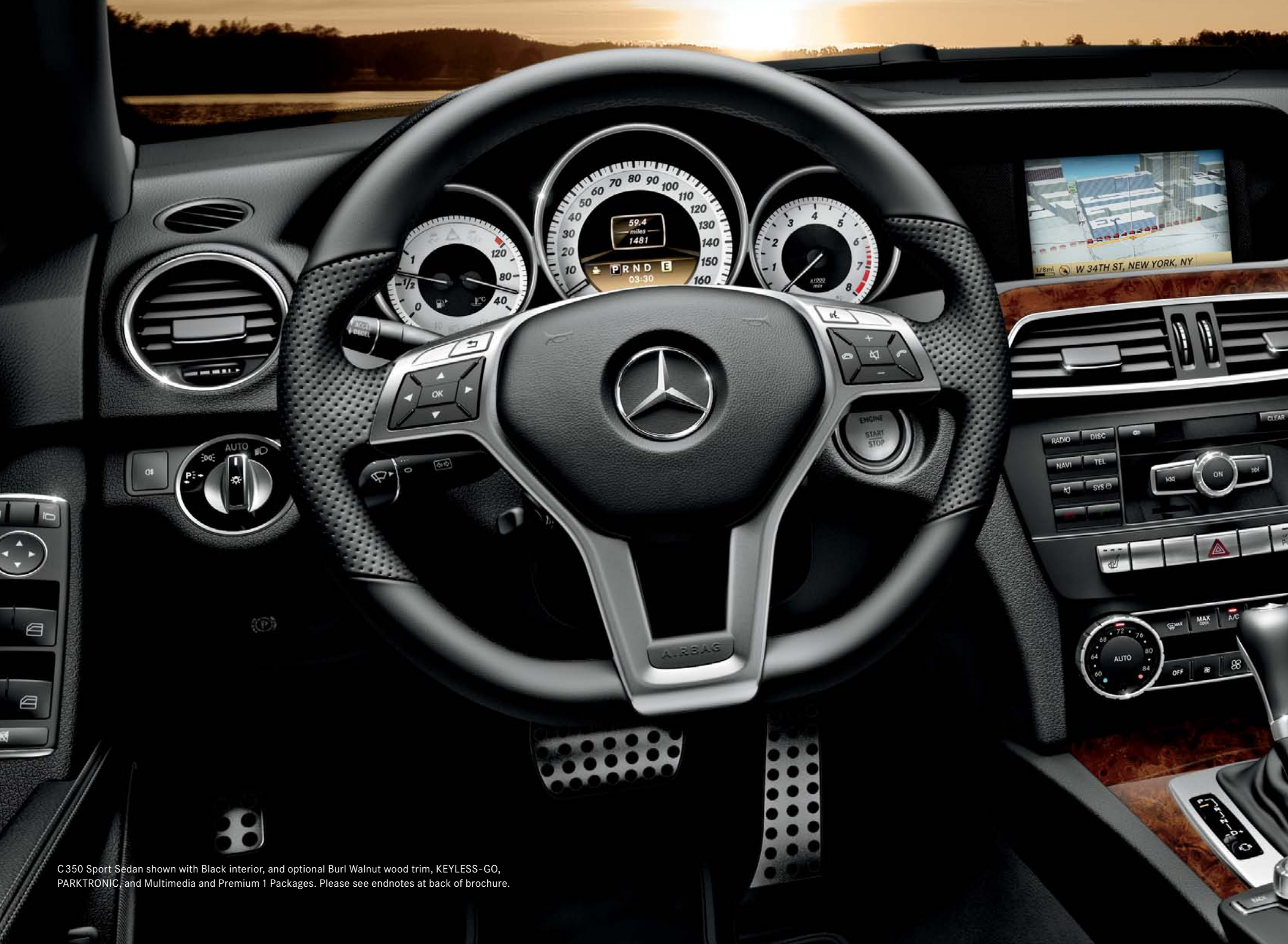
C 350 Sport Sedan shown with Black interior, and optional Burl Walnut wood trim, KEYLESS-GO, PARKTRONIC, and Multimedia and Premium 1 Packages. Please see endnotes at back of brochure.