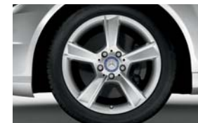
Standard 17" 5-spoke (C 250)