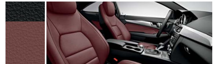
Red/Black (requires leather upholstery)