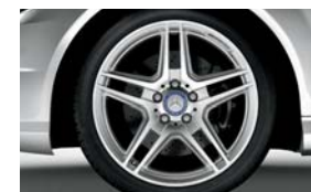
Optional 18" AMG twin 5-spoke