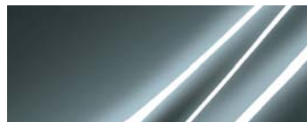
Sapphire Grey (Sedans)