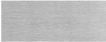
Aluminum (Sport Sedans, Coupes)