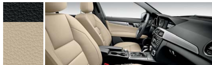
Sahara Beige/Black (Sport Sedans only, requires leather upholstery)