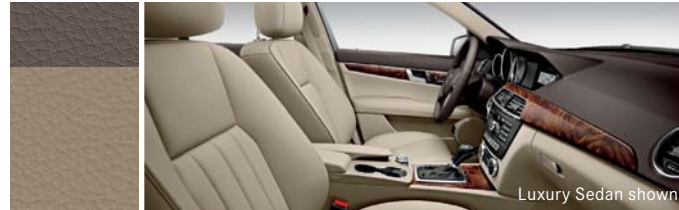
Almond Beige/Mocha (not available with leather upholstery on Sport Sedans)