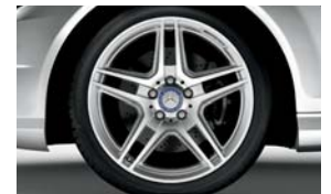
Optional 18" AMG twin 5-spoke (Sport Sedans)