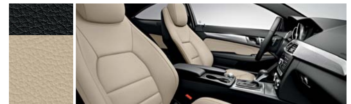
Sahara Beige/Black (requires leather upholstery)