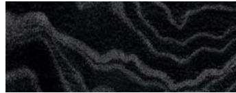
Black Ash wood (C350 Sport Sedan)