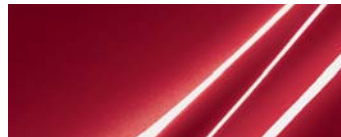
Mars Red (Sport Sedans, Coupes)