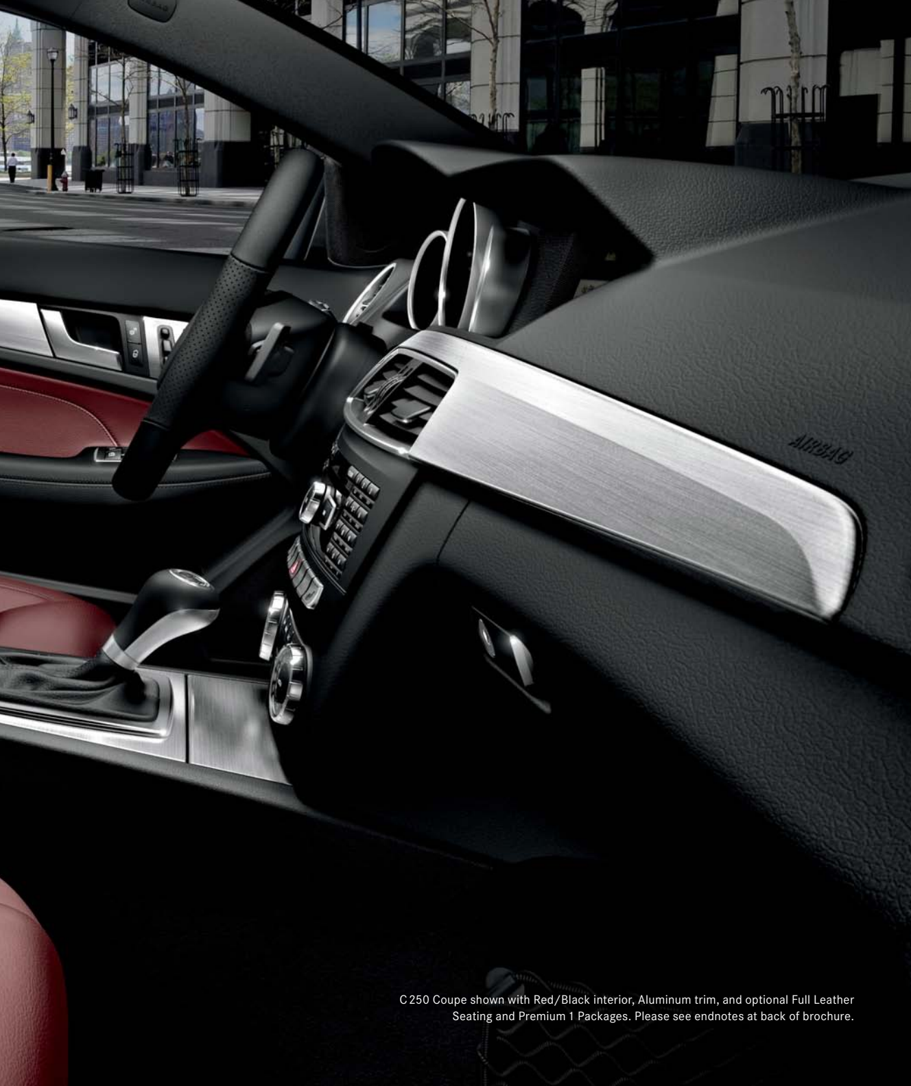
C250 Coupe shown with Red/Black interior, Aluminum trim, and optional Full Leather Seating and Premium 1 Packages. Please see endnotes at back of brochure.