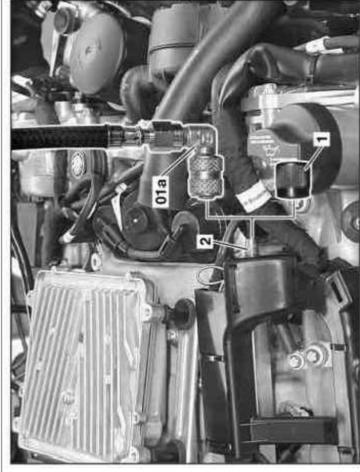
Shown on engine 272 in model 171 without fuel tank with exterior filter, code 917