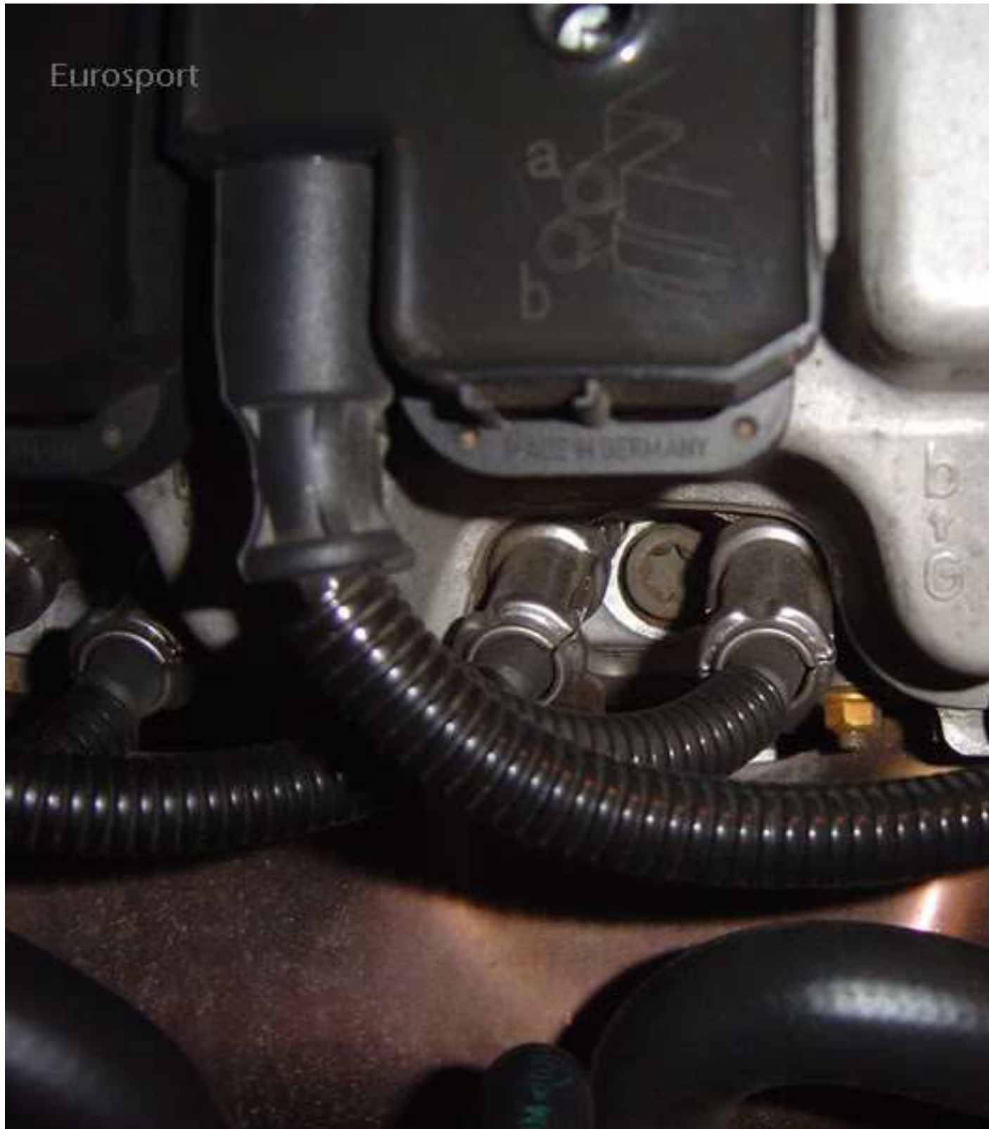
pretty simple, short wire low, long wire high