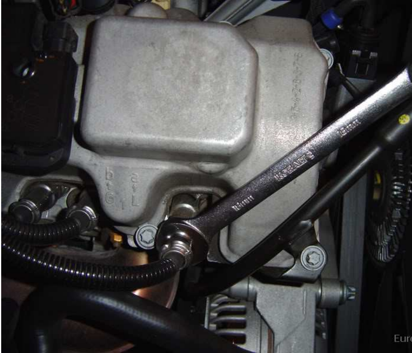
yes, I told you it's baked