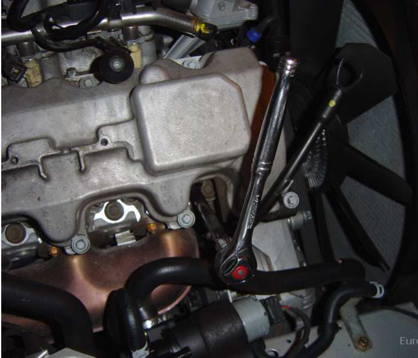
first one is out