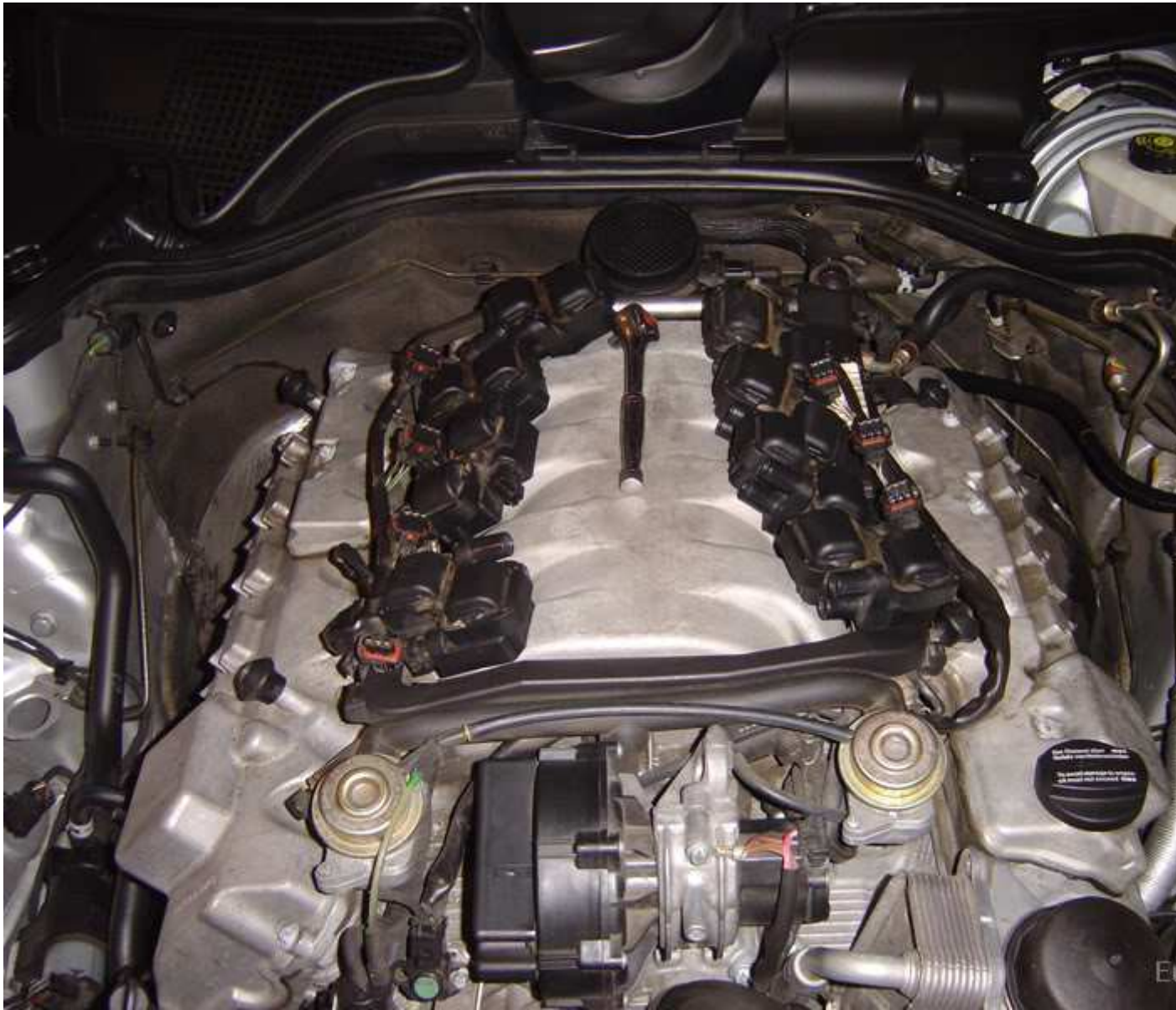
clean around some more