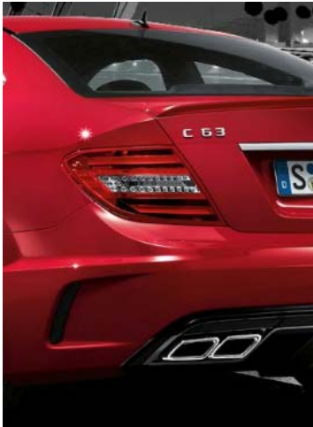
590 Mars Red