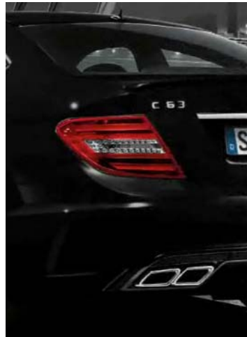
197 Obsidian Black