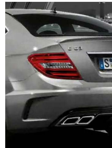
044 Magno Alanite Grey