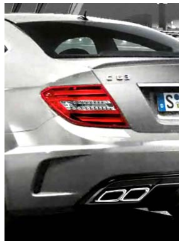
775 Iridium Silver