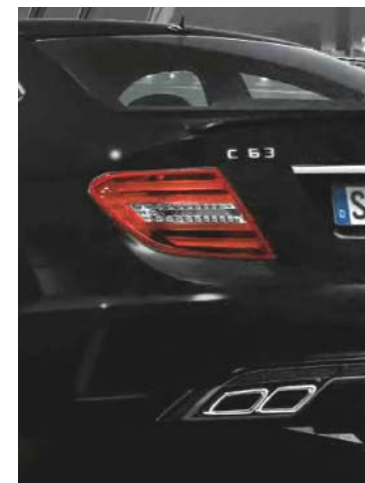
056 Magno Night Black