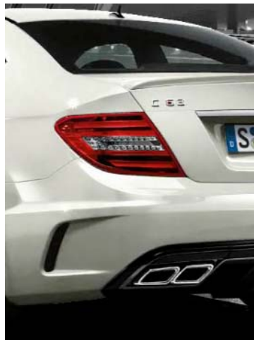
799 Diamond White