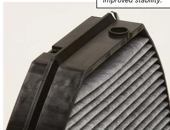
Solid plastic frame ensures improved stability.