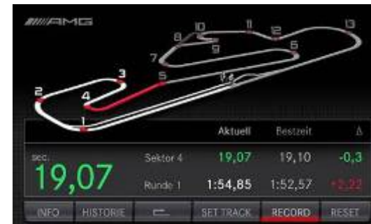
GPS Sector Data Logging