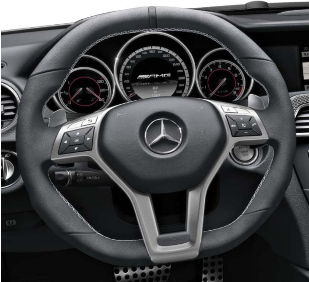
AMG Performance Flat Top/Bottom Steering Wheel in Alcantara with Porcelain Contrast Stitching and 12 o'clock Mark & Instrument Cluster with Red Dial Accents