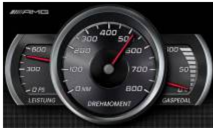
Horsepower, Torque & Throttle %