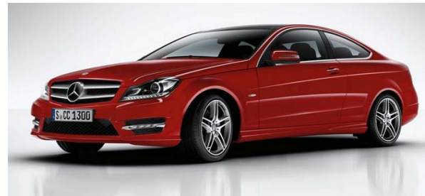
(590) Mars Red – N/C