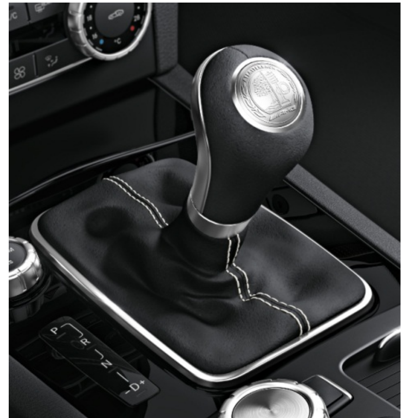
Gear Selector Knob and Boot in DINAMICA with Porcelain Contrast Stitching and AMG Crest