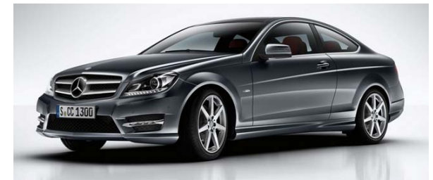
(755) Steel Grey – $720