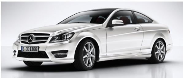
(149) Polar White – N/C