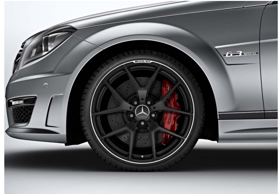
(793) 19" Forged 10-Spoke Black - Optional: $1,000est -

All C63 Edition 507 Wheels: 235/35 R 19 - Front 255/30 R 19 - Rear