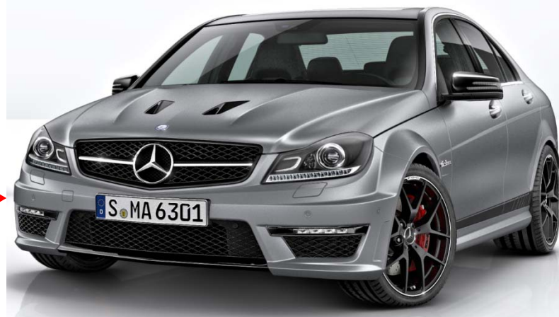
(051) designo Magno Platinum – $3,250(est)