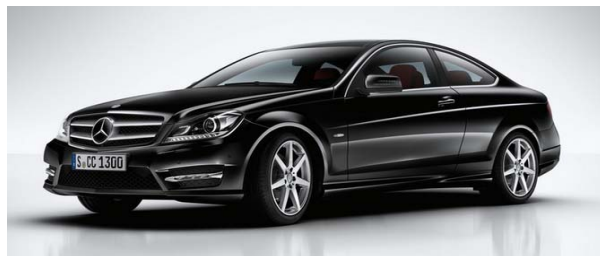
(197) Obsidian Black – $720