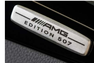
Edition 507 Badge on Dashboard