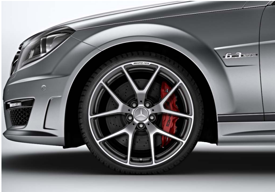
(785) 19" Forged 10-Spoke Silver - Standard -