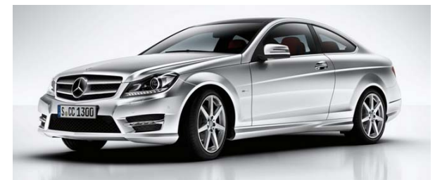
(775) Iridium Silver – $720