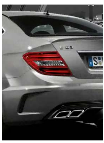
044 Magno Alanite Grey