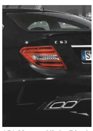
056 Magno Night Black