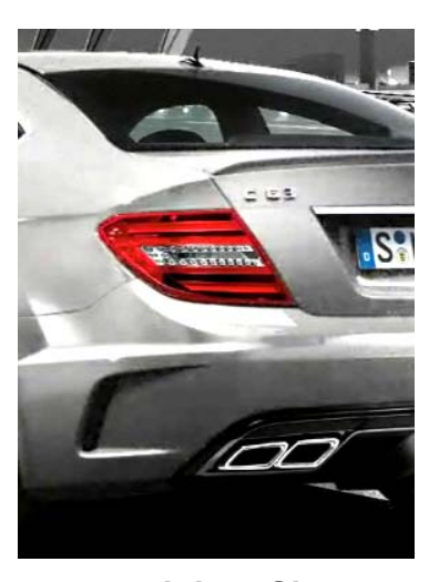
775 Iridium Silver