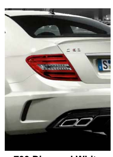
799 Diamond White