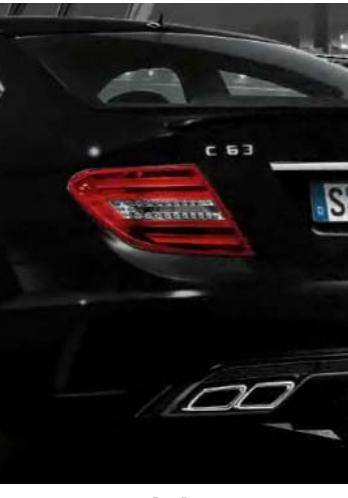
197 Obsidian Black