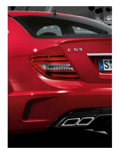
590 Mars Red