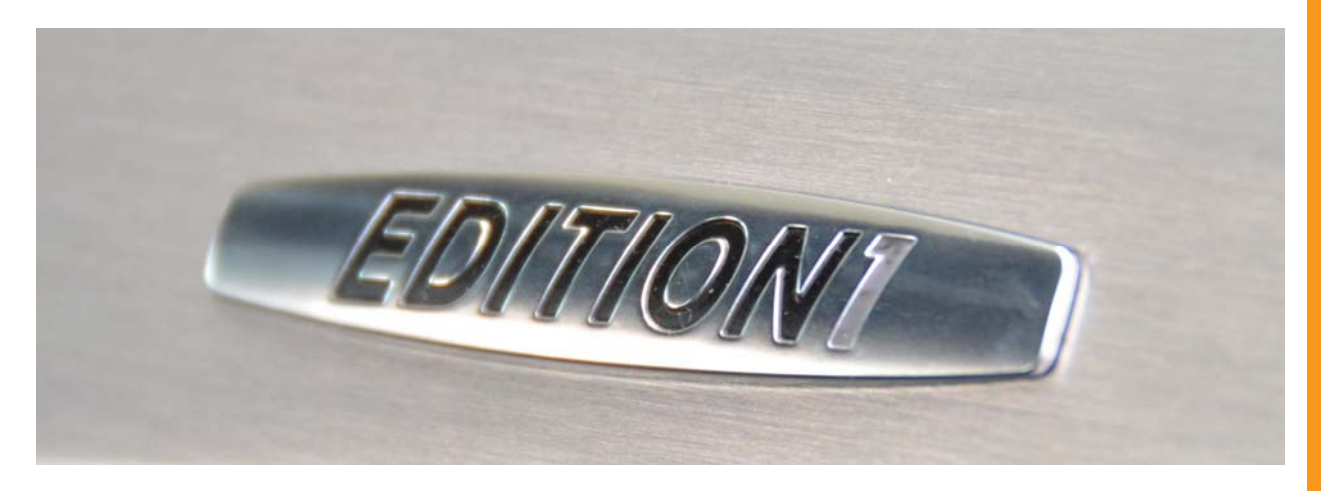
MY2012 C63 AMG Edition 1 Sedan: