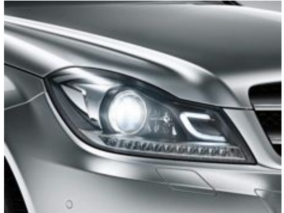
Bi-Xenon (319pkg Lighting Package)