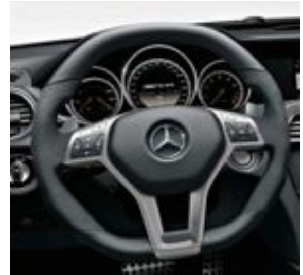
C63 AMG w/ AMG Development Package

Note: Almond/Beige interior will not include flat bottom steering wheel. Wheel will be replaced with a round three spoke steering wheel