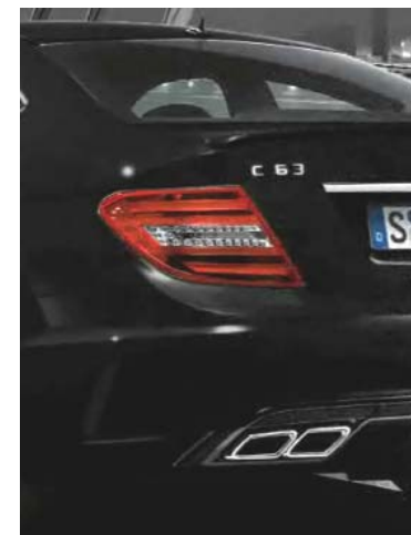
056 Magno Night Black