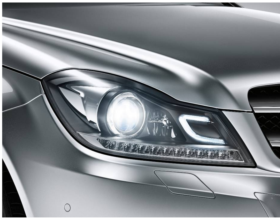
Bi-Xenon (319pkg Lighting Package)