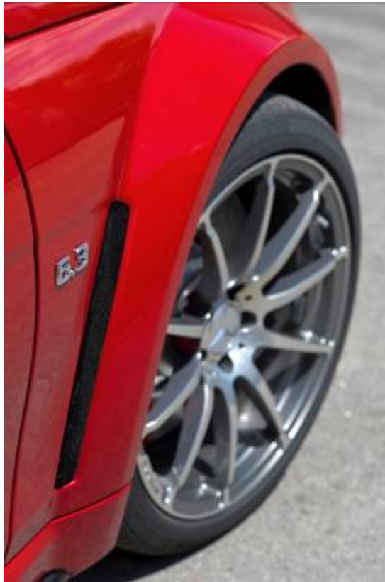
Special Dunlop Sport Tires Developed for the Black Series