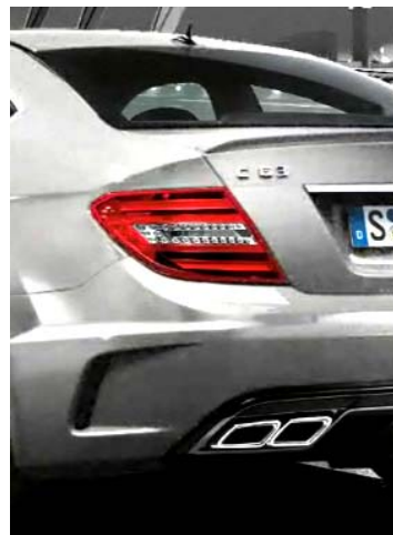
775 Iridium Silver