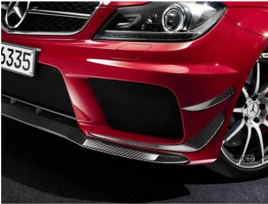
Front Splitter (larger than 773 package splitter) Front Canards/Dive Planes