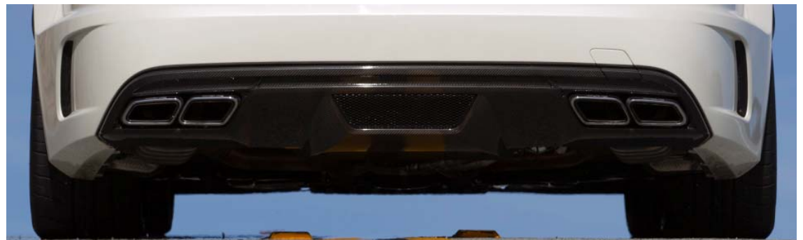
Active Rear Differential Oil Cooler