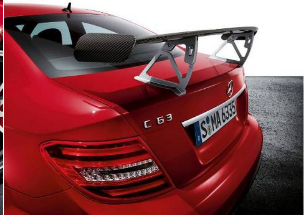
Rear Adjustable Spoiler

NOTE: The Aerodynamic Package adds an additional 2-3 weeks to the production time