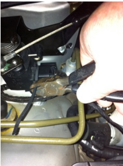
Clip Excess from Zip Tie