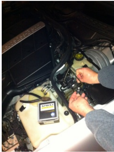
Plug remote into SpintBooster