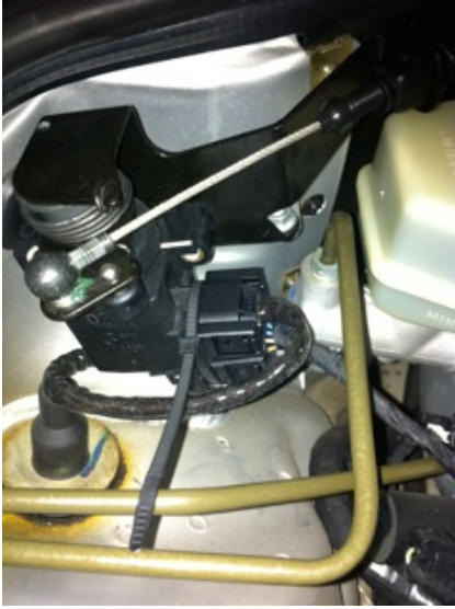
Secure SprintBooster tightly underneath throttle