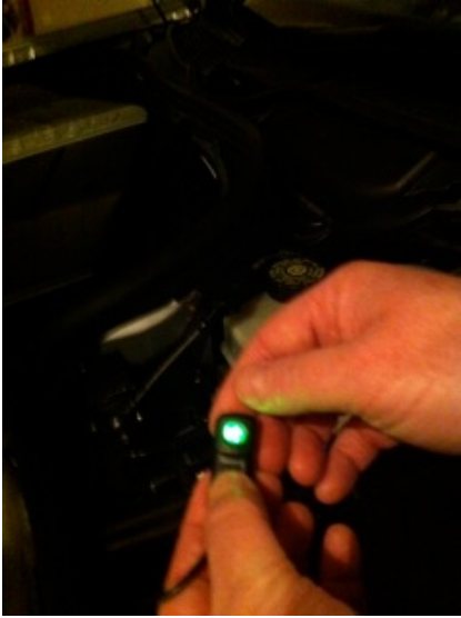
Stage 2– On Position