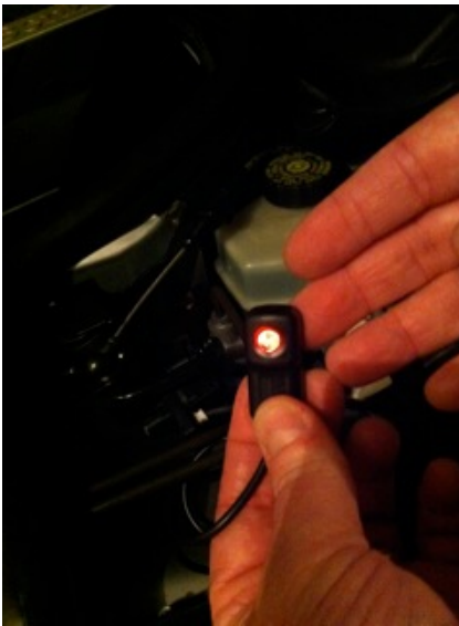
Stage 3 – Most Aggressive Position