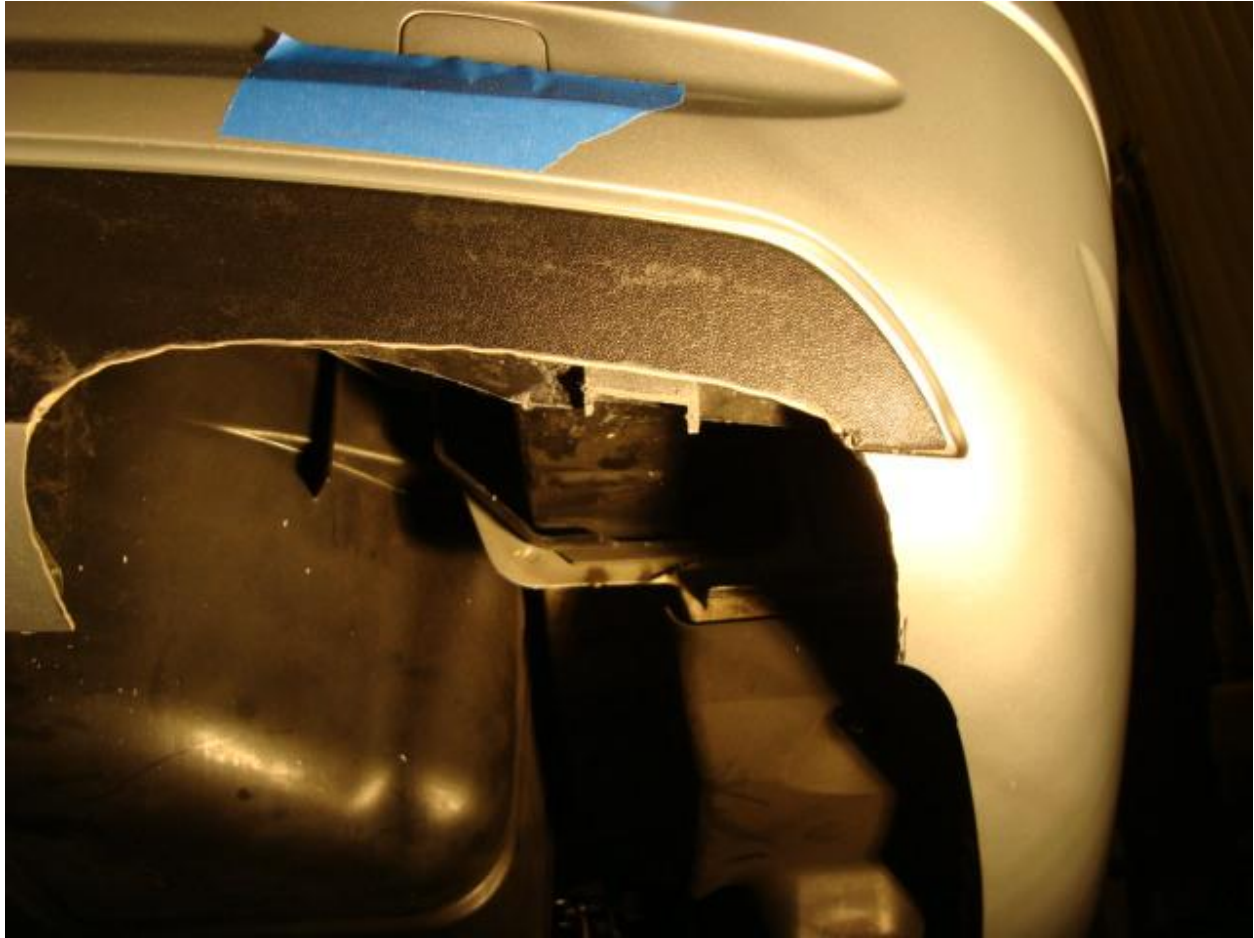
This is how it looks with the grinding wheel finished edges. I did not file it down.