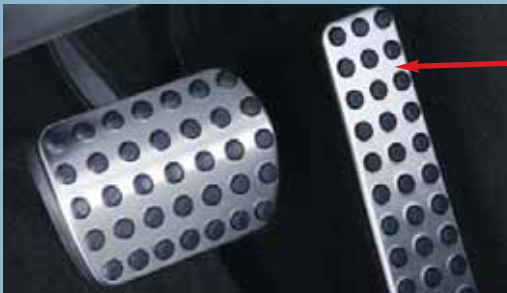
AMG stainless steel pedals