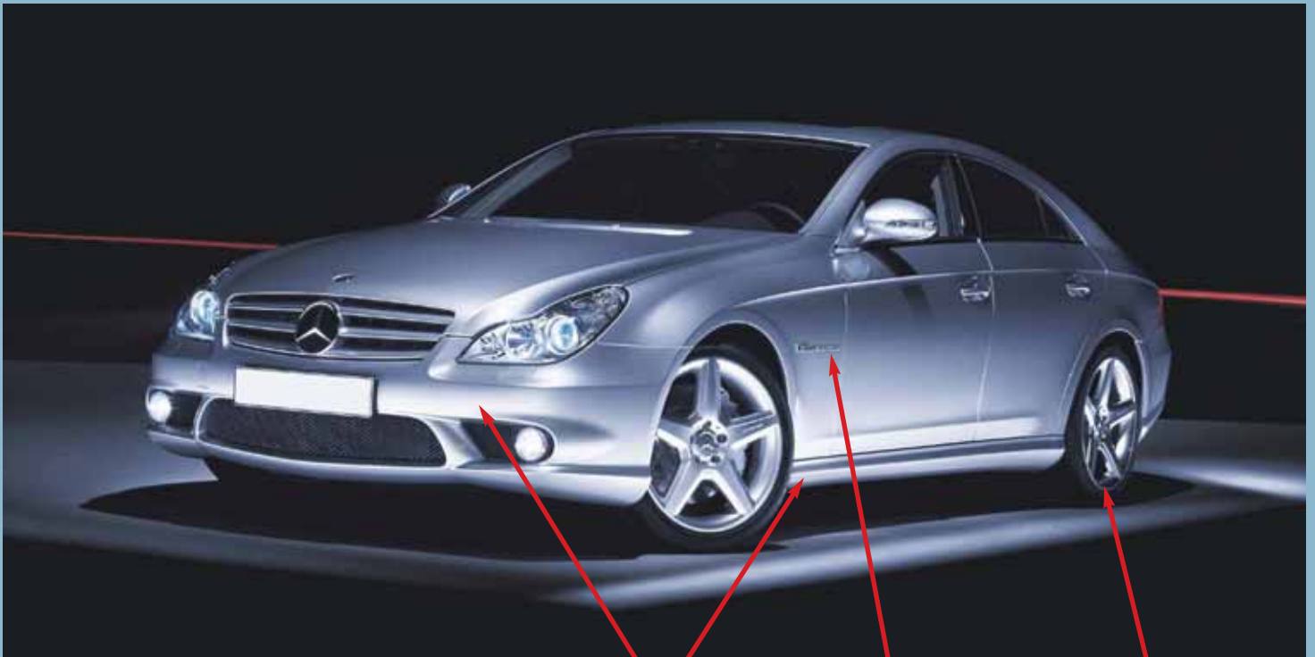
CLS55 and AMG rear badging