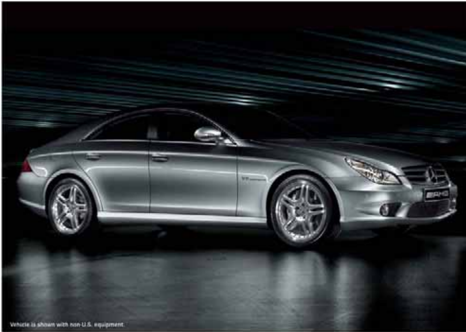
Vehicle is shown with non-U.S. equipment.