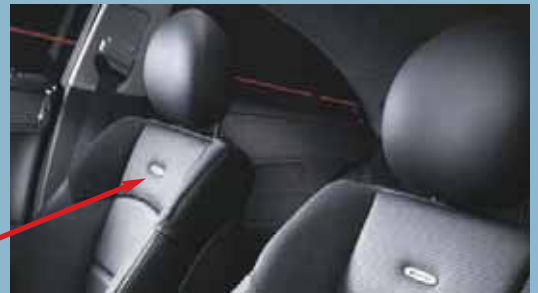
AMG Nappa Leather sport seats with AMG badging