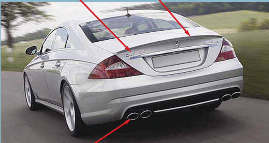
AMG twin dual exhaust with chrome tips