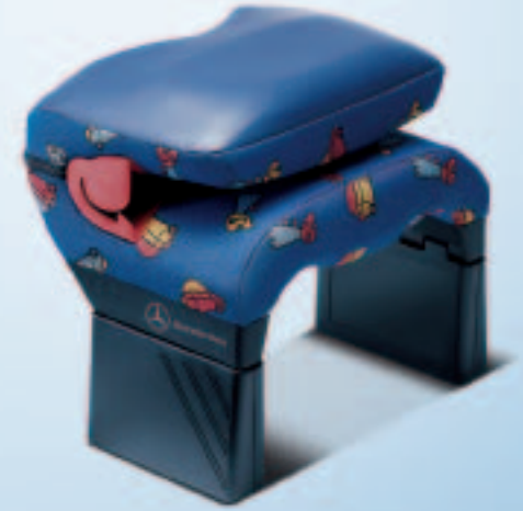
'Angel & Driver' design.