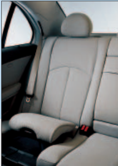
Can be ordered as extras: Integrated child safety seats (IKS).

Suitable for children weighing from 15 to 36 kg (approximately 4 to 12 years of age). They simply fold away when not needed.