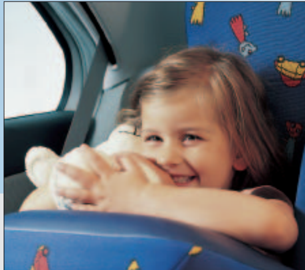
Protective cover and safety table for IKS.

You can also purchase a protective cover made from head-wearing, easy-care material. Its padded sides also give your child additional support.