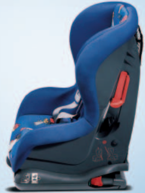
'Angel & Driver' design.