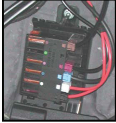
Fuse location: F32 f74 passenger footwell