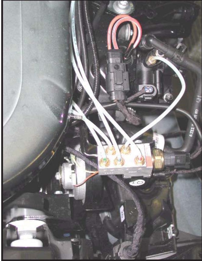
Location: Under left front headlamp