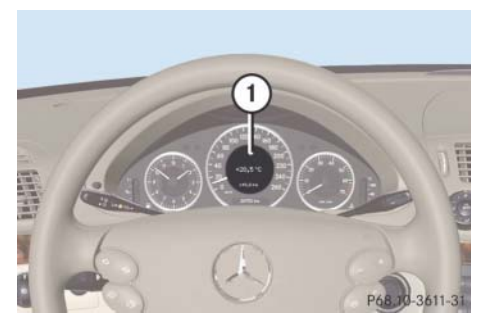
E-Class illustrated, other models slightly different

For example: telephone numbers are shown on the multifunction display while dialing when the main "Telephone*" menu is selected in the control system.