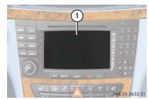
E-Class illustrated, other models slightly different

1 These commands also appear on the display by briefly pushing the operating lever to 'off'.