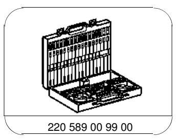
Electrical connection kit