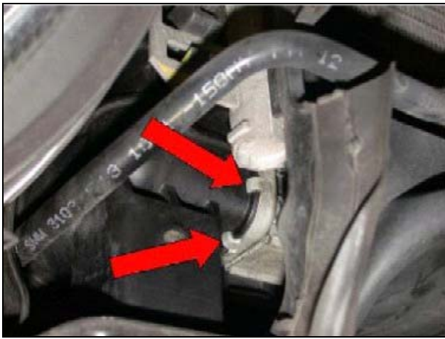
Figure 2 Old Crimping Method