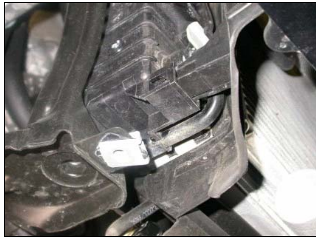
Figure 3 New Crimping Method

⚠ Caution! It is mandatory to follow the process steps in sequence.