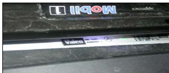
Figure 1 P-B-27.55/50

This bulletin has been created and maintained in accordance with MBUSA-SLP S423QH001, Document and Data Control, and MBUSA-SLP S424HH001, Control of Quality Records.