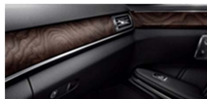
H09 Brown Satin Ash