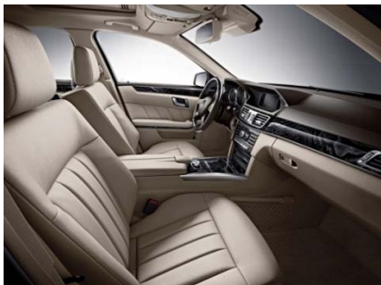
Silk Beige/Espresso Brown