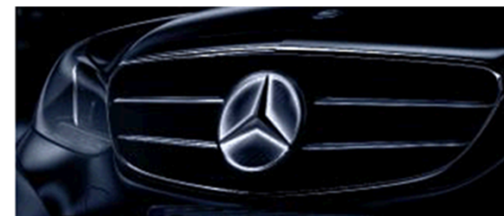
New Q2 Accessory: Illuminated Grille Star