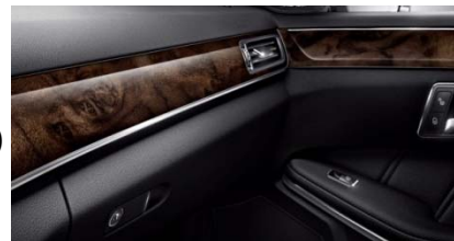
H14 Burl Walnut