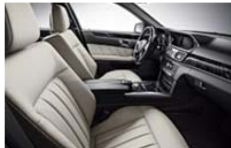
Porcelain/Black (leather only)