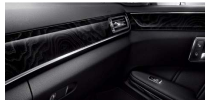
736 Black Ash