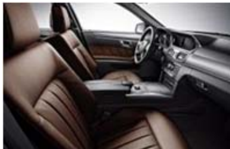
Chestnut Brown/Black (leather only)