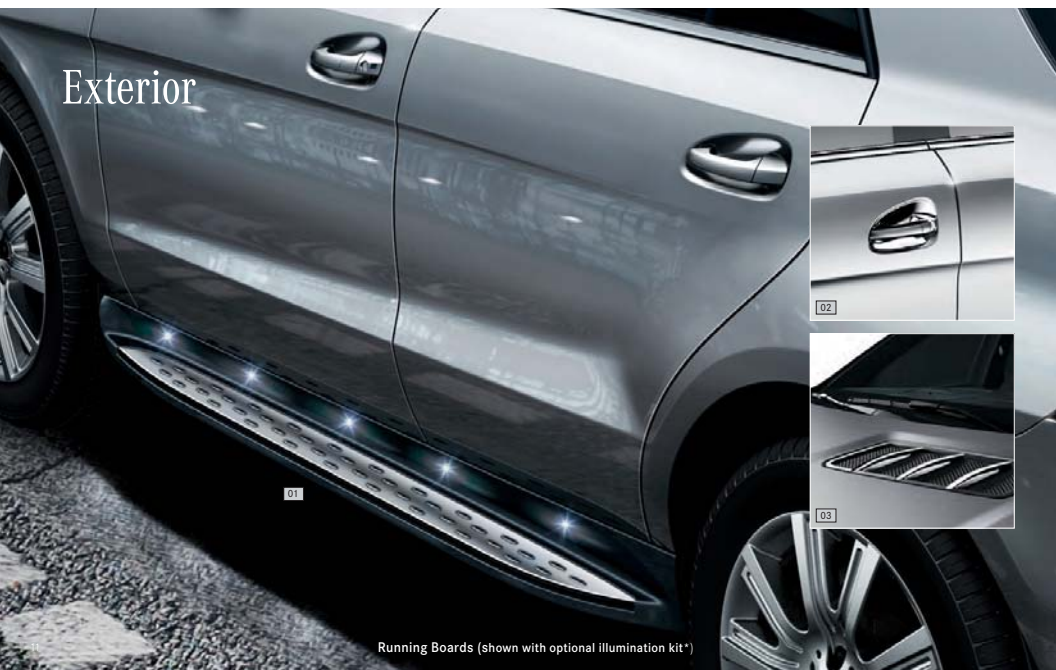
Running Boards (shown with optional illumination kit*)