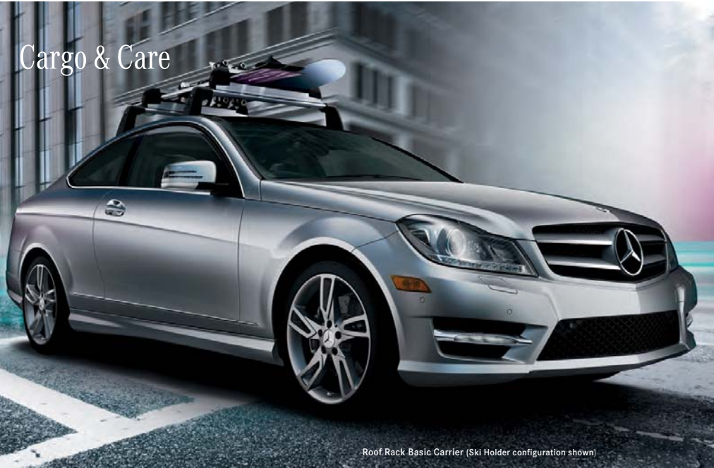
Roof Rack Basic Carrier (Ski Holder configuration shown)