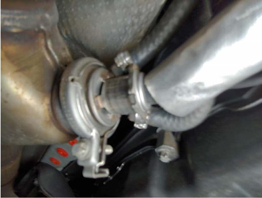
Fuel injection into exhaust for DPF regen?