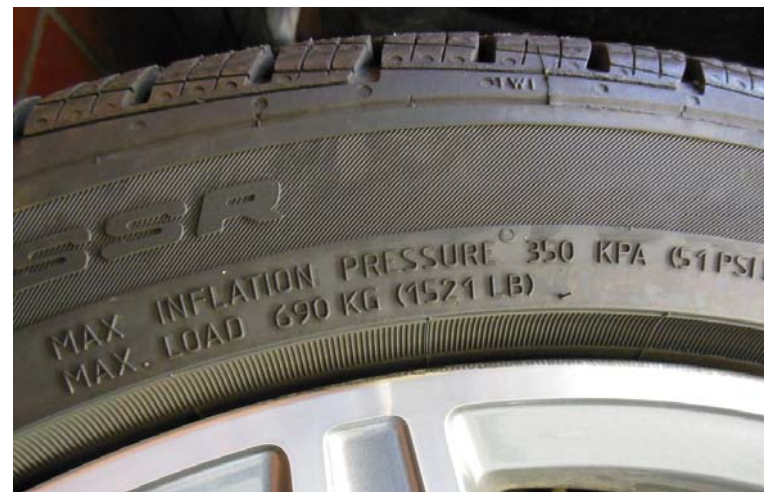
Other tire pressure labels

Tire pressure label located on the tire. Maximum tire pressure value for this particular tire .