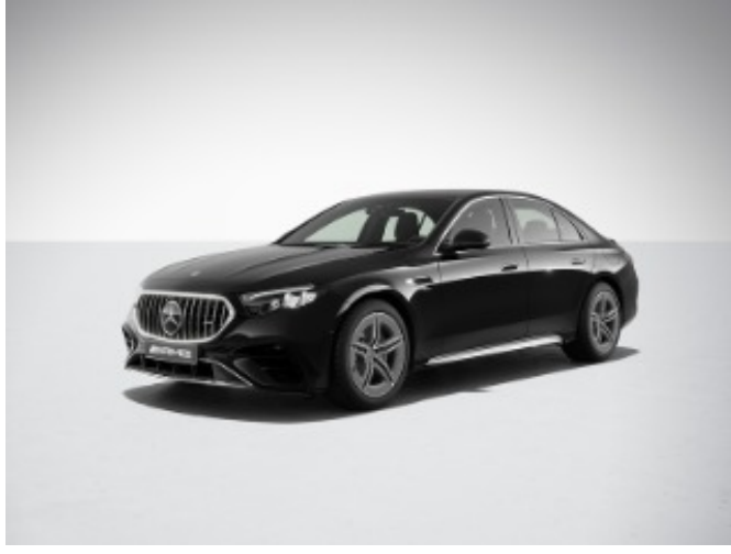
040 - Black