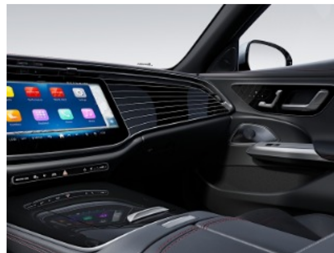
H17 - MANUFAKTUR Black Piano Lacquer with Flowing Lines