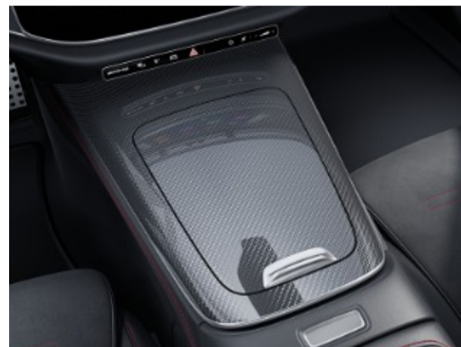
732 - AMG Carbon Fiber Center Console