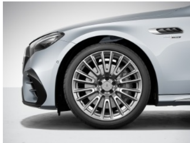
RVM - 20" AMG 10-Twin-Spoke Light-Alloy Wheels

R01 (Summer), (R02 (All-Season), B51/R66 265/40 R20 on 9.5J x 20H2 ET25(front) , 295/35 R20 on 10.5J x 20H2 ET43(rear)