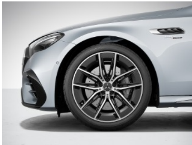
RTP - 20" AMG 5-Twin-Spoke Light-Alloy Wheels