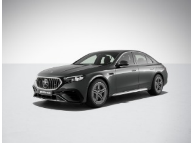
831 - Graphite Grey