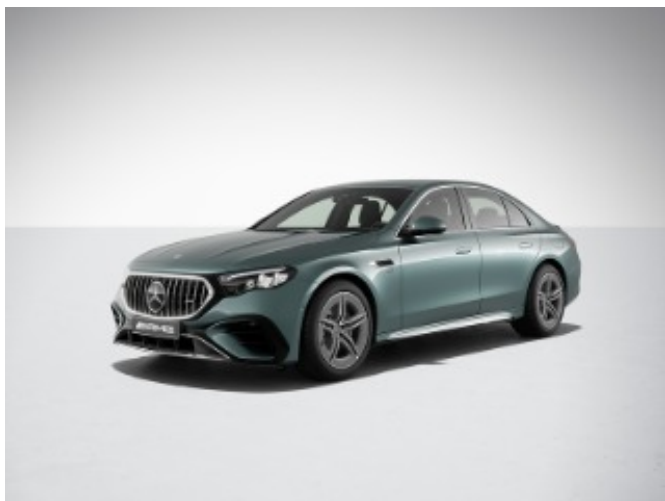
188 - Verde Silver