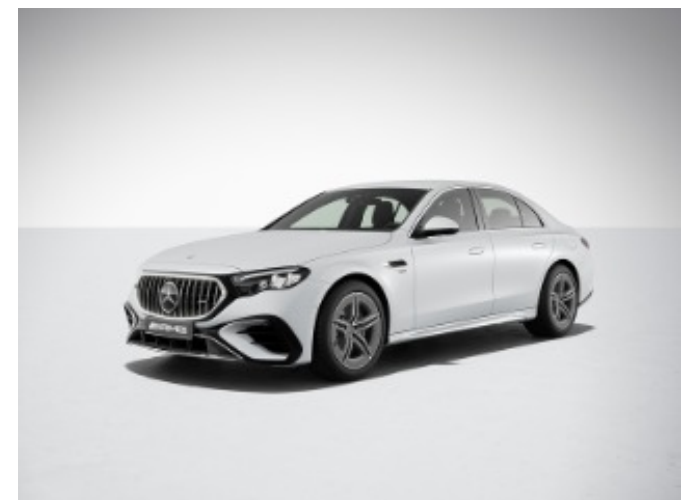
659 - MANUFAKTUR Moonlight White Magno