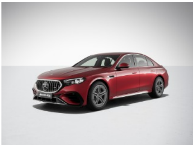
993 - MANUFAKTUR Patagonia Red