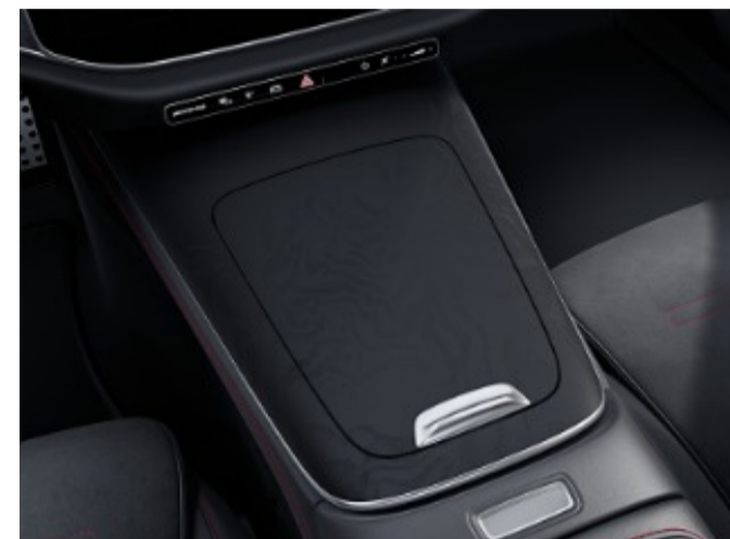
753 - Natural Grain Black Ash Wood Center Console