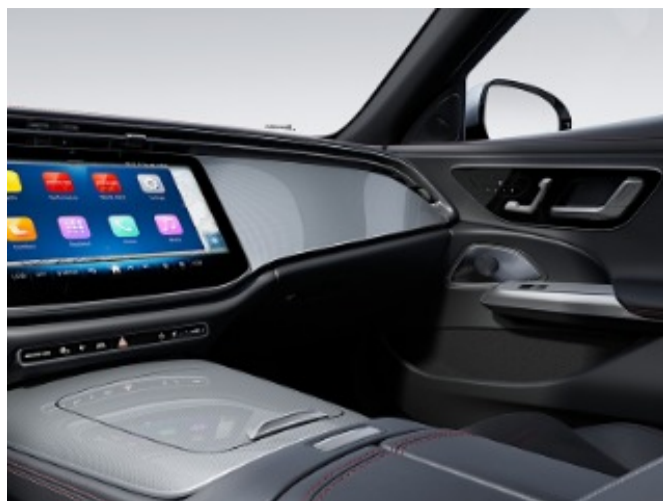
70H - Silver Metallic Mixed Fabric Trim