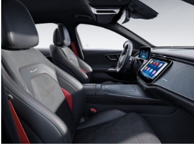
651 - Black MB-Tex / Microfiber with Red Stitching