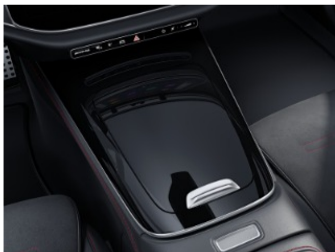
759 - Black Piano Paintwork Center Console