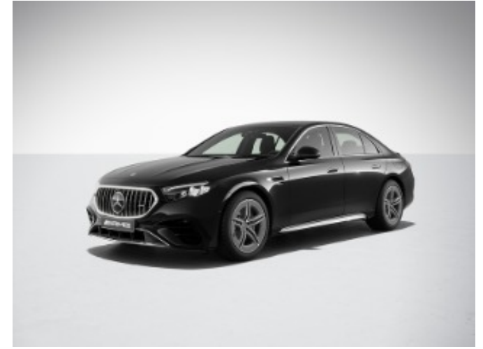
197 - Obsidian Black