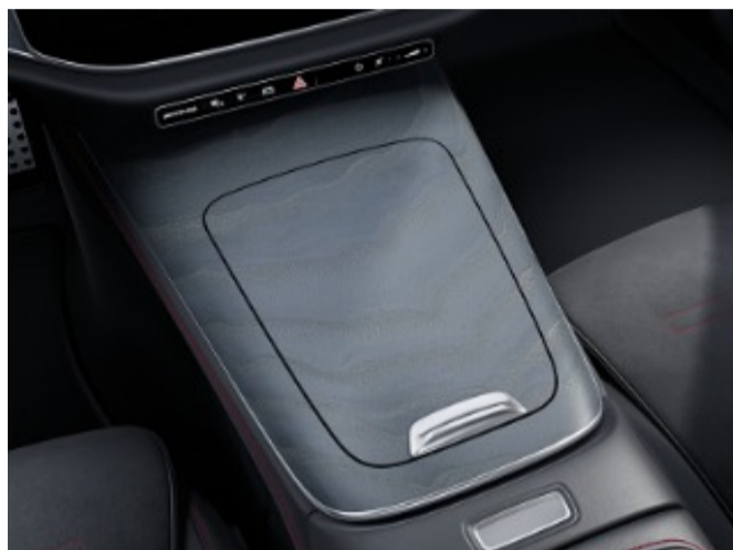
768 - Grey Open-Pore Ash Wood Center Console