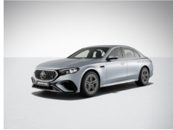
922 - Cirrus Silver