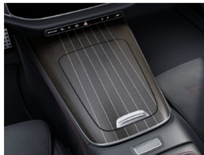
667 - Natural Grain Maple Wood Center Console with Aluminum Lines

Only with 70H/ DA0. $0 icw 70H. $150 icw DA0 Superscreen.