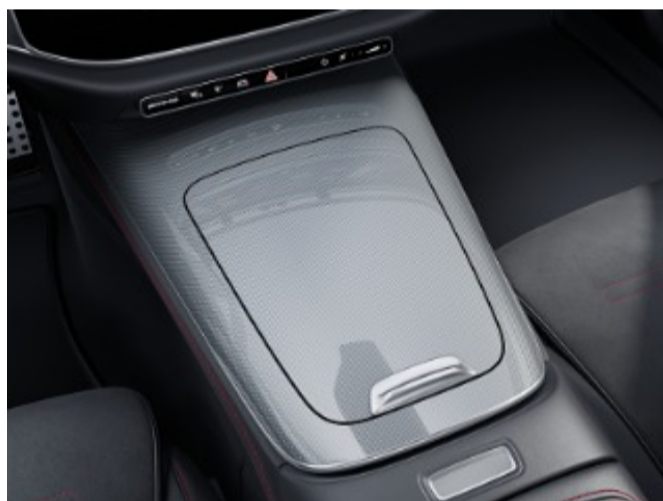
671 - Silver Metallic Mixed Fabric Center Console

Only with 70H/ DA0. $0 icw 70H. $150 icw DA0 Superscreen.