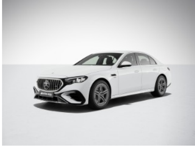
149 - Polar White