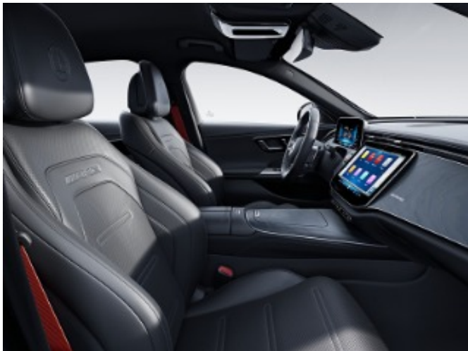
851 - AMG Black Nappa Leather