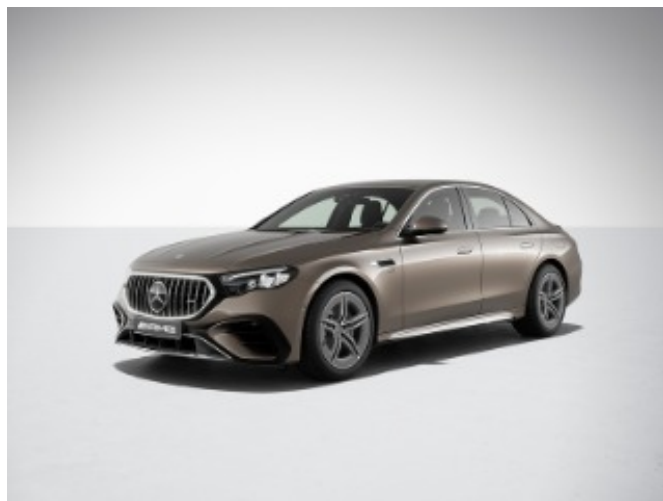
771 - Sonoran Brown