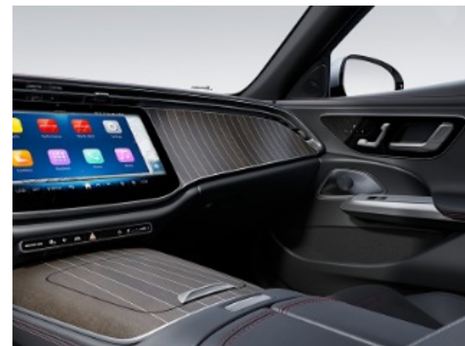
14H - Natural Grain Brown Maple Wood Trim with Aluminum Lines