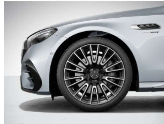
RVN - 20" AMG 10-Twin-Spoke Light-Alloy Wheels w/ Black Accents

R01 (Summer), (R02 (All-Season), B51/R66 265/40 R20 on 9.5J x 20H2 ET25(front) , 295/35 R20 on 10.5J x 20H2 ET43(rear)