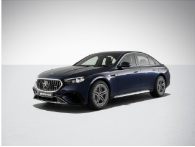
595 - Nautical Blue