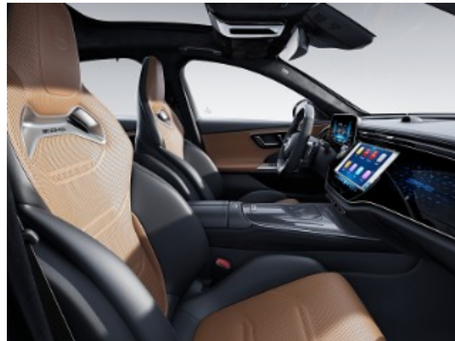
854 - AMG Tonka Brown/ Black Nappa Leather