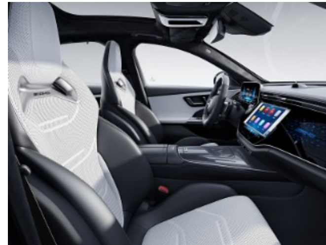
858 - AMG Neva Grey/ Black Nappa Leather