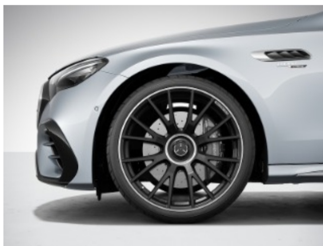
RWC - 21" AMG Forged Cross-Spoke Wheels, Black

R01 (Summer), B51 265/35 R21 on 9.5J x 21H2 ET25(front) , 295/30 R21 on 10.5J x 21H2 ET43(rear)