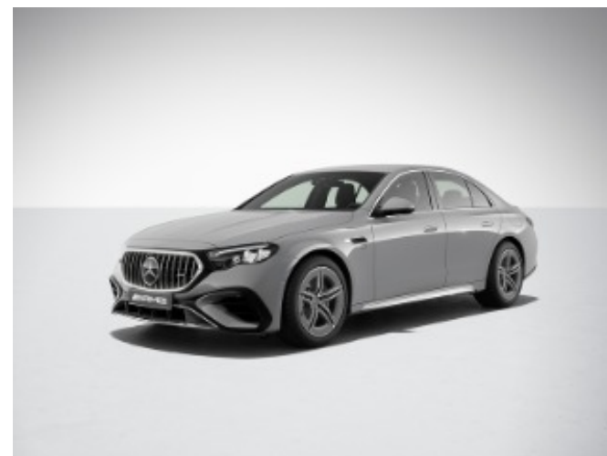
956 - MANUFAKTUR Alpine Grey