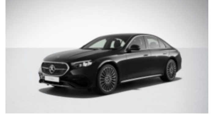
197 - Obsidian Black