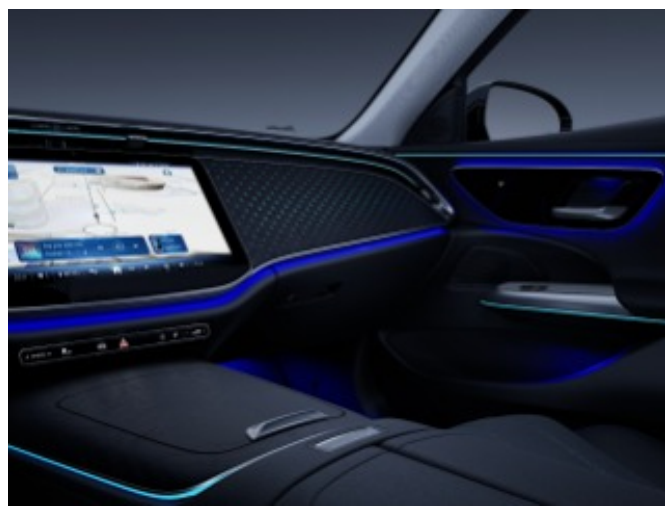
11H - Natural Grain Black Ash Wood Trim with Backlit Mercedes-Benz Star Pattern