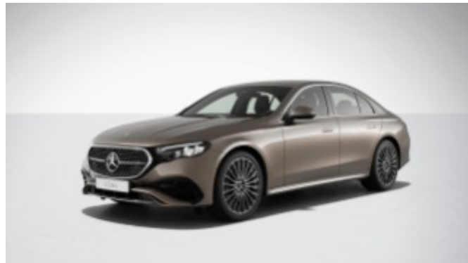
771 - Sonoran Brown