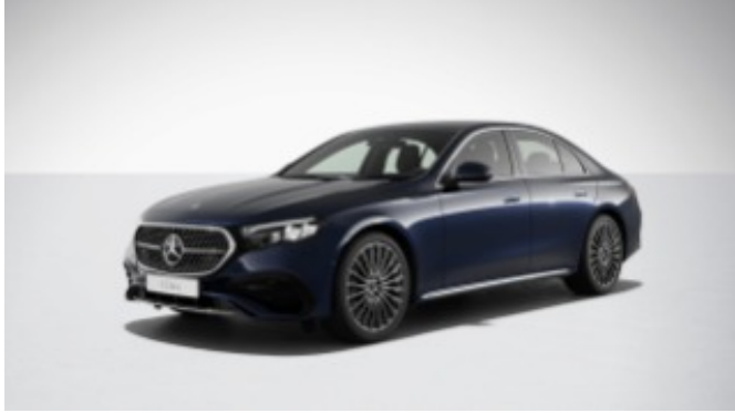
595 - Nautical Blue