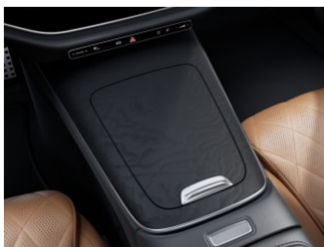
753 - Natural Grain Black Ash Wood Center Console