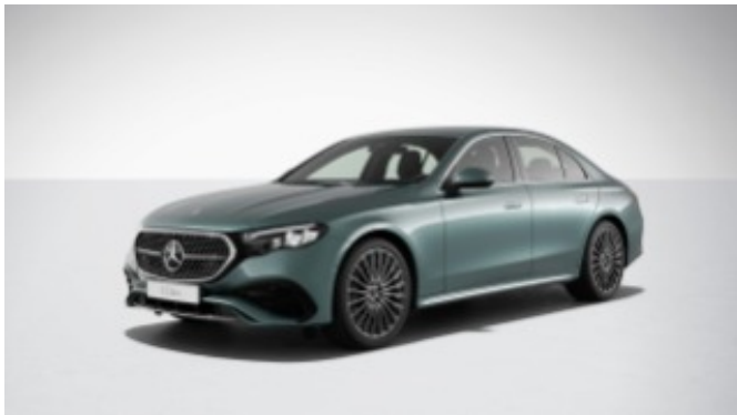
188 - Verde Silver