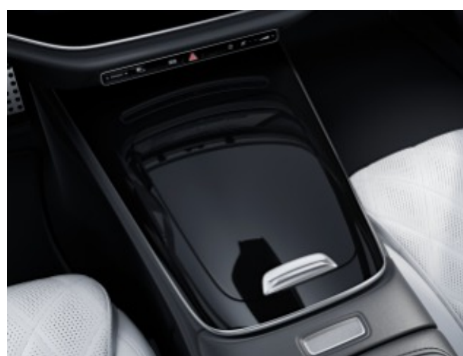
759 - Black Piano Paintwork Center Console