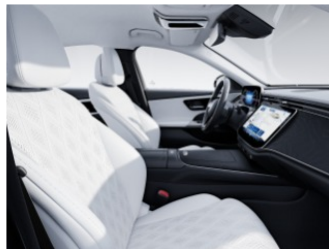
808 - Neva Grey/ Black Nappa Leather