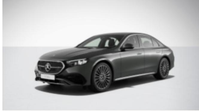
831 - Graphite Grey