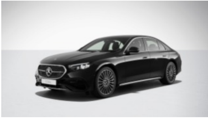
040 - Black