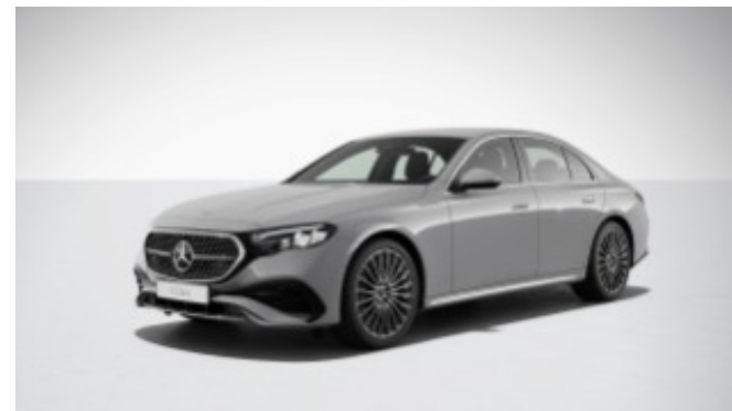
956 - MANUFAKTUR Alpine Grey