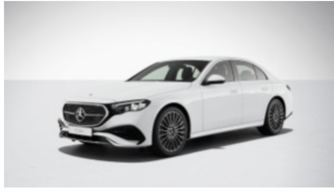
149 - Polar White