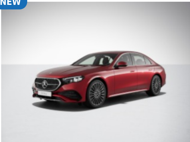
993 - MANUFAKTUR Patagonia Red