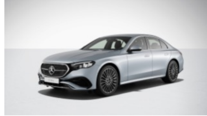
922 - Cirrus Silver