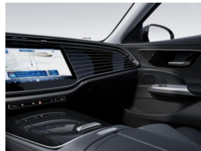
H17 - MANUFAKTUR Black Piano Lacquer with Flowing Lines