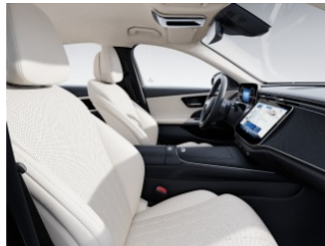
205 - Macchiato Beige/ Black Leather