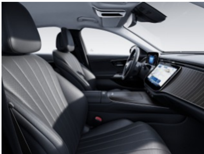
201 - Black Leather