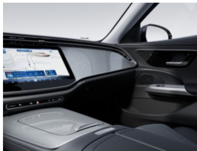
70H - Silver Metallic Mixed Fabric Trim