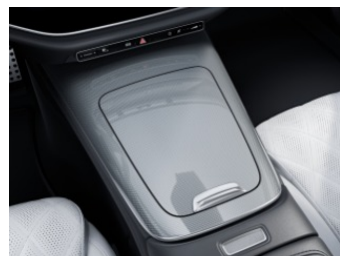
671 - Silver Metallic Mixed Fabric Center Console

Only with 70H/ 860. $0 icw 70H. $150 icw 860 Superscreen.