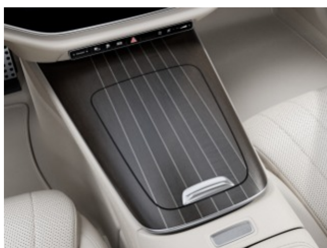
667 - Natural Grain Maple Wood Center Console with Aluminum Lines

Only with 70H/ 860. $0 icw 70H. $150 icw 860 Superscreen.