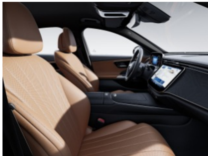
204 - Tonka Brown/ Black Leather