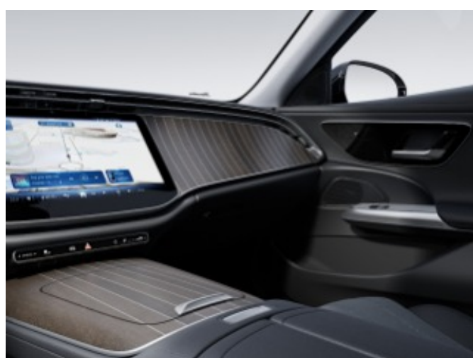
14H - Natural Grain Brown Maple Wood Trim with Aluminum Lines