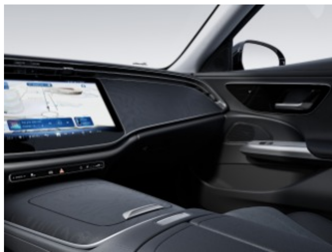
10H - Natural Grain Black Ash Wood Trim