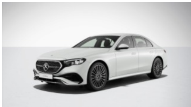
885 - MANUFAKTUR Moonlight White Metallic