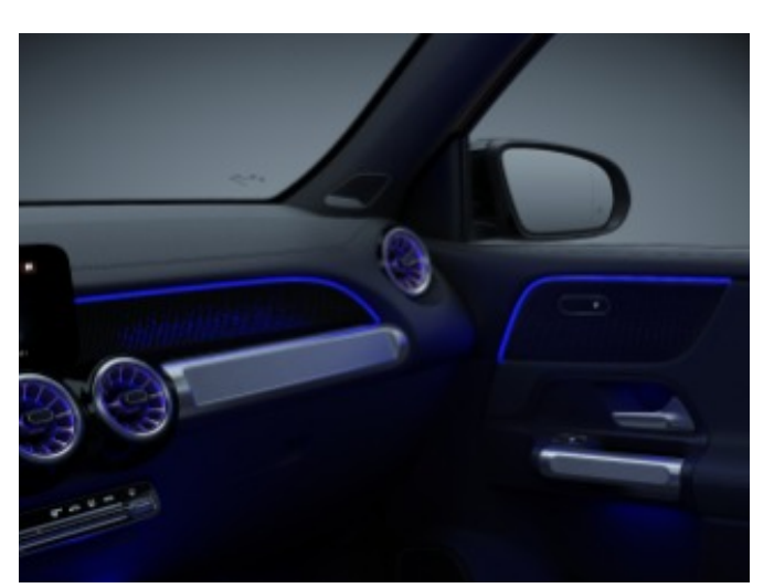
54H - Spiral Look Backlit Requires AMG Line (DG3PKG)