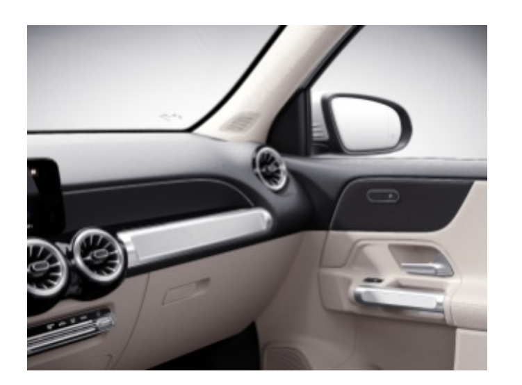
H15 - Natural Grain Black Linden Wood