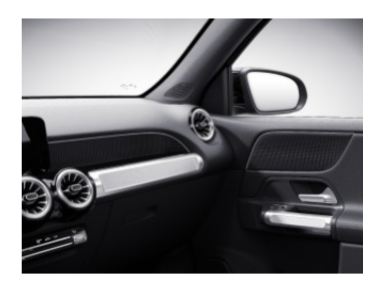
H60 - Spiral Look Not available w/ AMG Line (DGPKG)