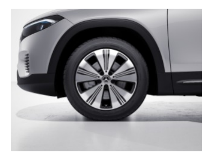
R31 - 18" 5-Spoke Wheels Standard Wheel 18" R02, R66 235/55 R18 tyres on 7.5J x 18 ET 53.5