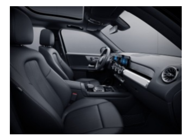
101 - Black (Comfort Seats) Not w/ AMG Line (DG3PKG)