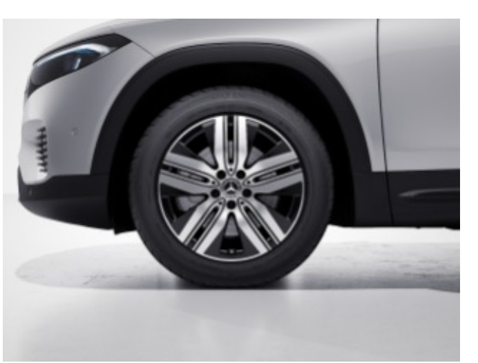
97R - 18" 5 Spoke Wheels Not w/AMG Line (DG3PKG) 18" R02, R66 235/55 R18 tyres on 7.5J x 18 ET 53.5