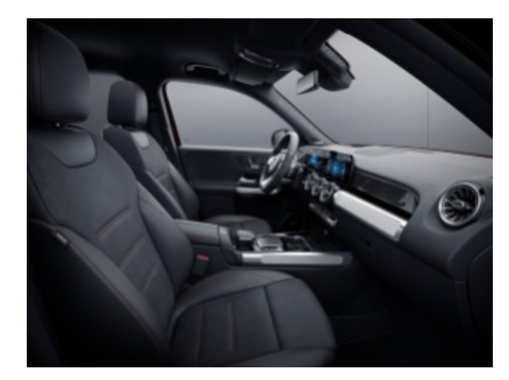
651 - Black w/ DINAMICA inserts and red topstitching (Sport Seats) Requires AMG Line (DG3PKG)