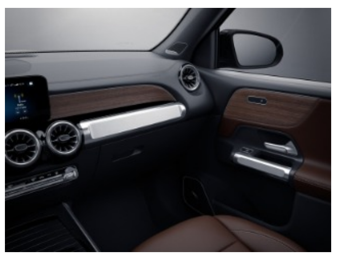
H23 - Natural Grain Brown Walnut Wood Not available w/ AMG Line (DG3PKG)