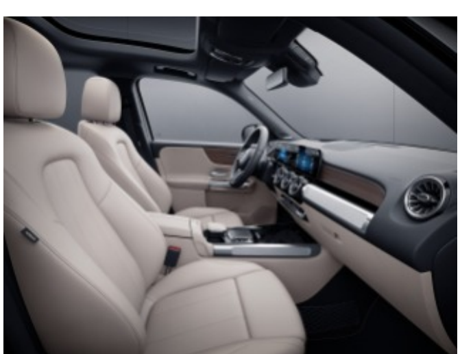
105 - Macchiato Beige (Comfort Seats) Not w/ AMG Line (DG3PKG)