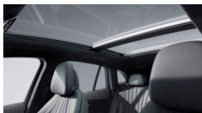
61U - Black Microfiber Headliner

Only with Neva Grey Upholsteries (109, 119, 209, 219)