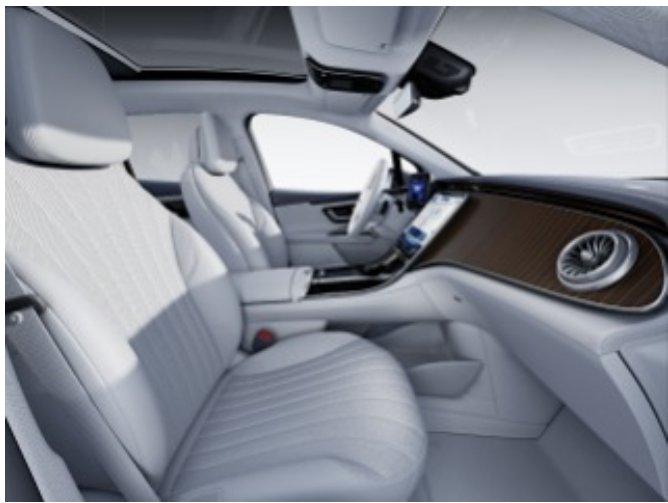
219 - Neva Grey / Biscaya Blue Leather