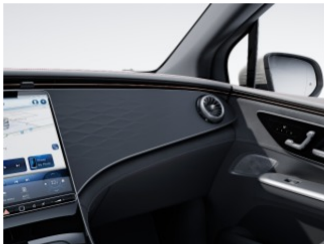
H67 - Anthracite 3D Relief-Optic Trim