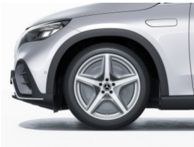
RRT - 20" AMG Five-Spoke Wheels w/ Matte Grey Cladding

Requires AMG Line Exterior Package (DG1). Not with Extended Mobility Tires (R66). Available with Range-Optimized Summer Tires (R01) or All-Season Tires (R02)