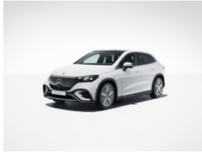
149 - Polar White