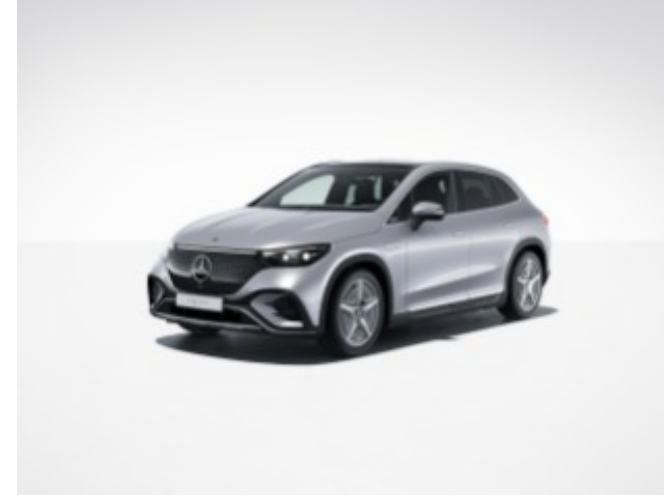
922 - Cirrus Silver Metallic