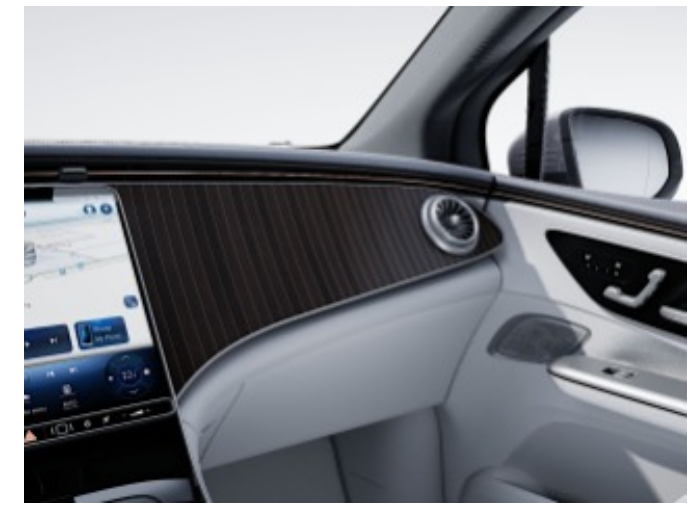
07H - Natural Grain "Yacht-Design" Norway Maple Wood