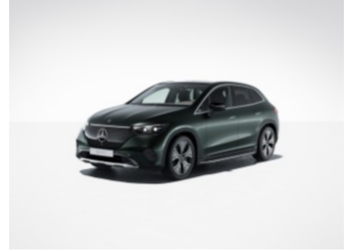
989 - Emerald Green Metallic