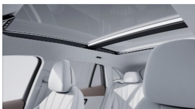
59U - Neva Grey Headliner

Only with Black Upholsteries (111, 121, 131, 201, 211, 221, 801, 804, 821)