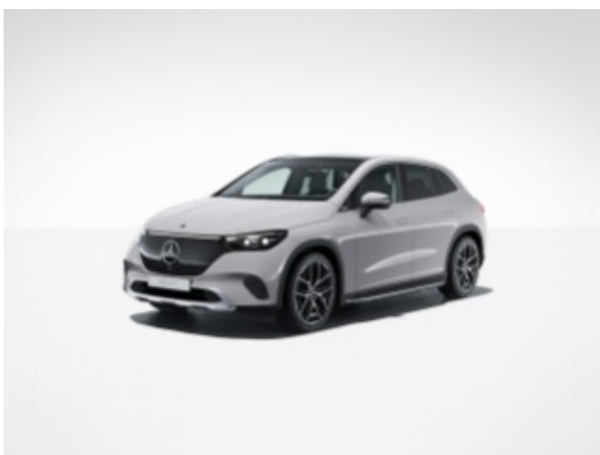
956 - MANUFAKTUR Alpine Grey