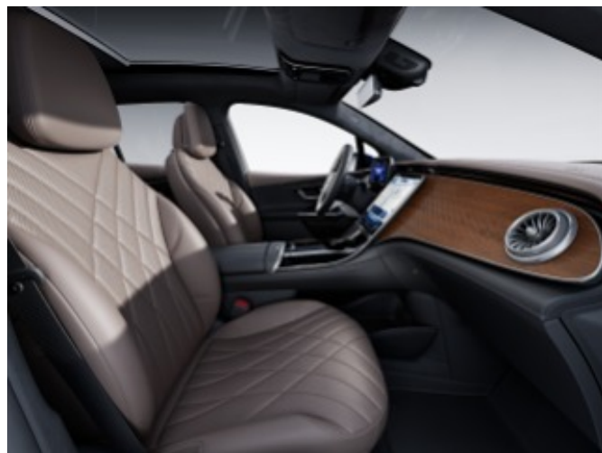
804 - Sable Brown / Black Nappa Leather