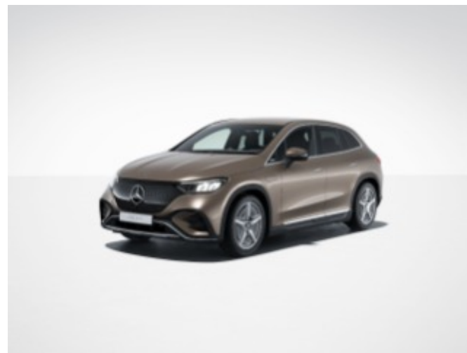
771 - Sonoran Brown Metallic