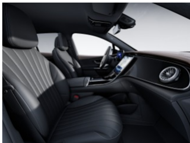
211 - Black / Sable Brown Leather