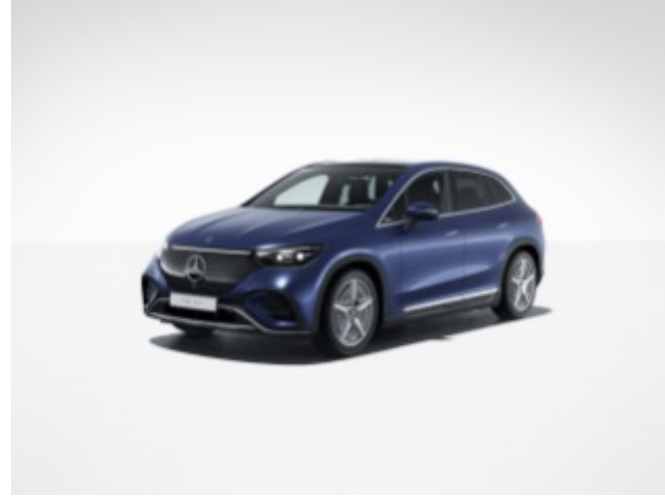
842 - Twilight Blue Metallic