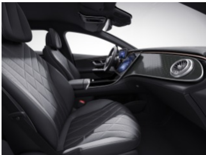
801 - Black / Space Grey Nappa Leather