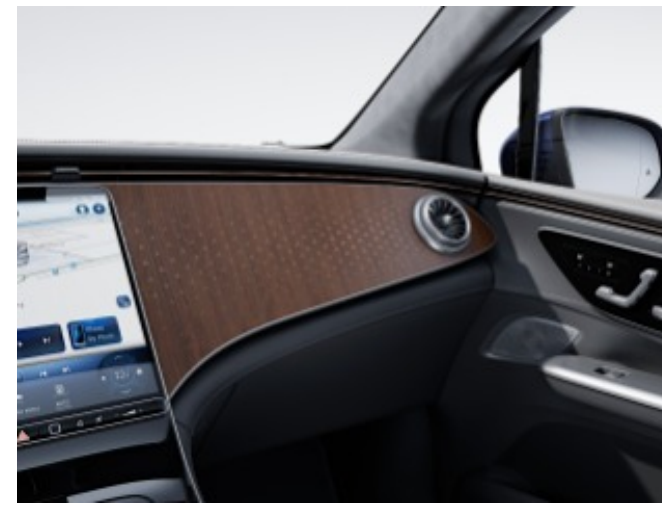
H20 - Natural Grain Brown Magnolia Wood w/ Mercedes-Benz Star Pattern