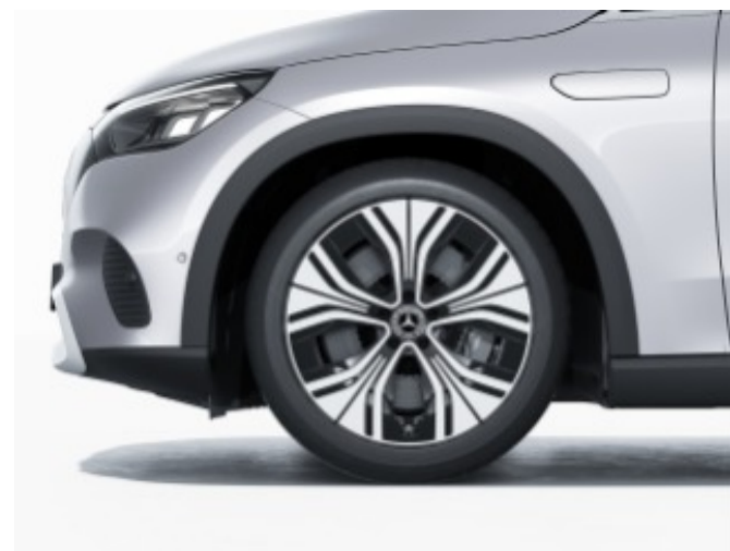
R61 - 20" Five-Spoke Wheels w/ Black Accents

Not with AMG Line Exterior Package (DG1) or Extended Mobility Tires (R66) Available with Range-Optimized Summer Tires (R01) or All-Season Tires (R02)