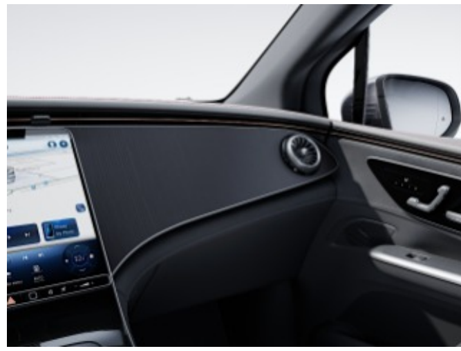
H08 - Natural Grain Anthracite Linden Wood