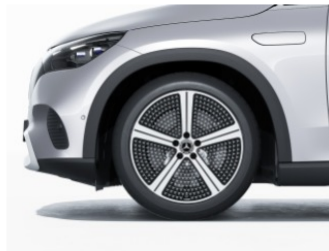
96R - 20" Five-Spoke Aero Wheel w/ Mercedes-Benz Star Pattern

Not with AMG Line Exterior Package (DG1) or Extended Mobility Tires (R66). Available with Range-Optimized Summer Tires (R01) or All-Season Tires (R02)