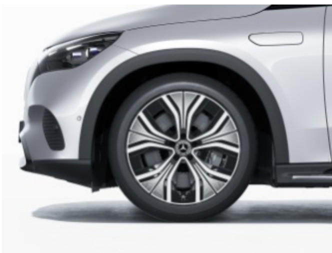
29R - 20" Five-Spoke Wheels w/ Wave Pattern Print

Not with AMG Line Exterior Package (DG1) or Extended Mobility Tires (R66). Available with Range-Optimized Summer Tires (R01) or All-Season Tires (R02)