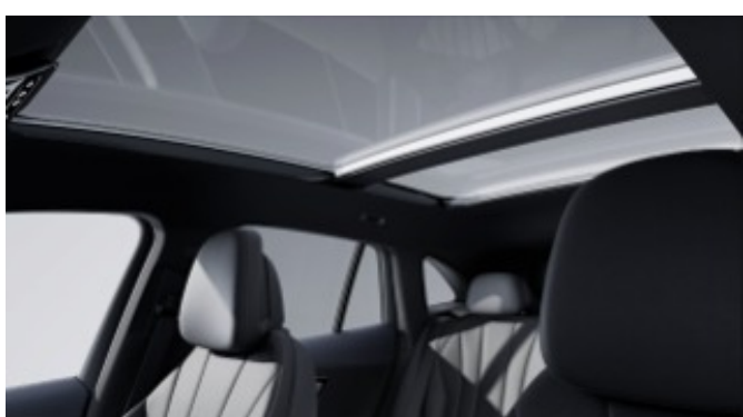
51U - Black Headliner

Only with Black Upholsteries (111, 121, 131, 201, 211, 221, 801, 804, 821)