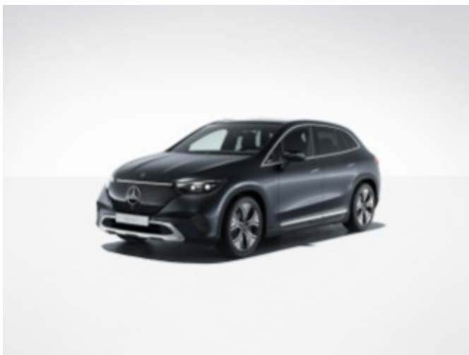
992 - Selenite Grey Metallic