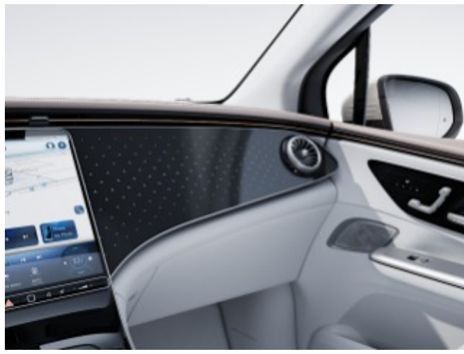
51H+331 - Laser-Cut Backlit Trim with Mercedes-Benz Star Pattern