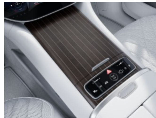
07H+689 - Natural Grain Yacht-Design Norway Maple Wood