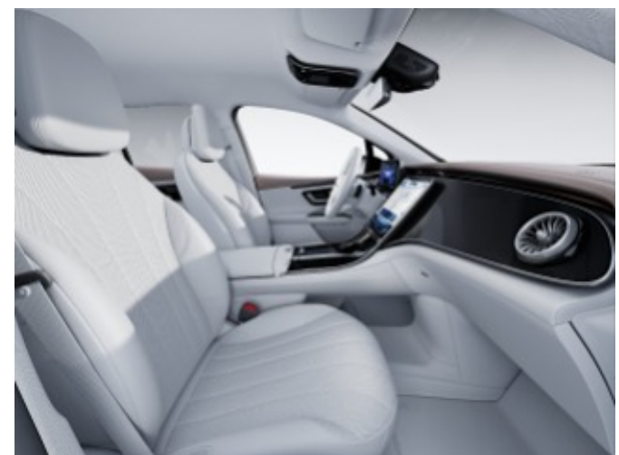
209 - Neva Grey / Sable Brown Leather