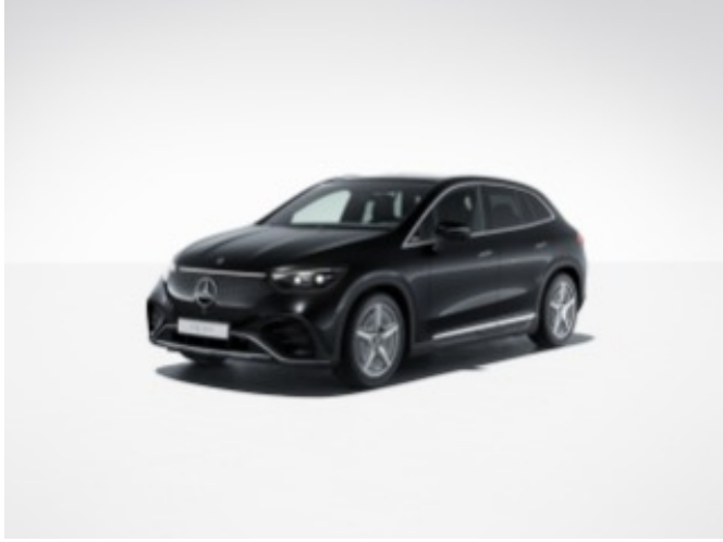
197 - Obsidian Black Metallic