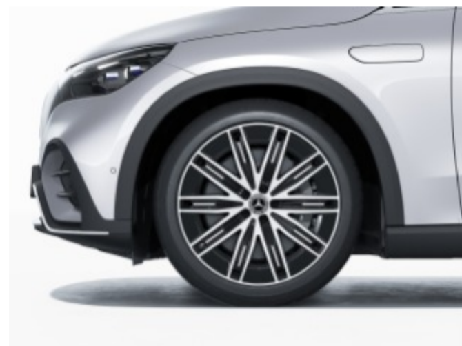
RWX - 21" AMG Multispoke Wheels w/ Black Accents

Requires AMG Line Exterior Package (DG1). Available with Range-Optimized Summer Tires (R01) or All-Season Tires (R02)