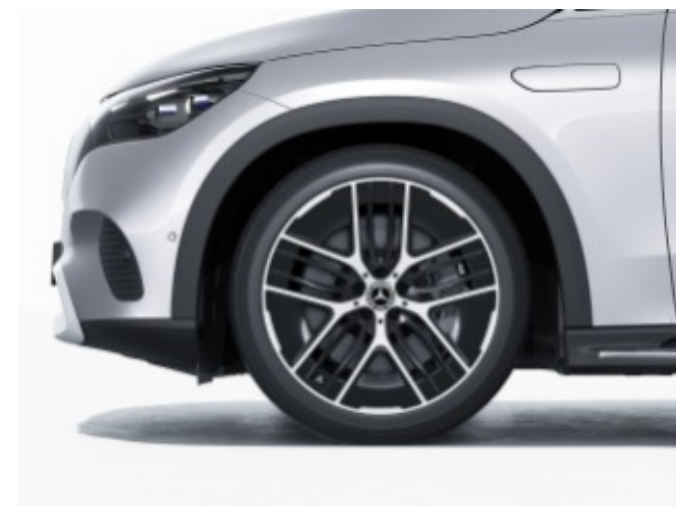
70R - 21" Five Quad-Spoke Wheels w/ Black Accents

Not with AMG Line Exterior Package (DG1). Available with Range-Optimized Summer Tires (R01) or All-Season Tires (R02)