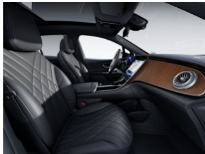
821 - Black / Biscaya Blue Nappa Leather

Requires Multicontour Front Seats Package (DB6)