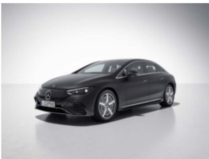
818 - MANUFAKTUR Graphite Grey Magno