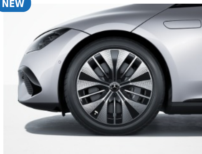
R33 - 20" Five-Twin Spoke Wheels w/ Black Dot Pattern

Non-Runflat Only (no code), only with Range-Optimized Summer Tires (R01) 255/35 R 21 on 9.0J x 21 ET50 (front) and 285/30 R 21 on 10.0J x 21 ET66 (rear)