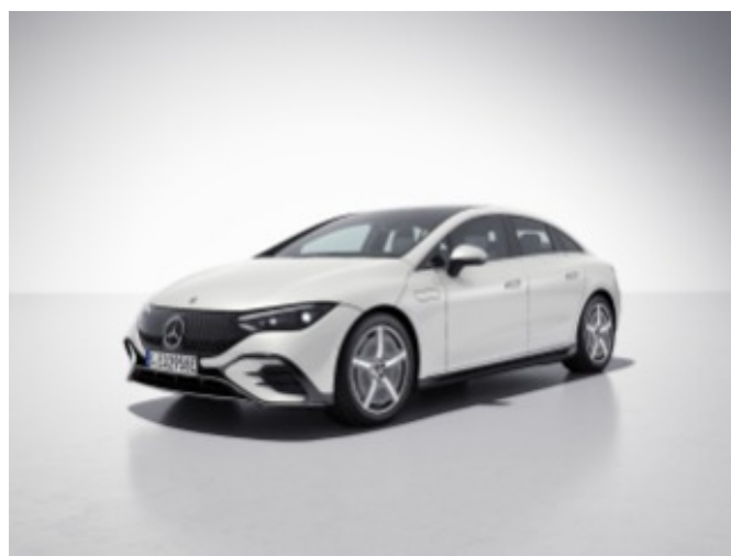
885 - MANUFAKTUR Moonlight White Metallic