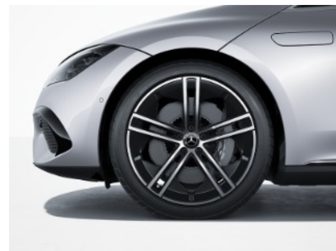
81R - 21" Five-Twin Spoke Wheels w/ Black Accents (Staggered)

Requires Range-Optimized Summer Tires (R01) and AIRMATIC (489). Not with 10-Degree Rear Axle Steering (216)