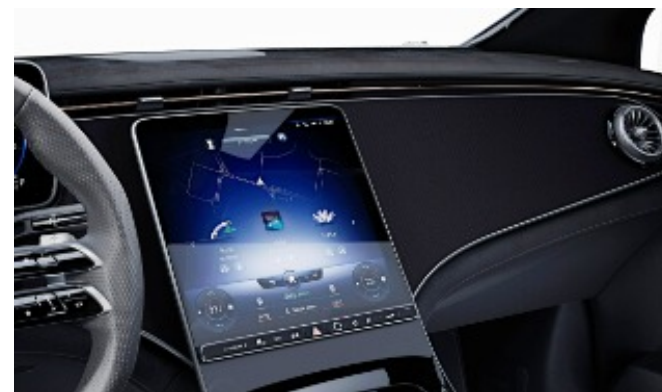
H08 - Natural Grain Anthracite Linden Wood