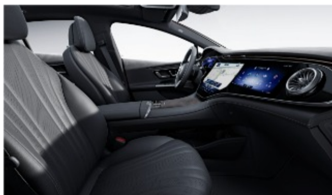
201 - Black / Space Grey Leather