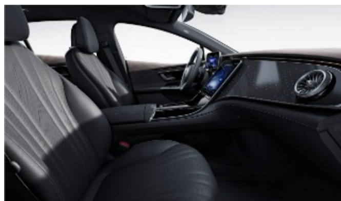
211 - Black / Sable Brown Leather