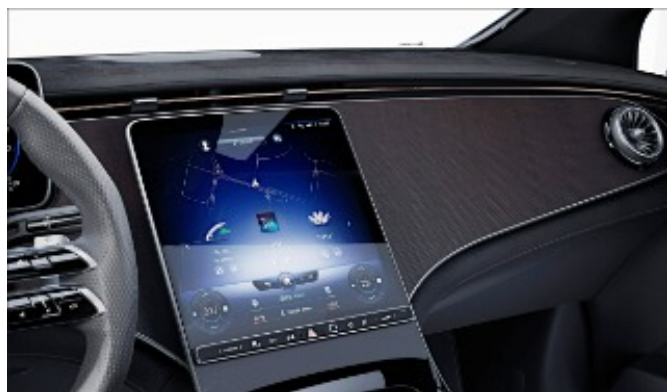
01H - Natural Grain Brown Wood w/ Black Print