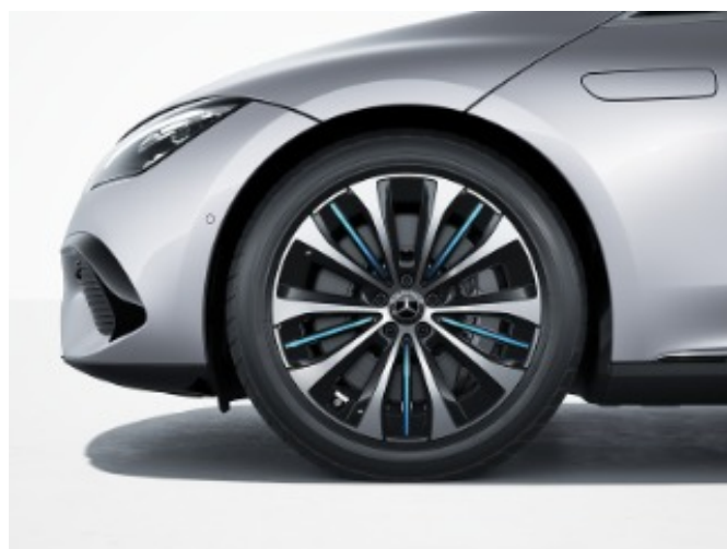
59R - 20" Five-Twin Spoke Wheels w/ Blue Accents