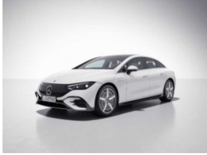
149 - Polar White