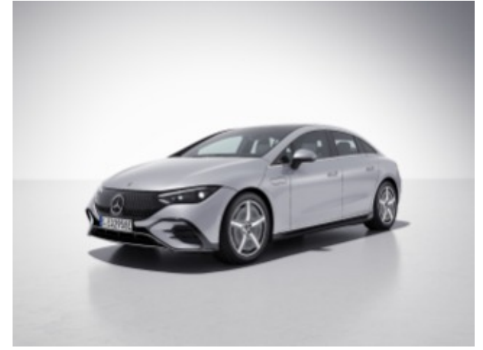
922 - Cirrus Silver Metallic