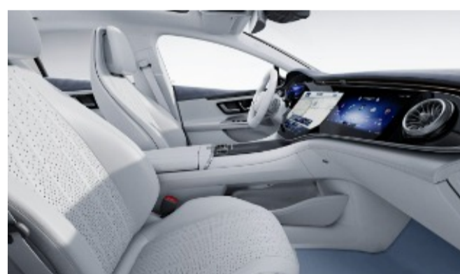
249 - AMG Neva Grey / Biscaya Blue Leather

Requires Black Seatbelts (U17) Requires AMG Line Interior Package (DG2)