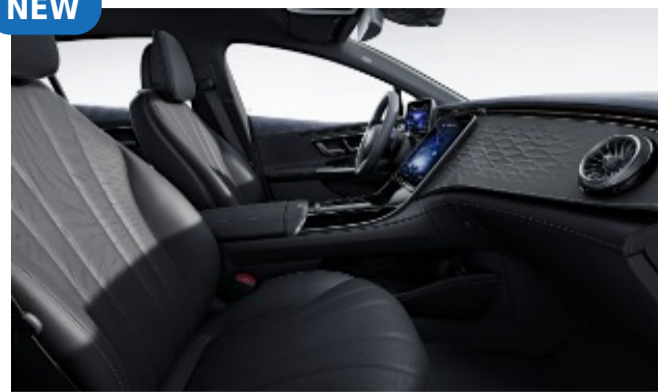
131 - Black / Biscaya Blue MB-Tex