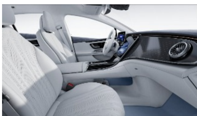
219 - Neva Grey / Biscaya Blue Leather