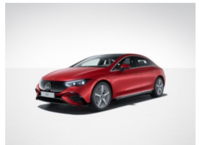
993 - MANUFAKTUR Patagonia Red Metallic