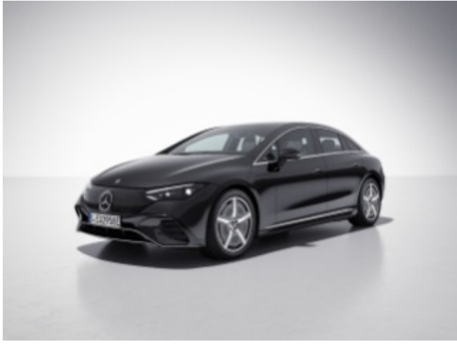
197 - Obsidian Black Metallic