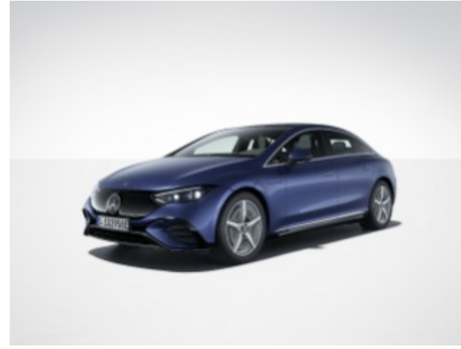
842 - Twilight Blue Metallic