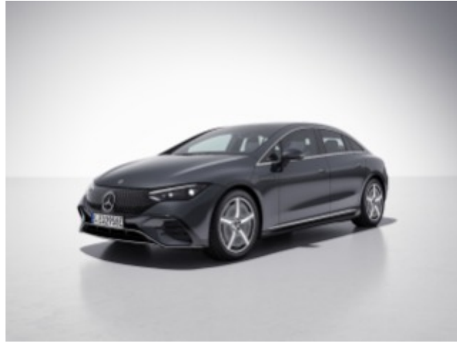
831 - Graphite Grey Metallic