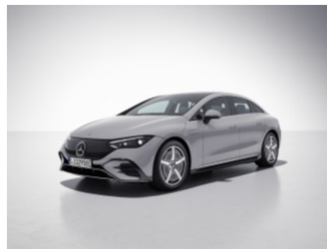
956 - MANUFAKTUR Alpine Grey Non-Metallic