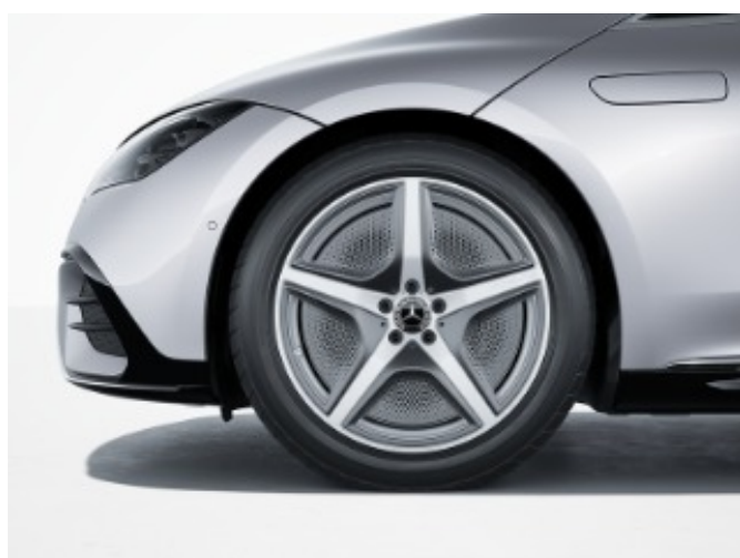
RRP - 20" AMG Five Spoke Wheels w/ Matte Grey Accents

21" Non-Run Flat Only (no code). Only with Range-Optimized Summer Tires (R01) 255/35 R 21 on 9.0J x 21 ET50 (front) and 285/30 R 21 on 10.0J x 21 ET66 (rear)