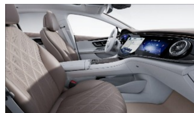
814 - Sable Brown / Neva Grey Nappa Leather