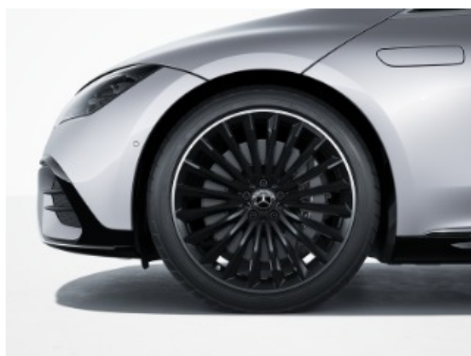
RWI - 21" AMG Multispoke Wheels in Black (Staggered)

Requires Range-Optimized Summer Tires (R01), AMG Line Exterior Package (DG1), and AIRMATIC (489). Not with 10-Degree Rear Axle Steering (216)