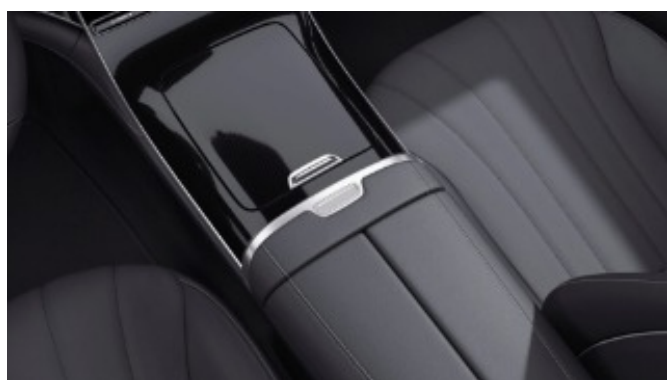
661 - Center Console in Black Fine Structure