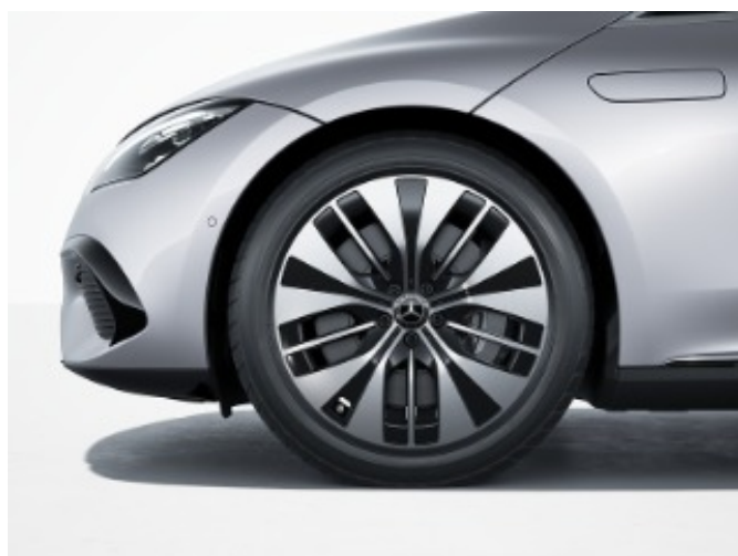
60R - 20" Five-Twin Spoke Wheels w/ Black Accents