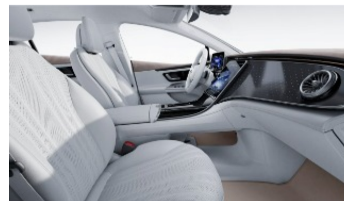
209 - Neva Grey / Sable Brown Leather