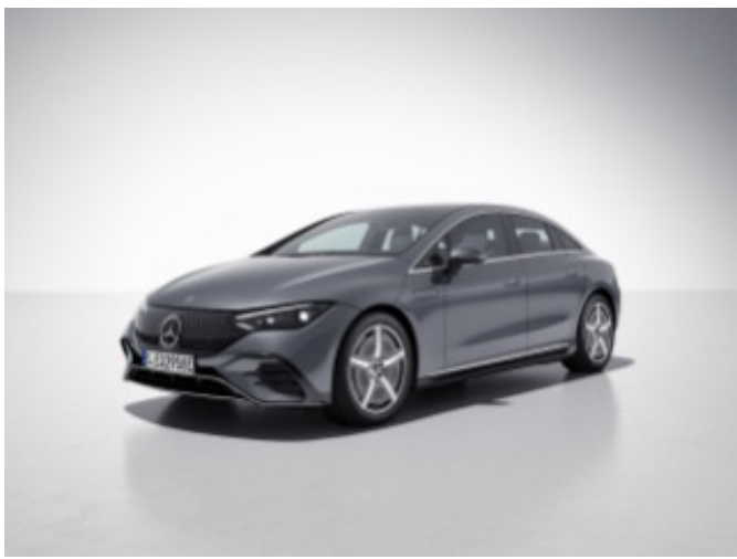
992 - Selenite Grey Metallic