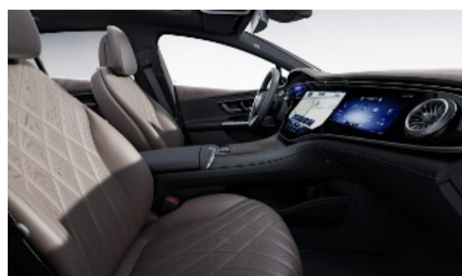
804 - Sable Brown / Black Nappa Leather