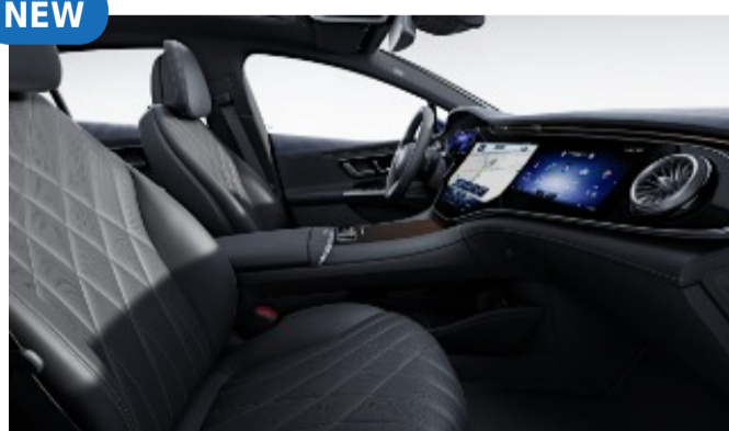
821 - Black / Biscaya Blue Nappa Leather