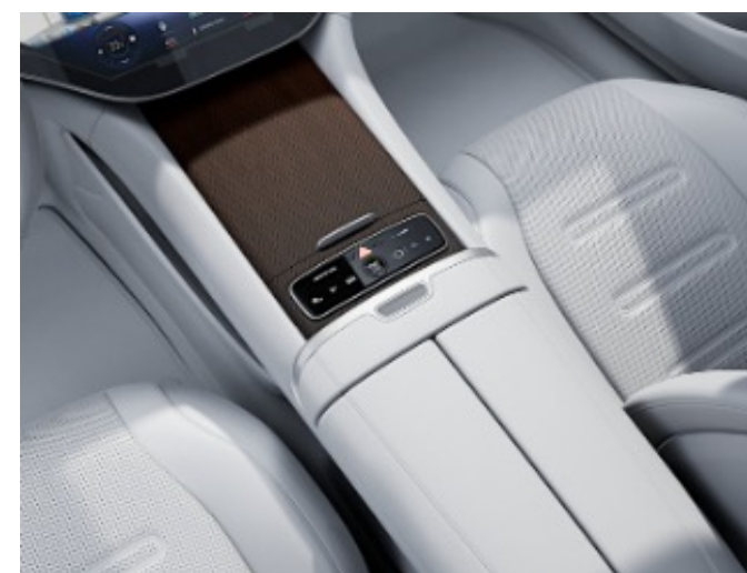
01H + 786 - Natural Grain Brown Wood w/ Black Print