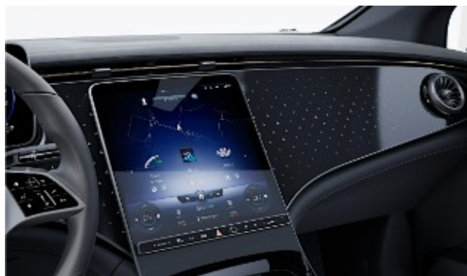
51H - Laser-Cut Backlit Trim w/ Mercedes-Benz Pattern