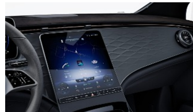
H67 - Anthracite 3D Relief-Optic Trim