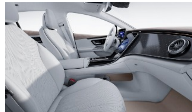
109 - Neva Grey / Sable Brown MB-Tex