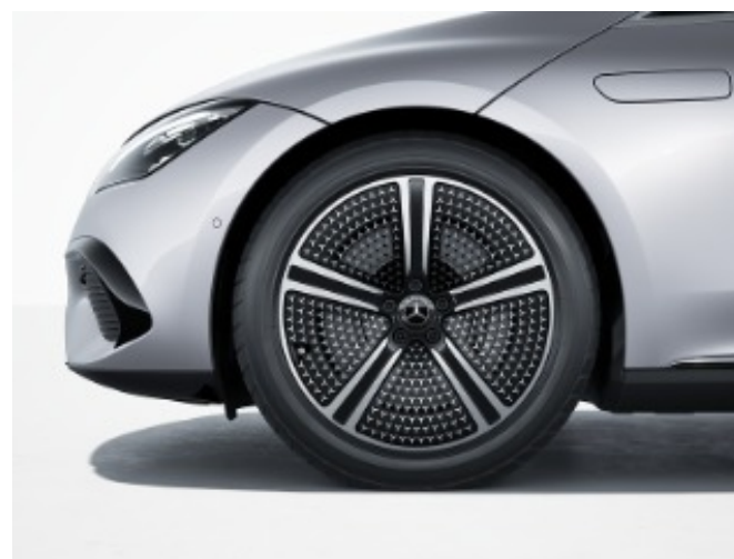
R61 - 20" Five Spoke Wheels w/ Mercedes-Benz Star Pattern