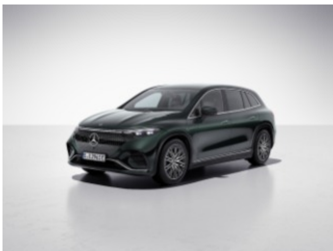
989 - Emerald Green Metallic