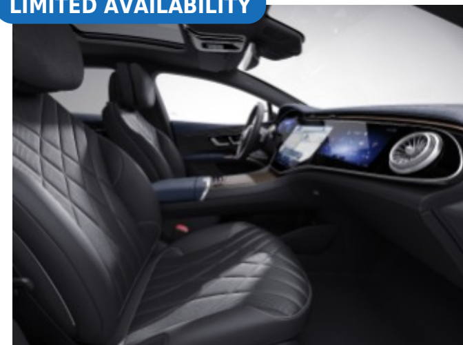
821 - Black / Biscaya Blue Nappa Leather - Not Orderable

No longer orderable for remainder of MY23 due to supplier constraint Premium (DY0): Requires Multicontour Front Seats (399) and Rapid Heating Front Seats (902).