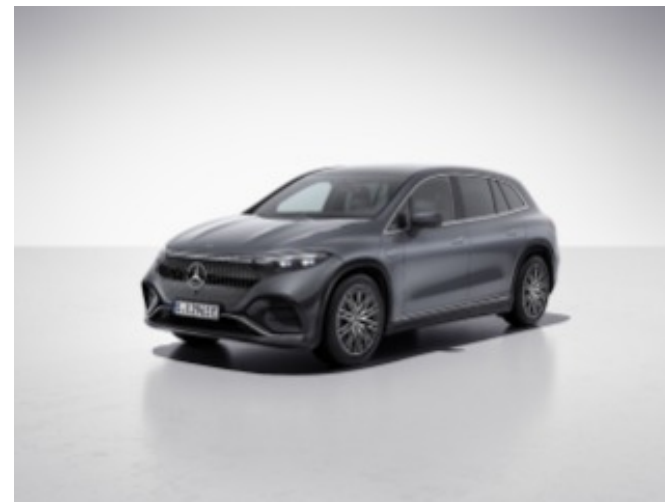
992 - Selenite Grey Metallic