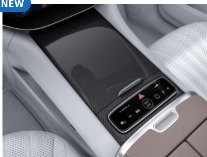
H73+732 - AMG Carbon Fiber Trim

EQS 580 4MATIC only. Not available on EQS 450+ or EQS 450 4MATIC.