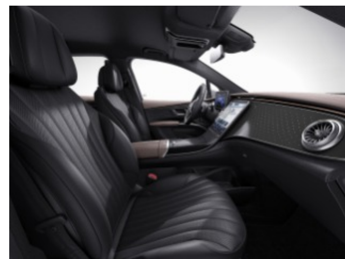
211 - Black / Sable Brown Leather Limited availability until September production