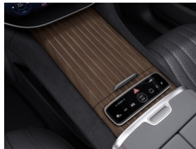
H39+697 - Natural Grain "Yacht-Design" Brown Walnut with Aluminum Lines Center Console and Door Trim