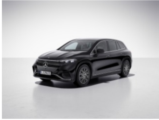
040 - Black