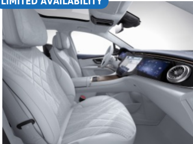
509 - MANUFAKTUR Neva Grey / Biscaya Blue Nappa Leather - Not Orderable

No longer orderable for remainder of MY23 due to supplier constraint