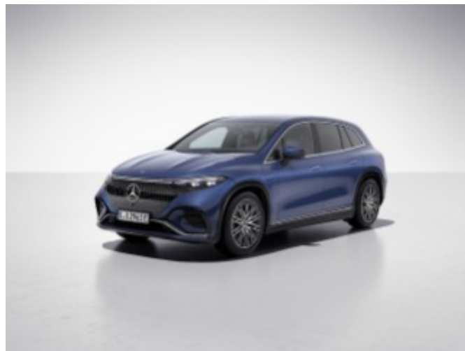
842 - Twilight Blue Metallic