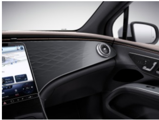
H67 - Anthracite 3D Relief-Optic Dashboard and Door Trim

Star pattern illumination matches ambient light color.