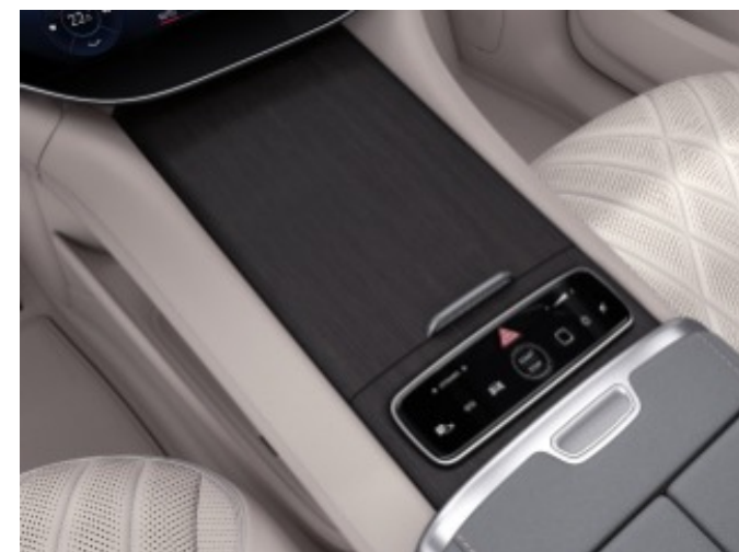
H08+775 - Natural Grain Anthracite Linden Wood Center Console and Door Trim