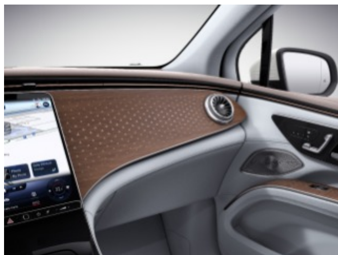
H20 - Natural Grain Brown Magnolia w/ Aluminum Mercedes-Benz Stars