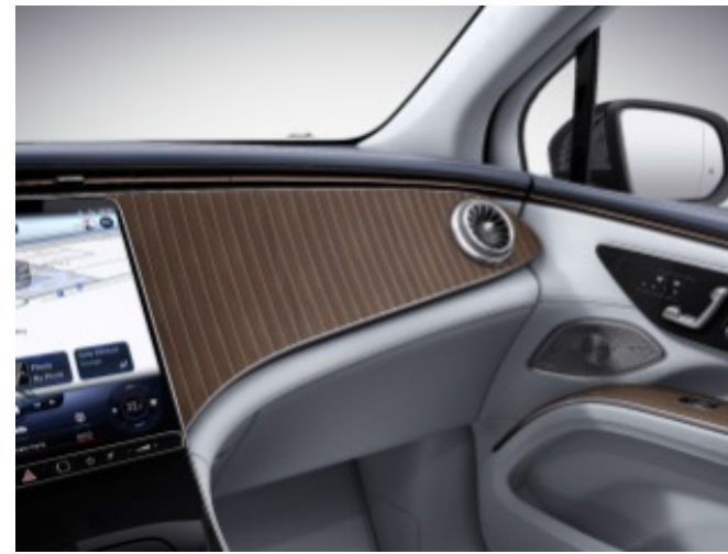
H39 - Natural Grain "Yacht-Design" Brown Walnut with Aluminum Lines Dashboard and Door Trim