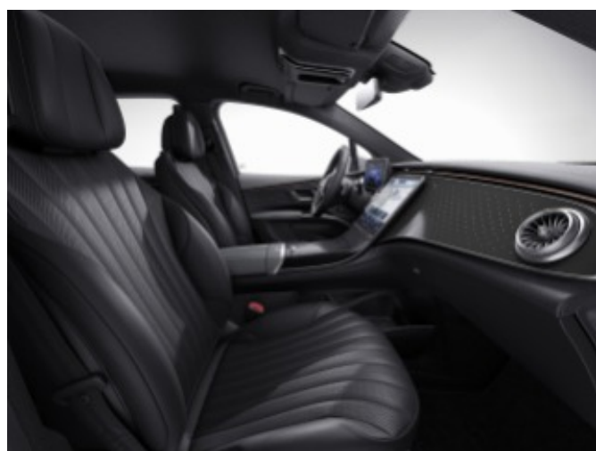
201 - Black / Space Grey Leather