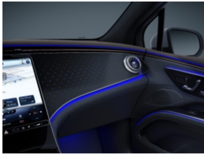
51H + 331 - Backlit Laser-Cut Mercedes-Benz Star Pattern Dashboard Trim

Star pattern illumination matches ambient light color.