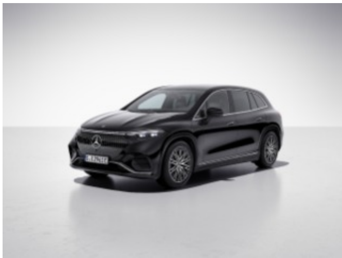
197 - Obsidian Black Metallic