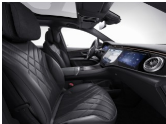
801 - Black / Space Grey Nappa Leather

Premium (DY0): Requires Multicontour Front Seats (399) and Rapid Heating Front Seats (902).