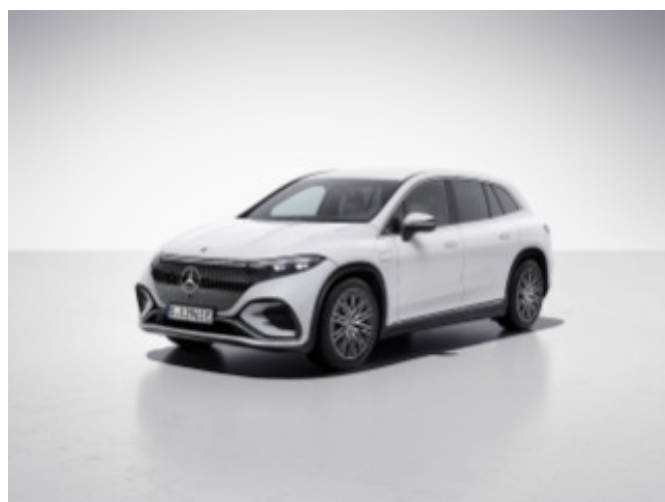
799 - MANUFAKTUR Diamond White Metallic