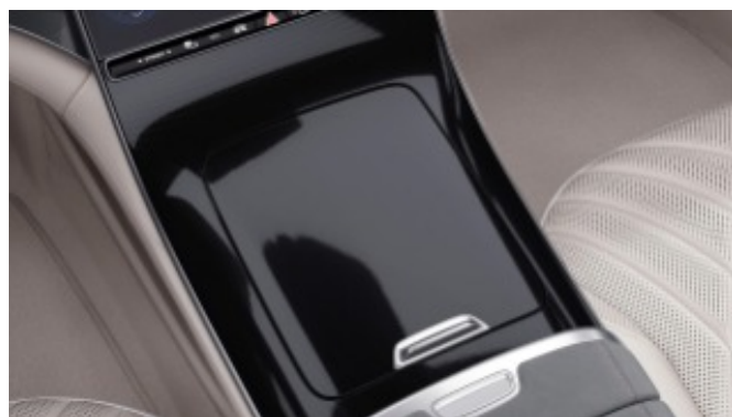
661 - Center Console in Black Fine Structure