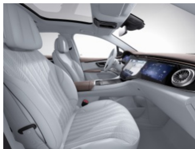
209 - Neva Grey / Sable Brown Leather