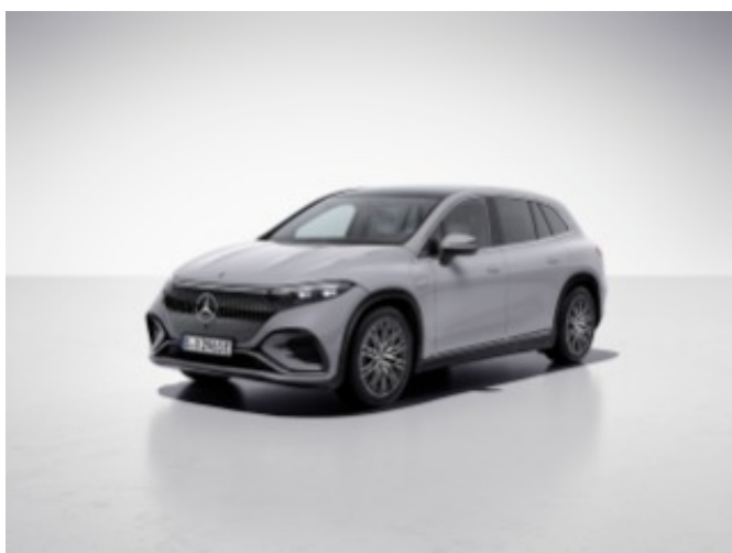
956 - MANUFAKTUR Alpine Grey