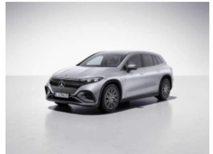
922 - Cirrus Silver Metallic