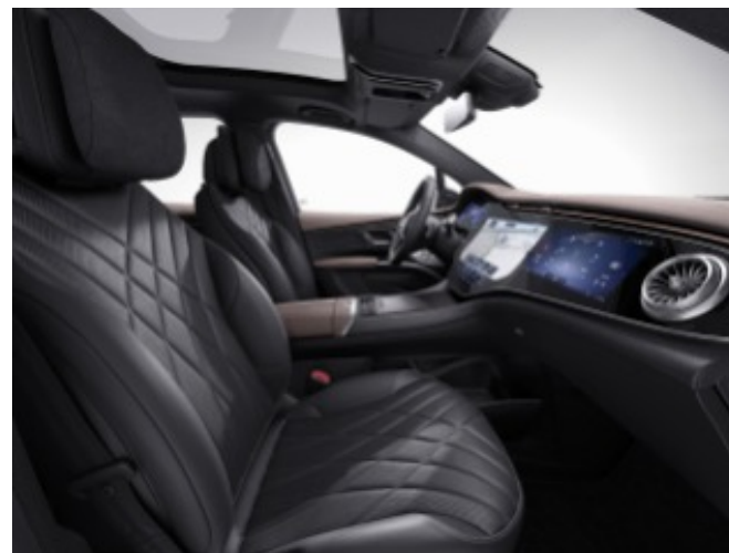
811 - Black / Sable Brown Nappa Leather

Exclusive (DY1): No requirements Pinnacle (DY2): No requirements