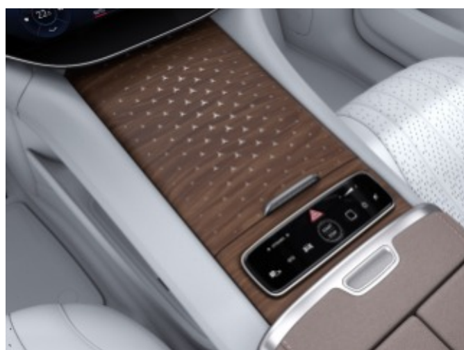
H20+781 - Natural Grain Brown Magnolia w/ Aluminum Mercedes-Benz Stars