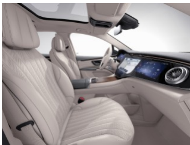
205 - Macchiato Beige / Space Grey Leather