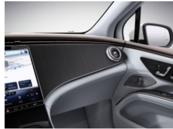
H08 - Natural Grain Anthracite Linden Wood Dashboard and Door Trim