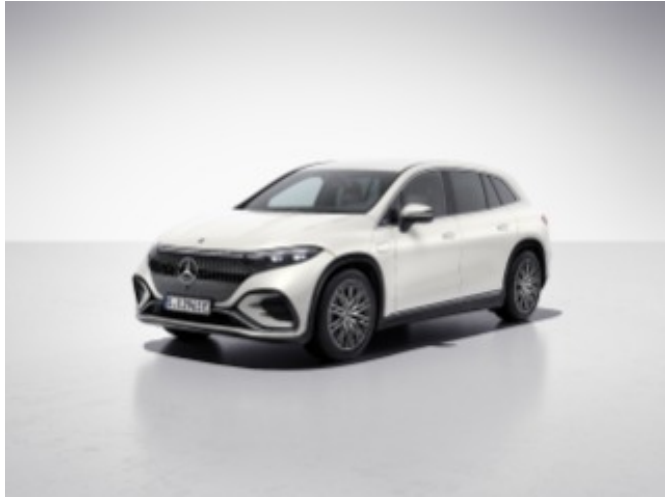
149 - Polar White