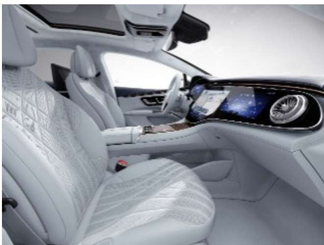
519 - Edition One Neva Grey / Stratus Blue Iridescent-Effect Nappa Leather

Not available with AMG Line Interior (DG2), or MANUFAKTUR Cardinal Red Paint (996)