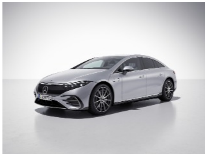
922 - Cirrus Silver Metallic