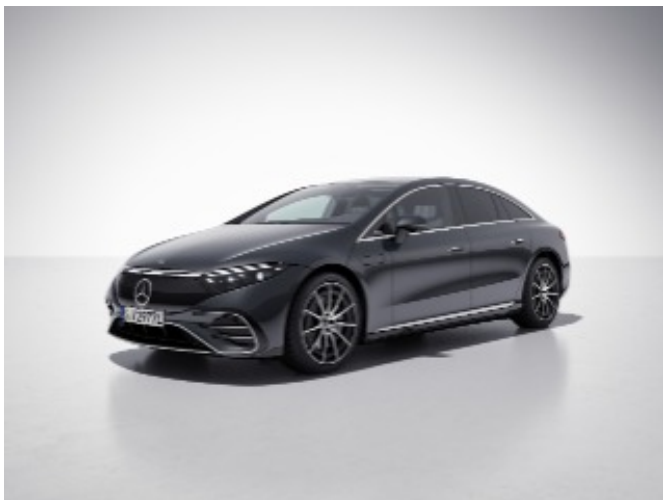
831 - Graphite Grey Metallic