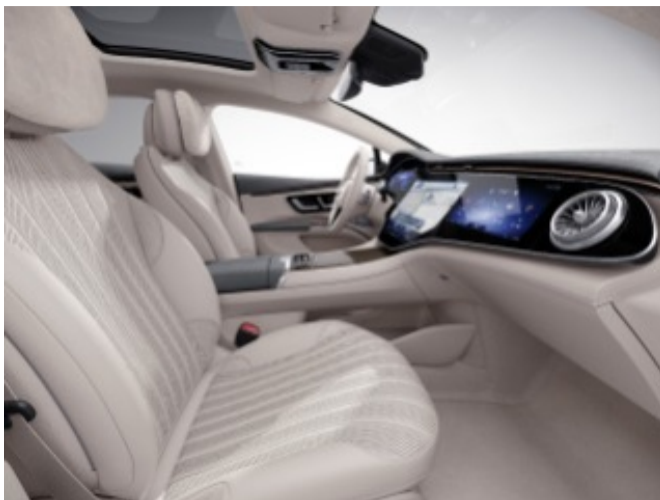
205 - Macchiato Beige / Space Grey Leather