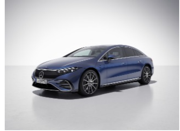
842 - Twilight Blue Metallic