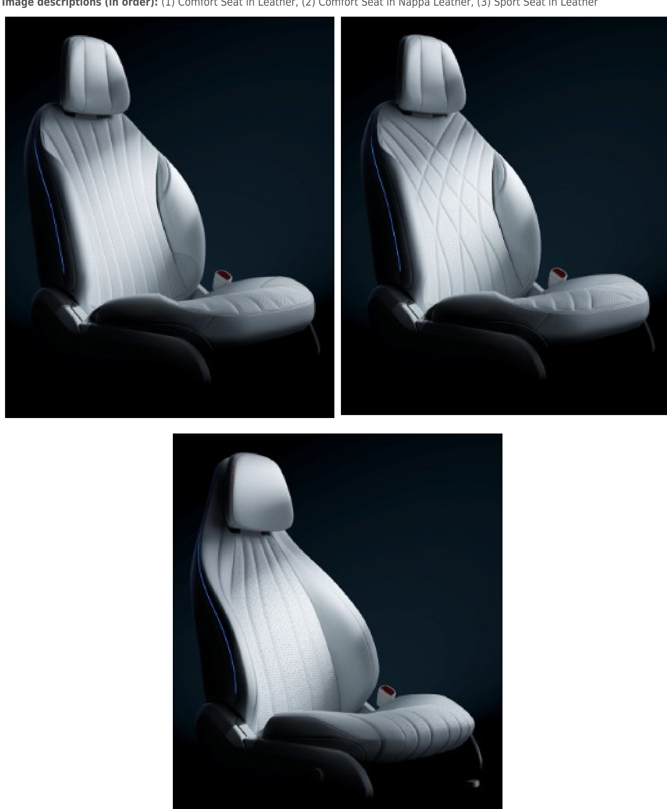
Image descriptions (in order): (1) Comfort Seat in Leather, (2) Comfort Seat in Nappa Leather, (3) Sport Seat in Leather