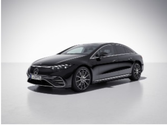
197 - Obsidian Black Metallic