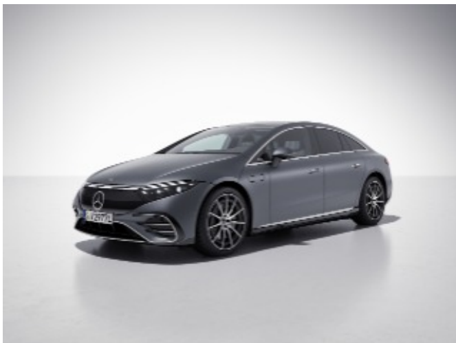
297 - MANUFAKTUR Selenite Grey magno