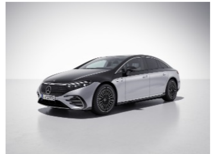
C35 - MANUFAKTUR Two-Tone Obsidian Black / Cirrus Silver