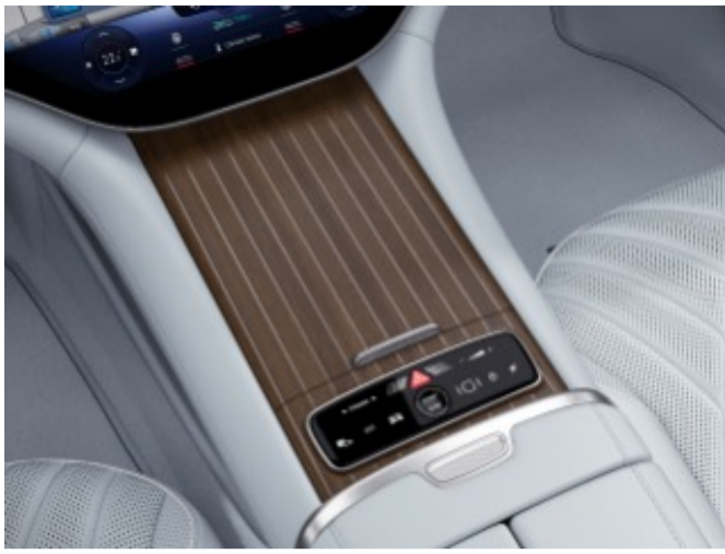
H39 + 697 - Natural Grain "Yacht-Design" Brown Walnut with Aluminum Lines Center Console and Door Trim