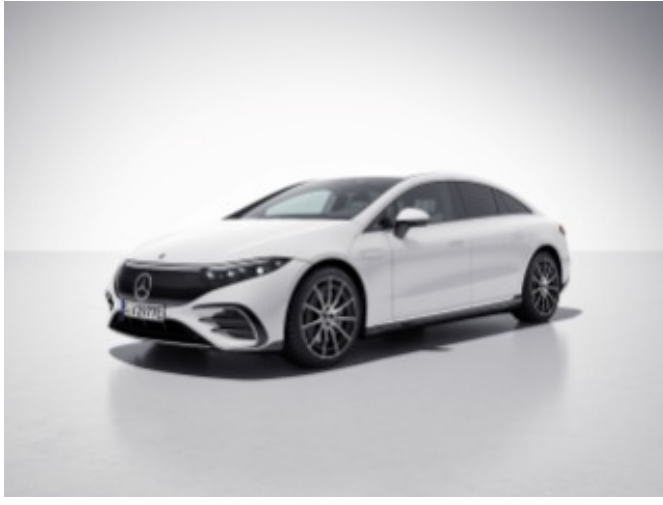
149 - Polar White