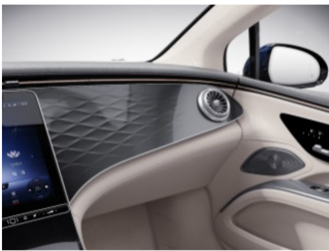
H67 - Anthracite 3D Relief-Optic Dashboard and Door Trim

Not available with MBUX Hyperscreen (DA0). Star pattern illumination matches ambient light color.