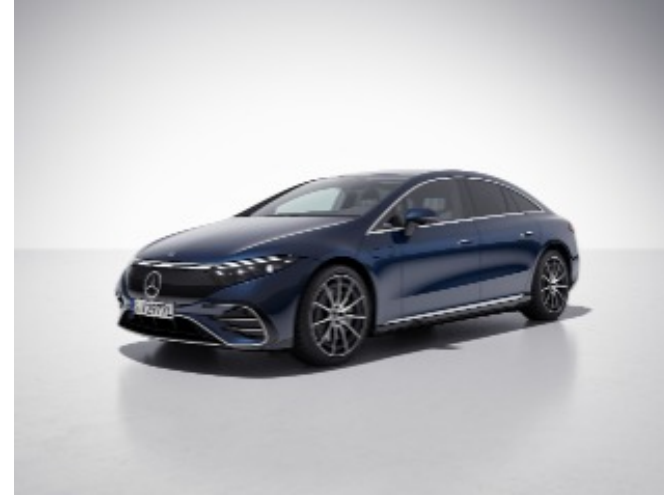
595 - Nautical Blue Metallic