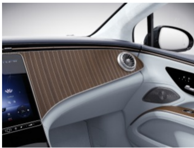
H39 - Natural Grain "Yacht-Design" Brown Walnut with Aluminum Lines Dashboard and Door Trim

Not available with MBUX Hyperscreen (DA0)