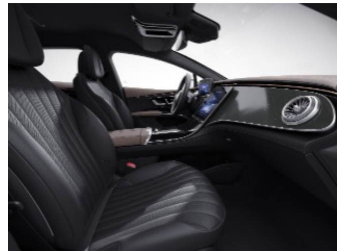
211 - Black / Sable Brown Leather