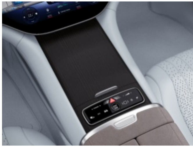
H08 + 775 - Natural Grain Anthracite Linden Wood Center Console and Door Trim