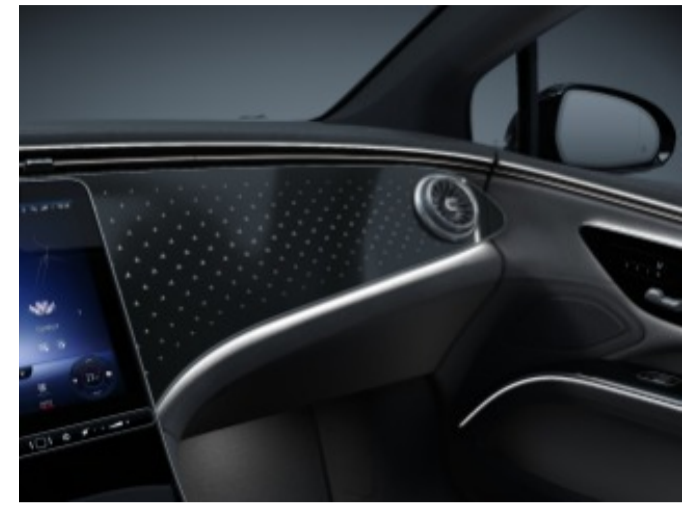
51H + 331 - Backlit Laser-Cut Mercedes-Benz Star Pattern Dashboard Trim

Not available with MBUX Hyperscreen (DA0). Star pattern illumination matches ambient light color.