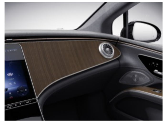
H12 - Natural Grain Brown Walnut Wood Dashboard and Door Trim

Not available with MBUX Hyperscreen (DA0)