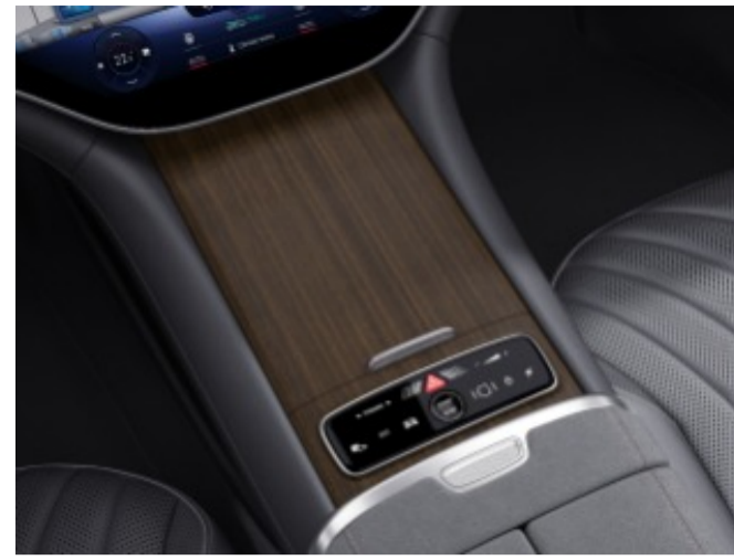
H12 + 798 - Natural Grain Brown Walnut Wood Center Console and Door Trim