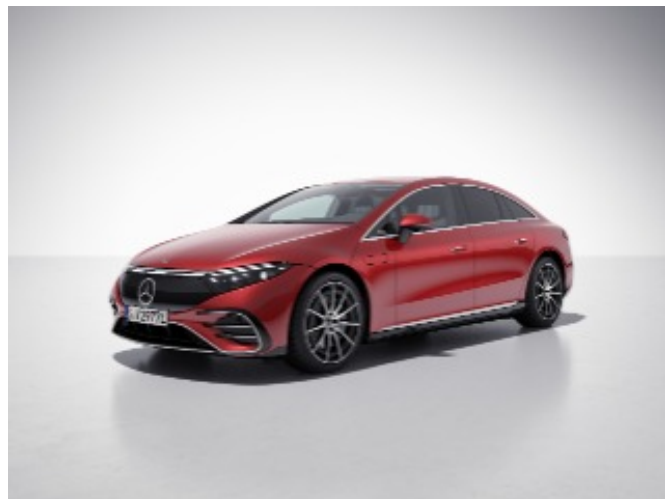
996 - MANUFAKTUR Cardinal Red Metallic

Not available with 18R Wheel or 509 Upholstery