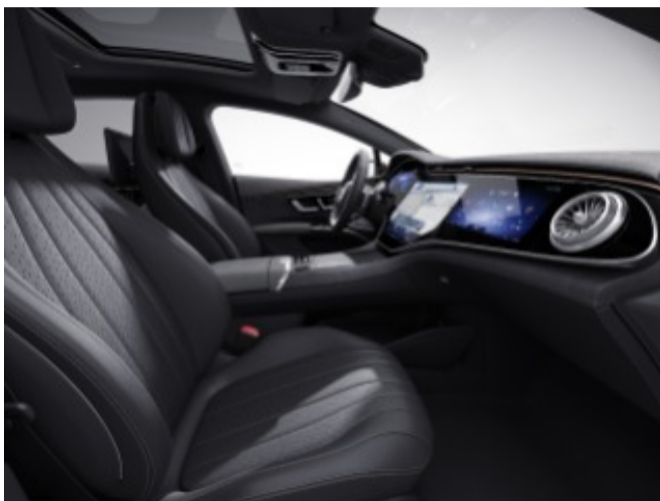
231 - AMG Line Black / Space Grey Leather with Red Stitching Accents

Requires AMG Line Interior Package (DG2) Seats feature Digital Rain perforation pattern