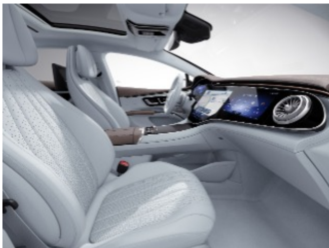
229 - AMG Line Neva Grey / Sable Brown

Requires AMG Line Interior Package (DG2) Seats feature Digital Rain perforation pattern