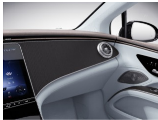
H08 - Natural Grain Anthracite Linden Wood Dashboard and Door Trim

Not available with MBUX Hyperscreen (DA0)