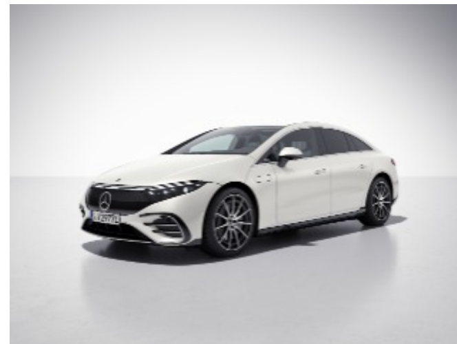
799 - MANUFAKTUR Diamond White Metallic

Not available with 18R Wheel or 509 Upholstery