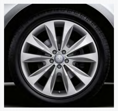
20in. Twin 5-Spoke Wheel (50R) (Available in 322 package)