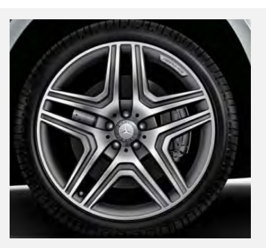
21in. AMG Twin 5-Spoke Wheel (798)