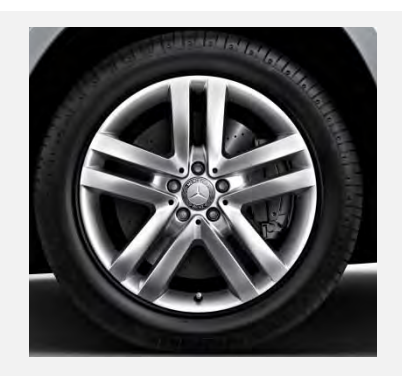
19in. Twin 5-Spoke Wheel (R55)