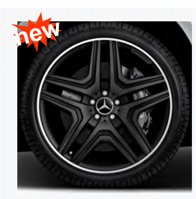
21in. AMG Black Twin 5-Spoke Wheel 21in. AMG Black Twin 5-Spoke Wheel (695)