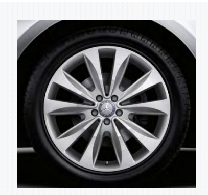
20in. Twin 5-Spoke Wheel (50R) (Available in 322 package)