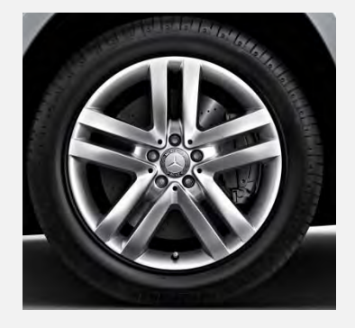
19in. Twin 5-Spoke Wheel (R55)