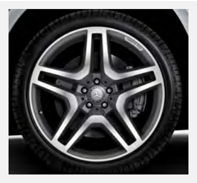
21in. AMG Twin 5-Spoke Wheel (757)