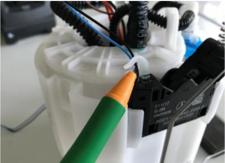
Figure 3 (remove lines from routing clip)