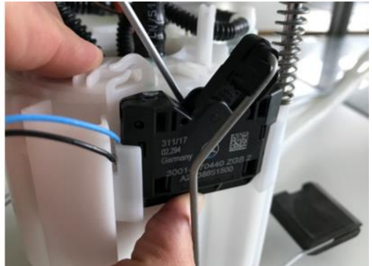
Figure 4 (using a screwdriver, carefully push float-and-lever sensor housing away from module housing and at the same time push float-and-lever sensor housing upwards.)