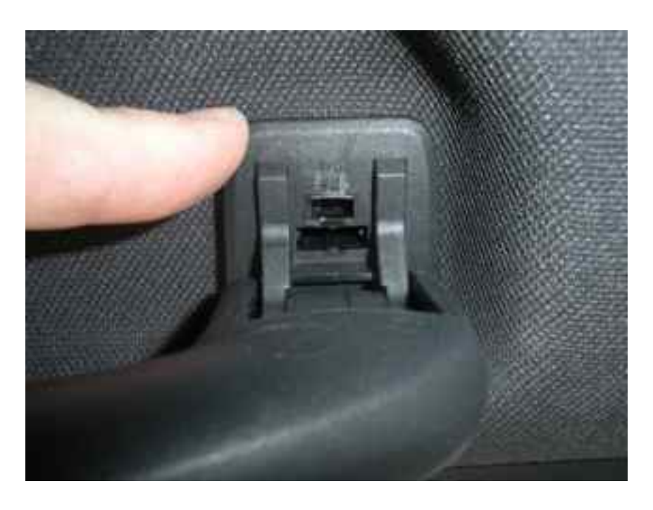
Once the handle removed it should look like this.