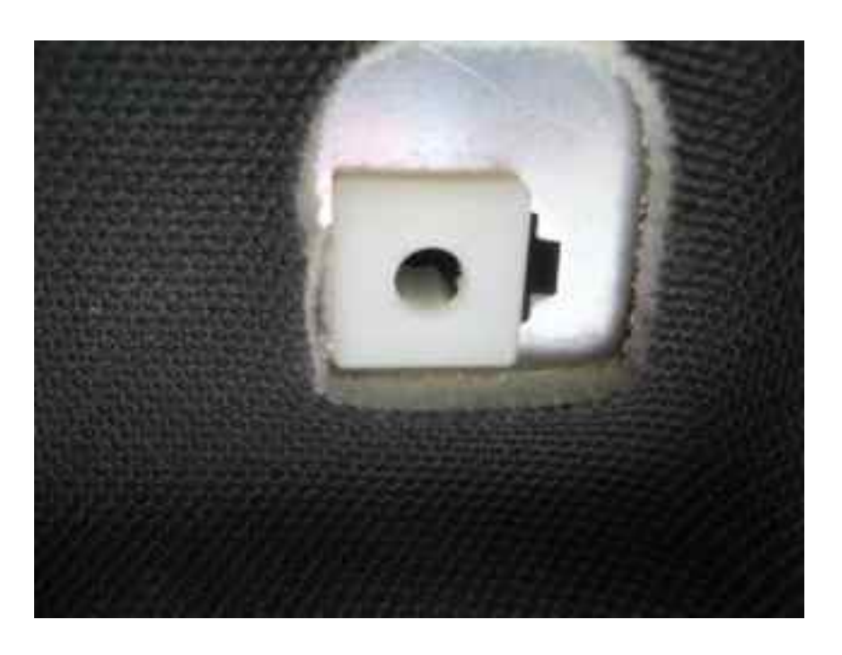
You will need to line these up, approx. width is 5" 5/8" centre to centre.