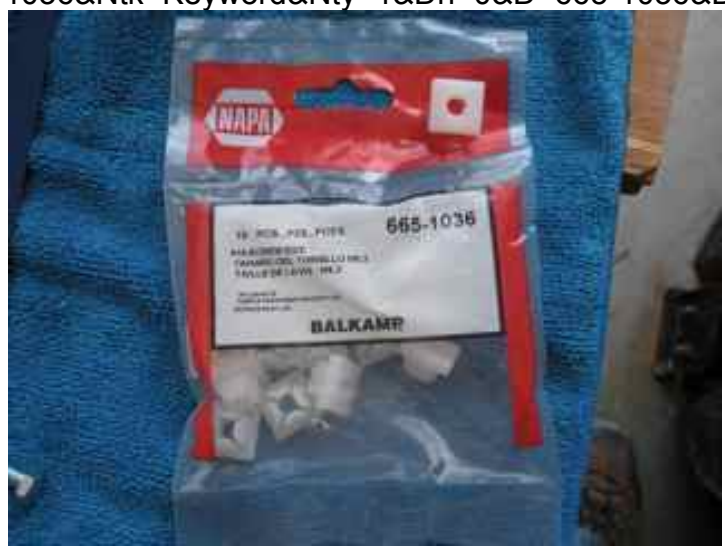
1/4" X 1/2" length screws

1036&Ntk=Keyword&Nty=1&Dn=0&D=665-1036&Dk=1&Dp=3&N=0