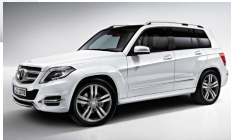
149 - Polar White