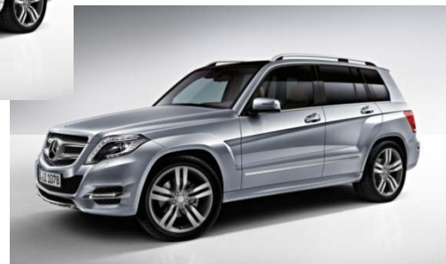
988 - Diamond Silver