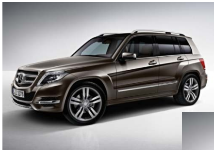
986 - Luzonit Grey