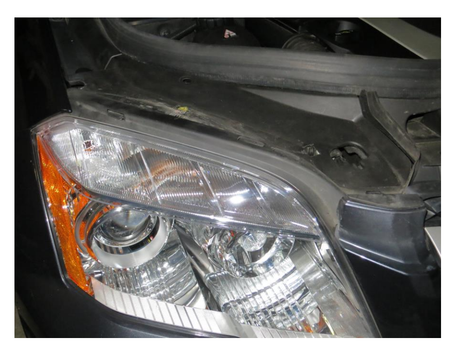
Push in the tab and pull off the black cover.

Open the hood. In this demonstration, the front left marker light is being replaced.