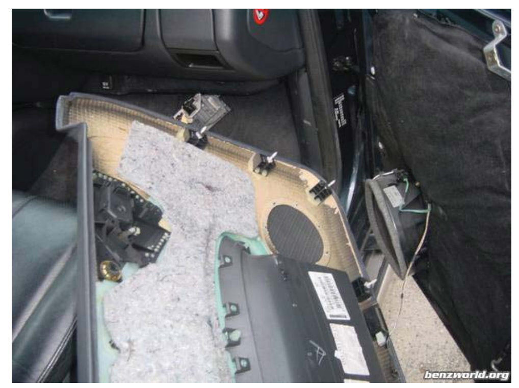
push the panel back into place. Best to hook the top in place first (over the door pin), then let it hang there while postioning the white clips correctly at the bottom.