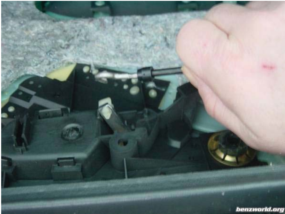
replace Inside door lever cable .... now we are on the home run!