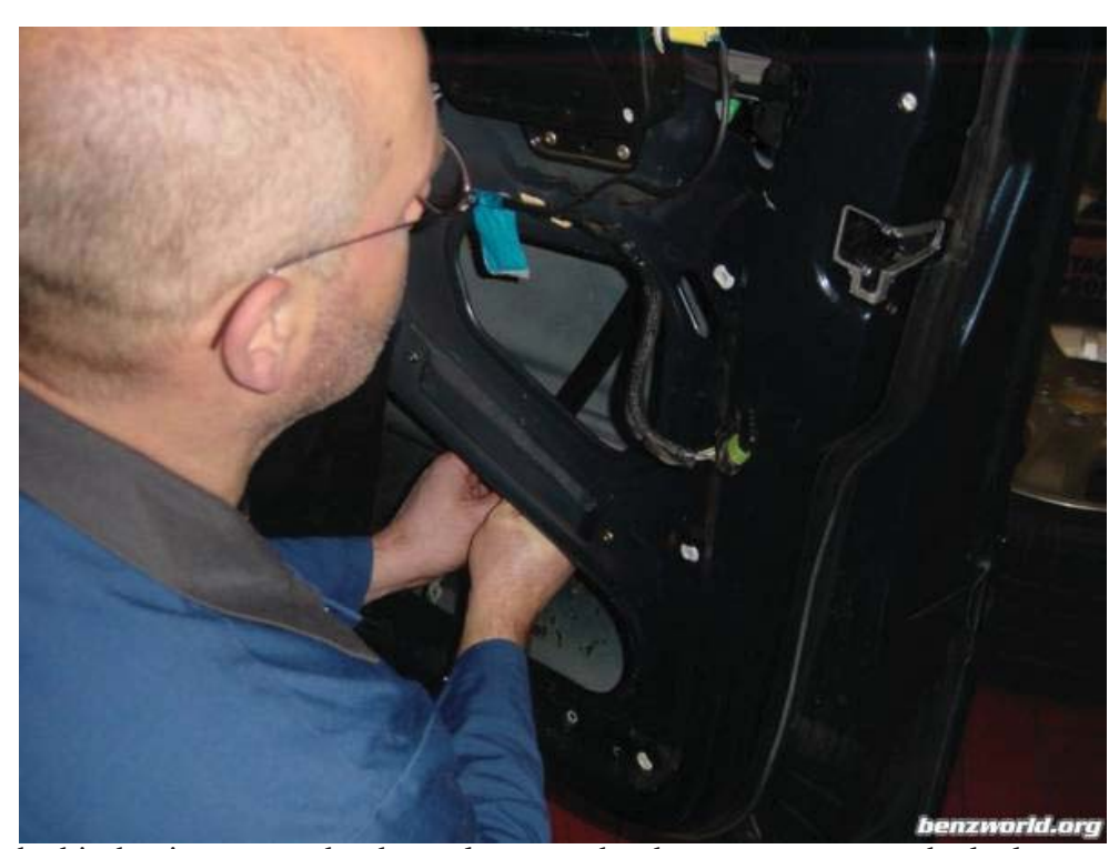
Now here comes the bit that is supposed to be real easy .... but because we screw the lock onto the door became awkward!