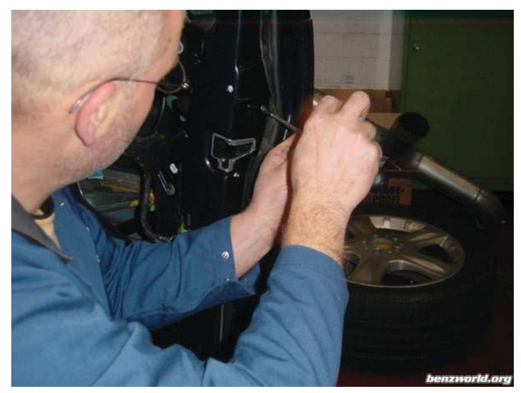
\ldots on second thoughts \ldots lets remove those lock screws \ldots\ldots