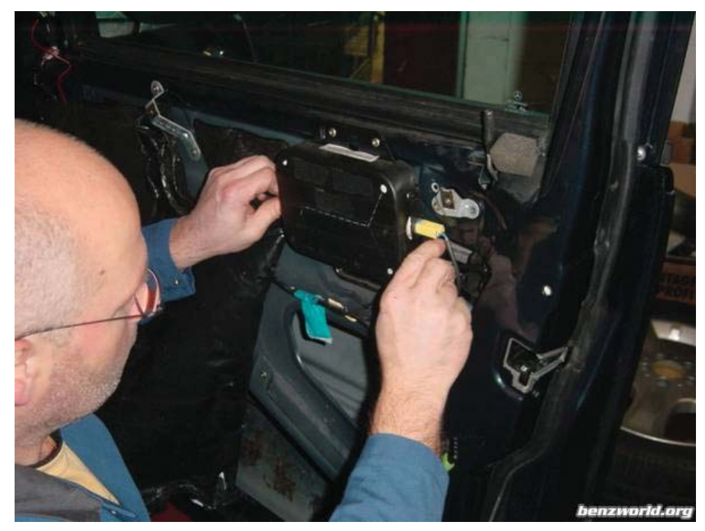
replace the cable in the original postion by feeding it back underneath the airbag!