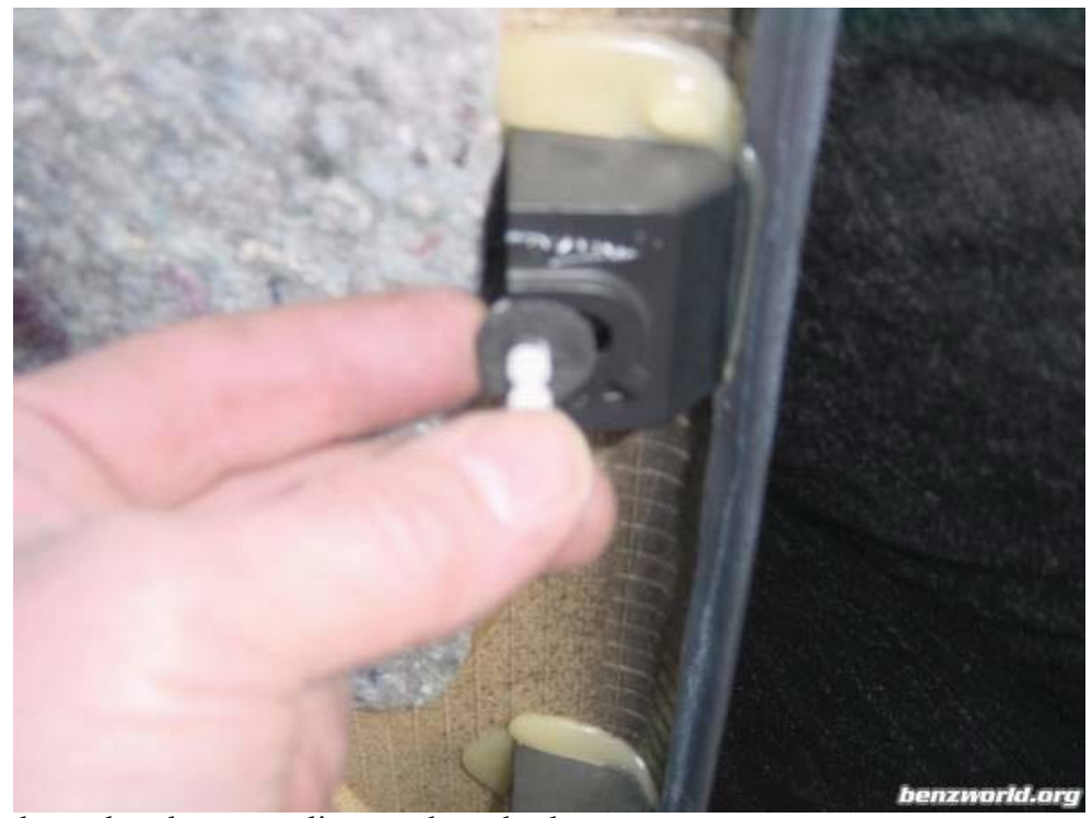
..put the lining back, and replace any clips you have broken.