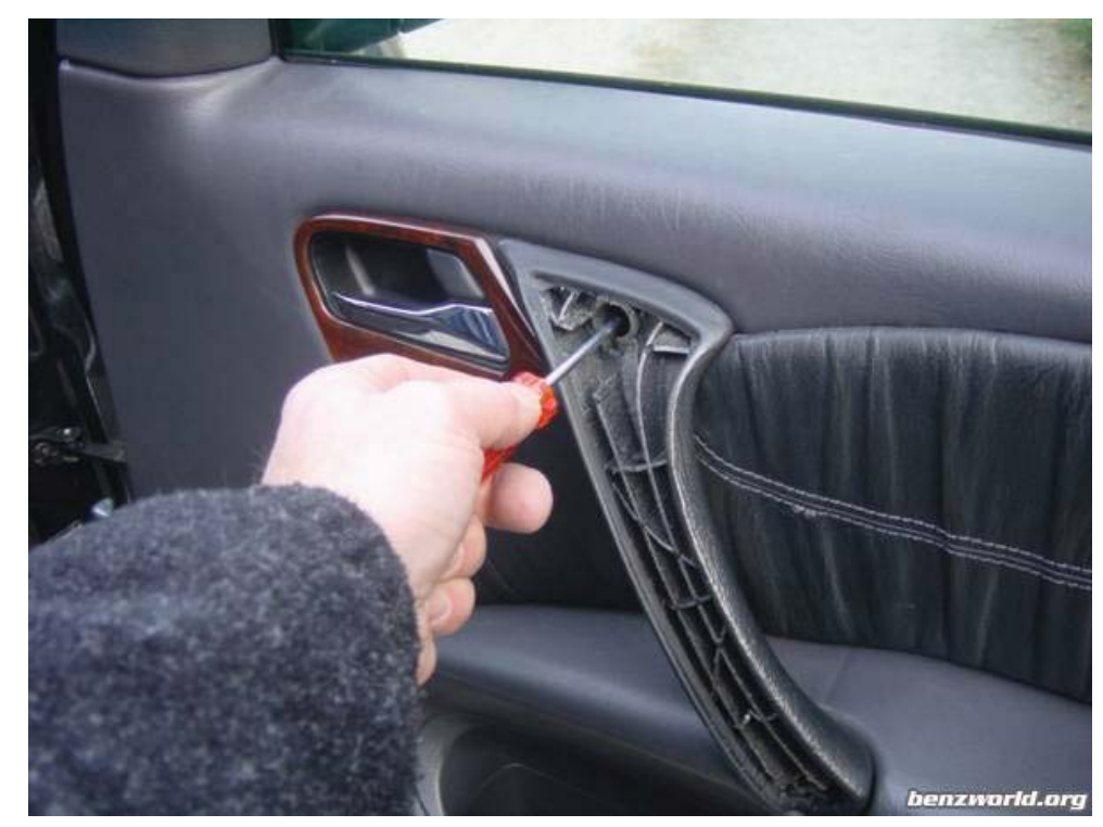
Screws! Door handle and SRS!