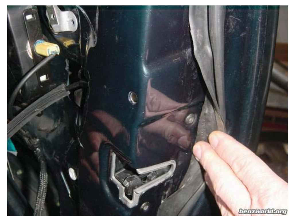
screw the lock onto the door!. This isn't really a good time to do it..... (I'll explain later!) ... you should really just let it dangle in there for the time being.