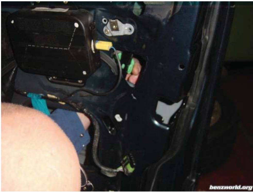
....ah much better .... why didn't we do that in the first place!