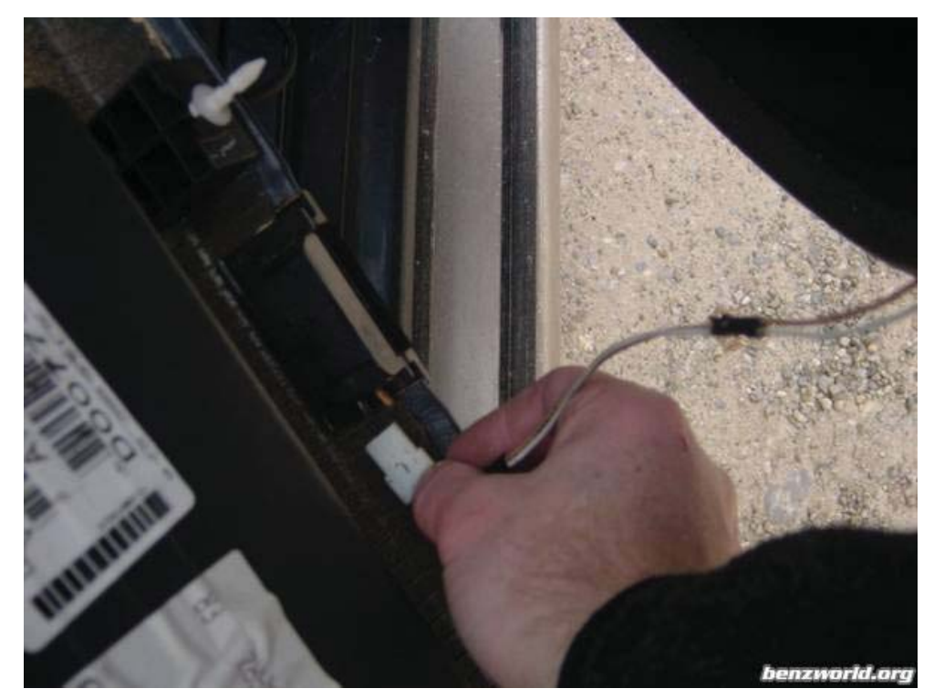
Replace the bottom door light connector