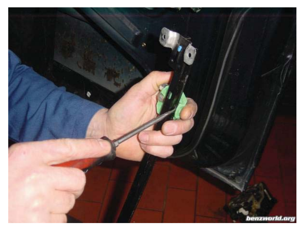
You can either unclip the lift connector , or unscrew the lock again! We chose to unscrew the lock as it was a lot easier to manouver the rail in place!