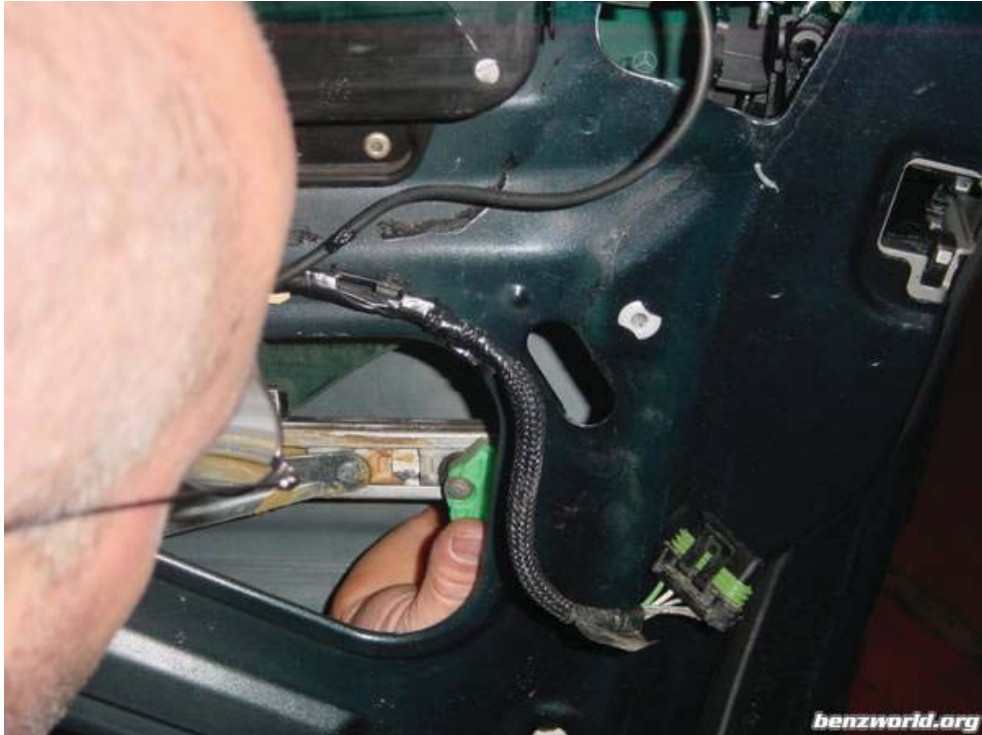
NOTE: As said earlier don't screw the lock in place until you have the guide rail in position.