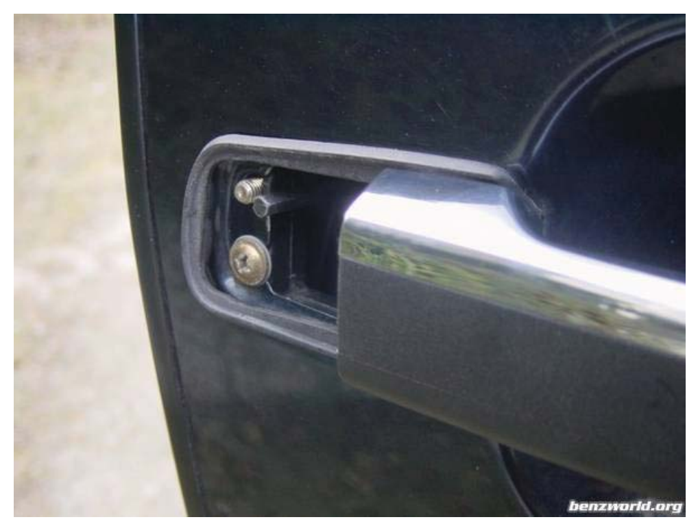
Get that hex key postioned before you put the outside door handle end piece on!