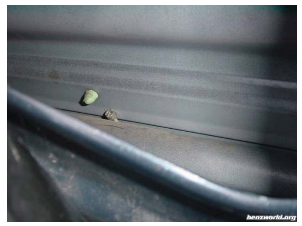
.. make sure that screw doesn't get lost!