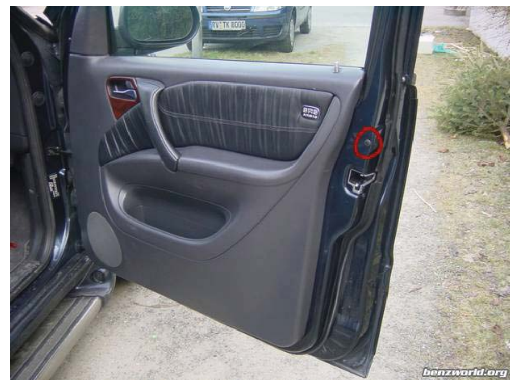
IT'S THE LITTLE RUBBER GROMIT THAT COVERS THE HOLE IN THE DOOR FOR THE HEX KEY (TO REMOVE THE OUTSIDE DOOR HANDLE)