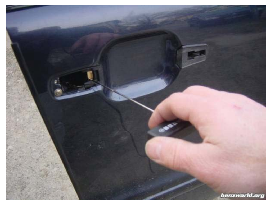
...you should know this from my previous thread. At the very least from the removal.

NOTE: Get that back end lever under the bronze inside part. Use a screwdriver ,or a MB removal hook (like I did)