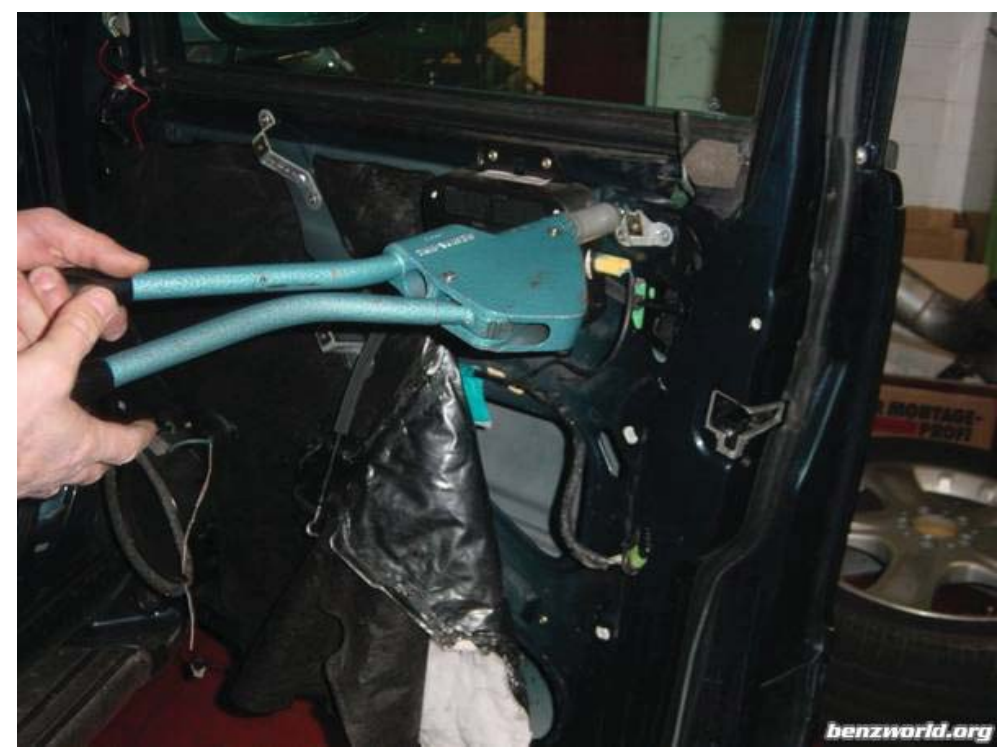
Now lets rivet that rail in place .... WOW that's what I call a rivet gun! .... You are going to use a lot of "elbow grease" (muscle) getting those rivets done using your everyday handyman store rivet gun!