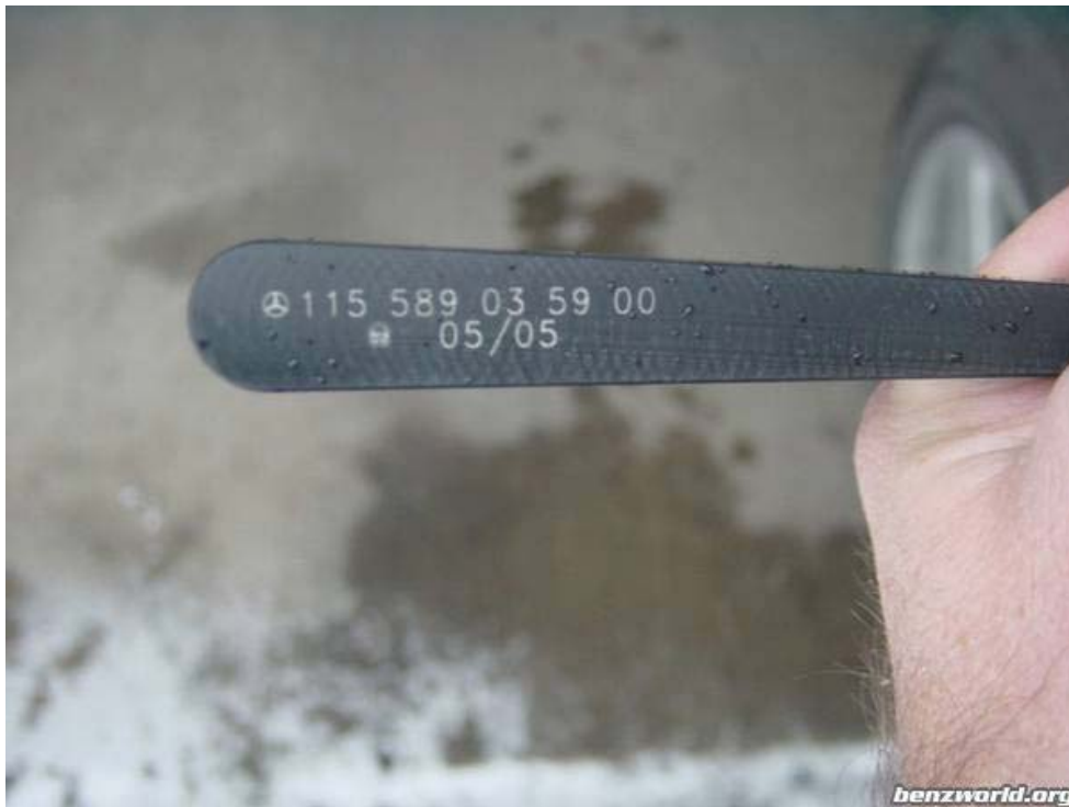
That trusty MB Wedge for the panel removal!