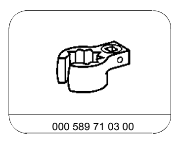
Box wrench bit